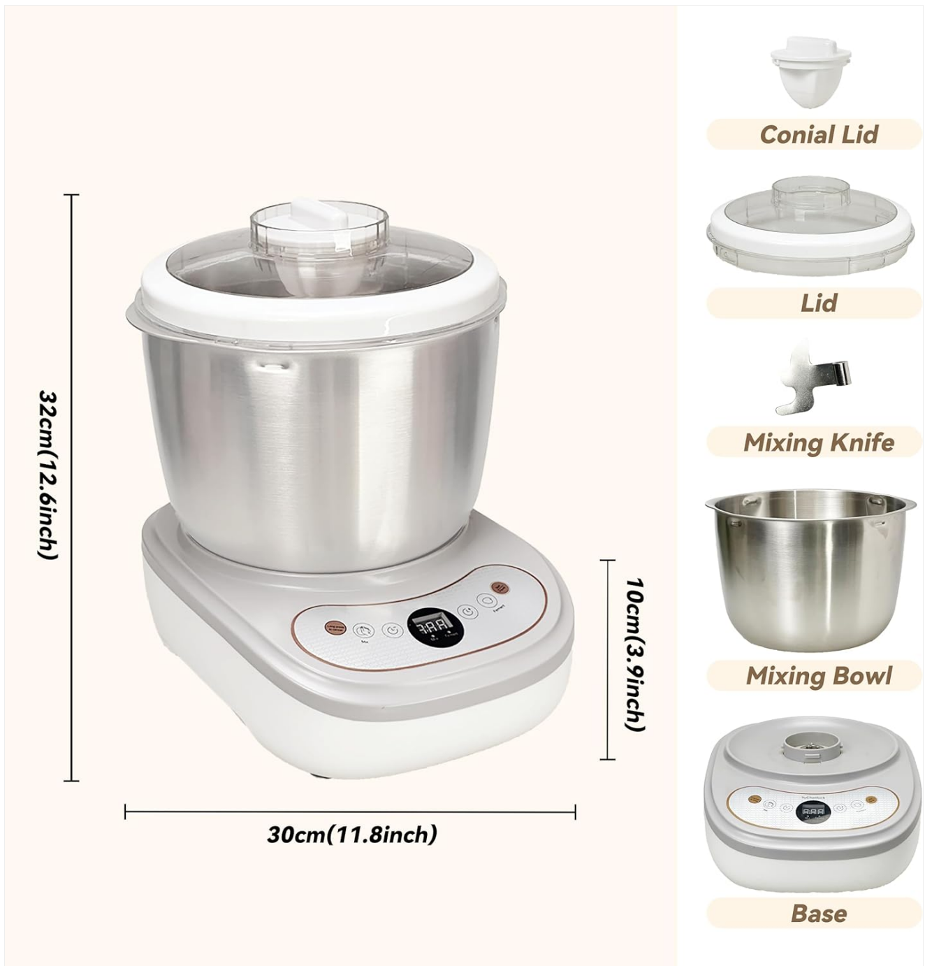
Figure 3.1: Main Components of the Dough Mixer