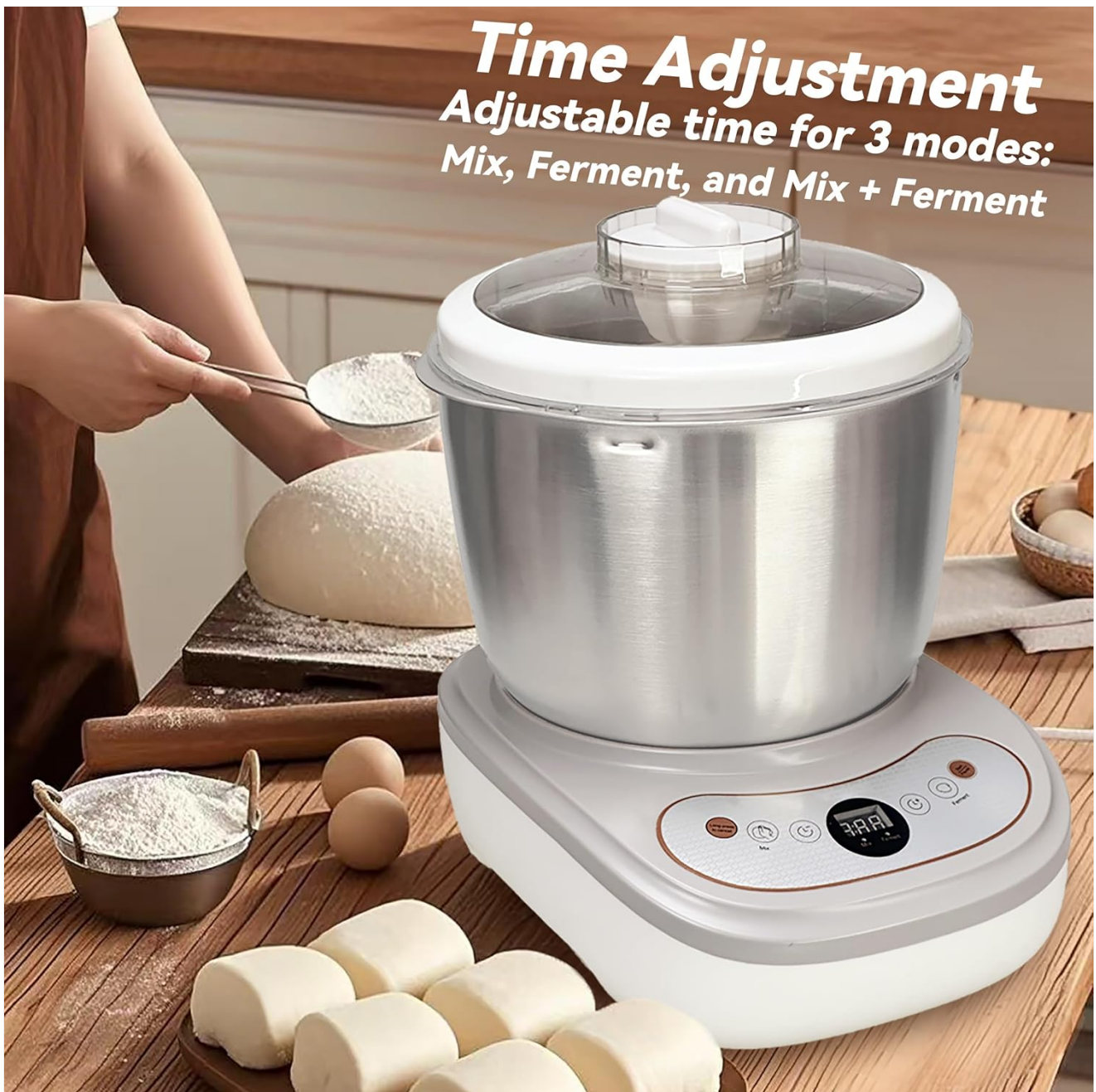
Figure 5.3: Control Panel with Time Adjustment