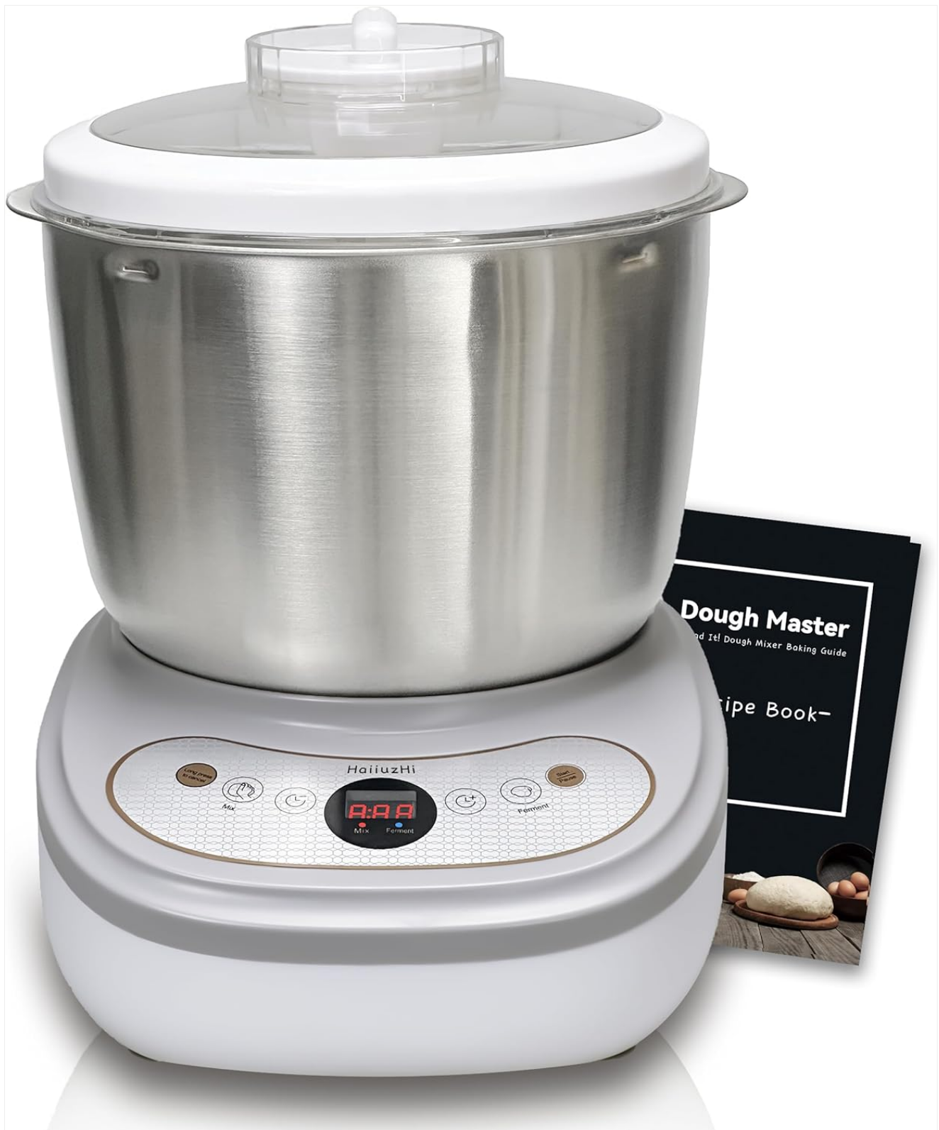
Figure 1.1: Haiuzhi 7L Dough Mixer (Model HZ-008)

The mixer is equipped with a 250W motor for consistent performance and a transparent lid for monitoring the mixing process. The fermentation function maintains an optimal temperature range of 77-100°F (25-38°C) for dough proofing.