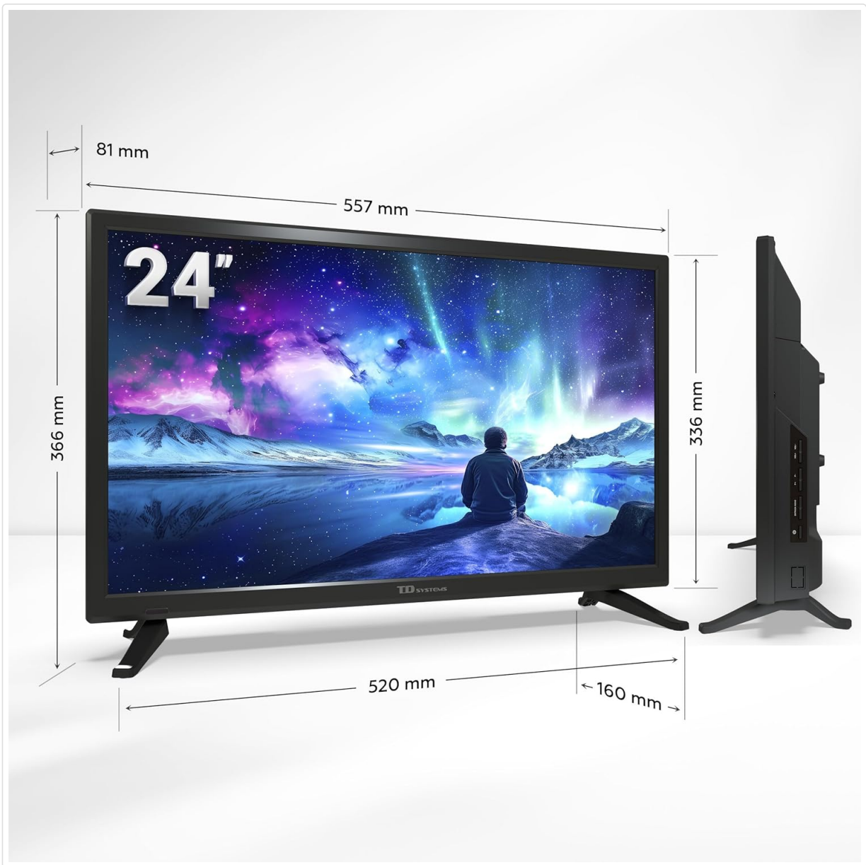
Figure 9.1: Product dimensions of the TD Systems PRIME24M20H.