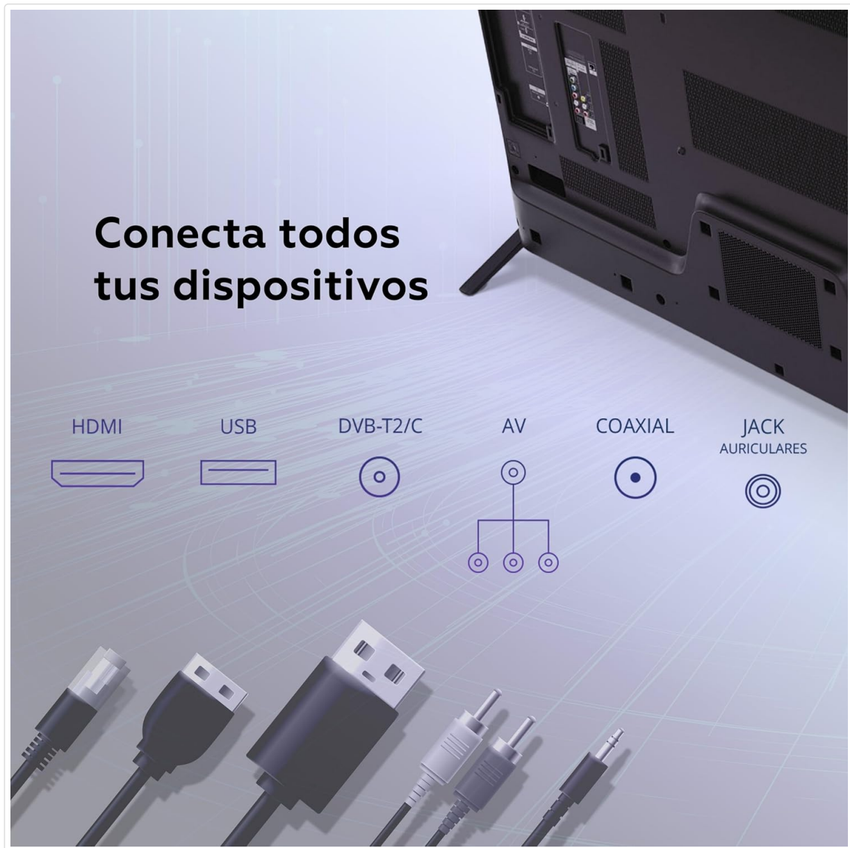
Figure 4.2: Rear view with connectivity ports including HDMI, USB, DVB-T2/C, AV, Coaxial, and Headphone Jack.