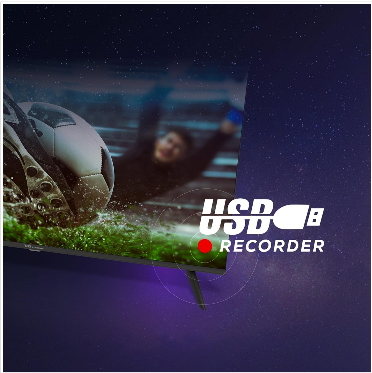
Figure 6.1: USB port for recording and media playback.