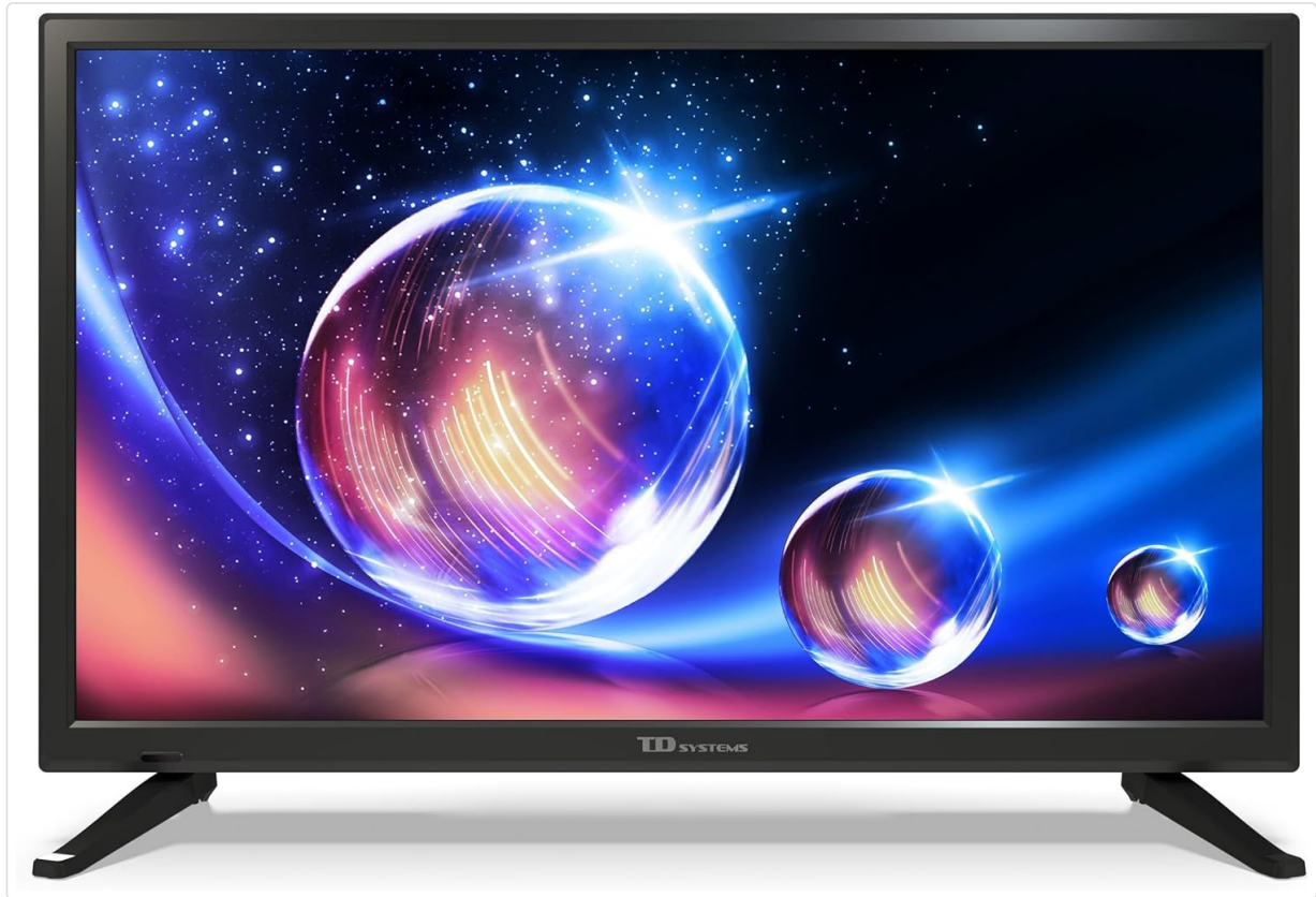
Figure 4.1: Front view of the TD Systems PRIME24M20H Television.

The TD Systems PRIME24M20H is a 24-inch HD Ready television featuring DLED technology for clear and defined images. It includes a DVB-T2/C tuner for terrestrial and cable channels, USB recording (PVR), and various connectivity options.