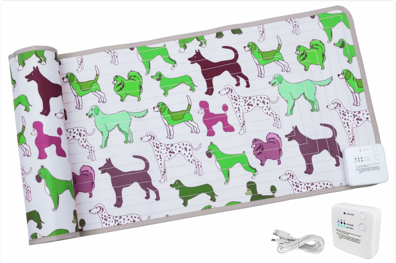
Image 1: DOGNESS Rechargeable Pet Shock Mat (Dog Cartoon design). This image shows the mat's overall appearance and size.

The DOGNESS Pet Shock Mat features a durable design with embedded wires that deliver a static pulse. It is powered by a rechargeable battery and offers three adjustable training modes. The mat includes an auto-deactivation feature to prevent overuse and comes with a test pen for functionality verification.