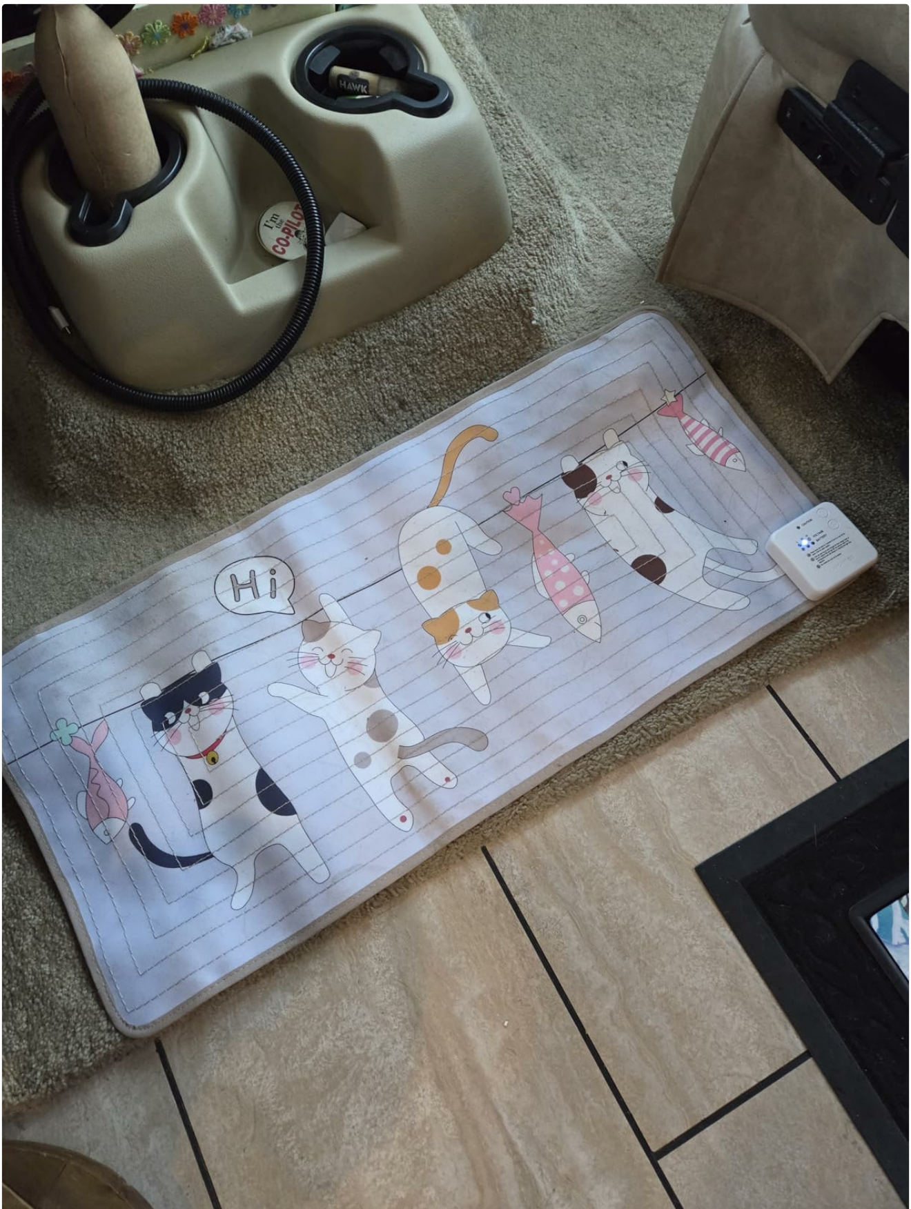
Image 3: Demonstrating the use of the test pen to confirm the mat's operation.