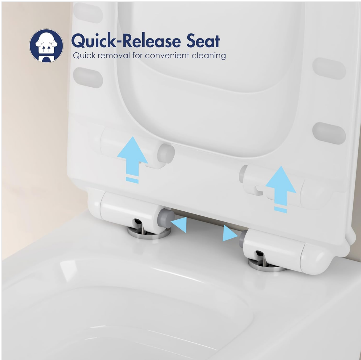
Figure 8: Quick-Release Seat. The seat can be easily removed for convenient and comprehensive cleaning.