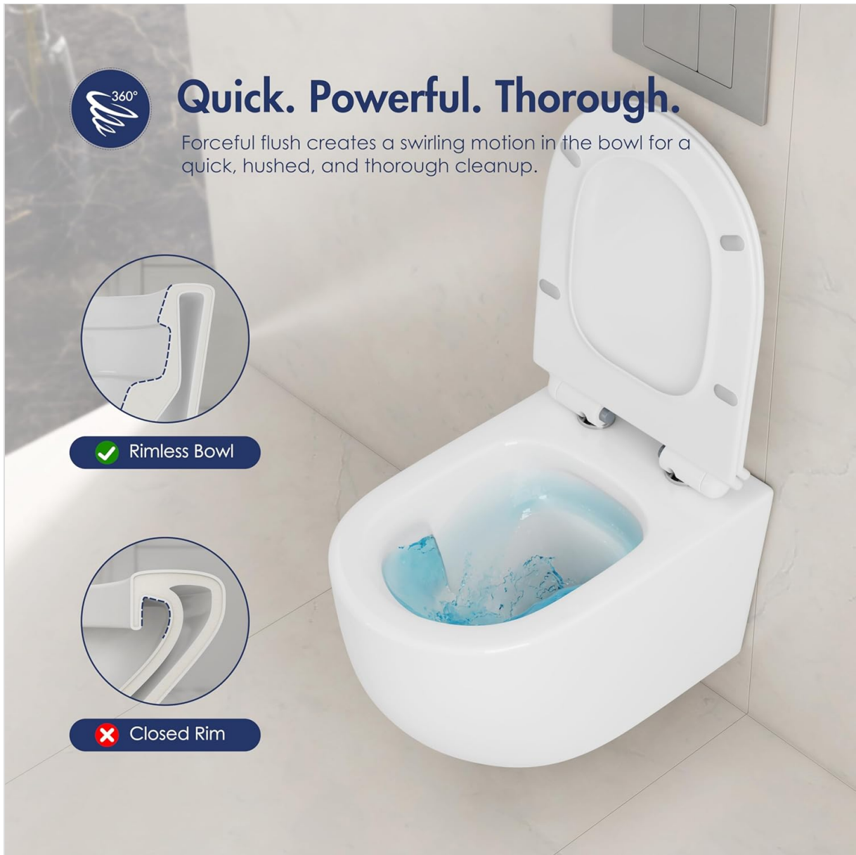
Figure 5: Powerful Flush. The rimless bowl design creates a swirling motion for effective and quiet cleaning.