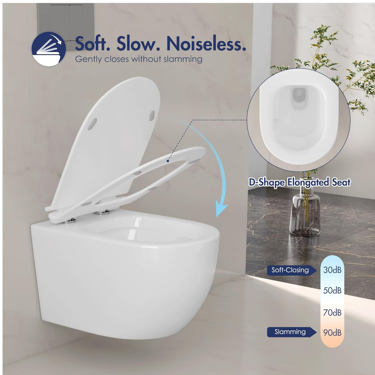
Figure 6: Soft-Close Seat. The seat gently closes without slamming, contributing to a quieter bathroom.