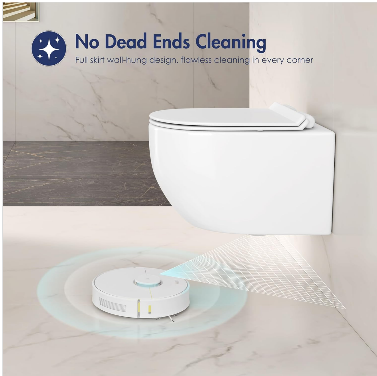
Figure 7: No Dead Ends Cleaning. The wall-hung design frees up floor space, allowing for easier and more thorough cleaning of the bathroom floor.