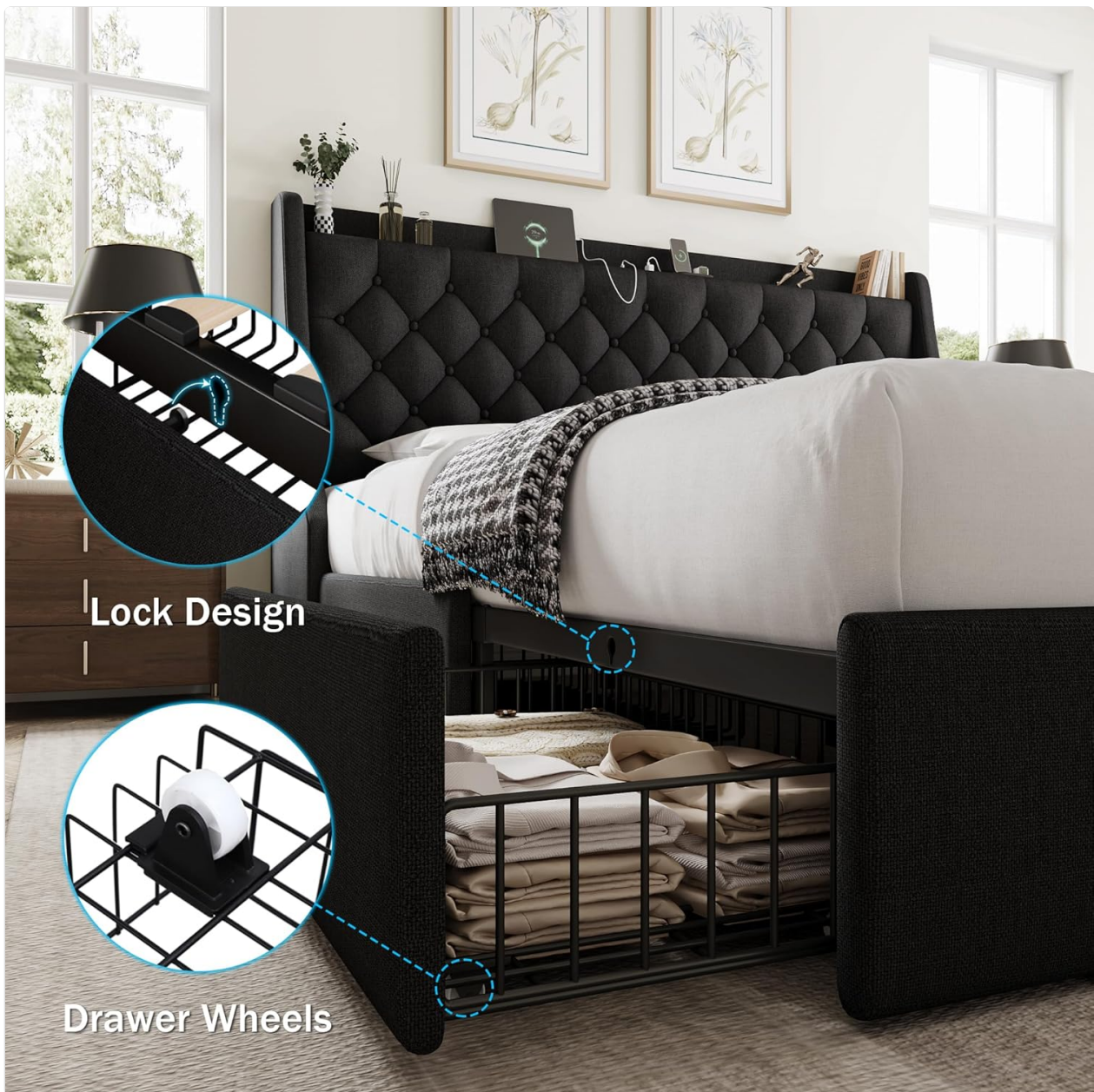
Figure 3.3: Illustration of the drawer lock mechanism and the smooth-rolling wheels for the storage drawers.