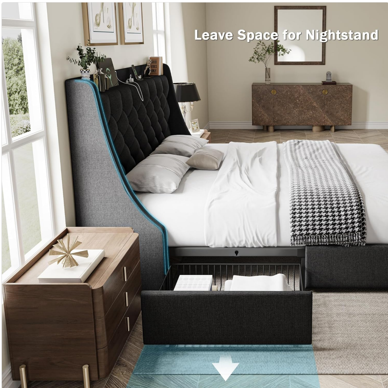
Figure 4.3: The bed frame design allows for ample space for nightstands on either side, even with drawers extended.