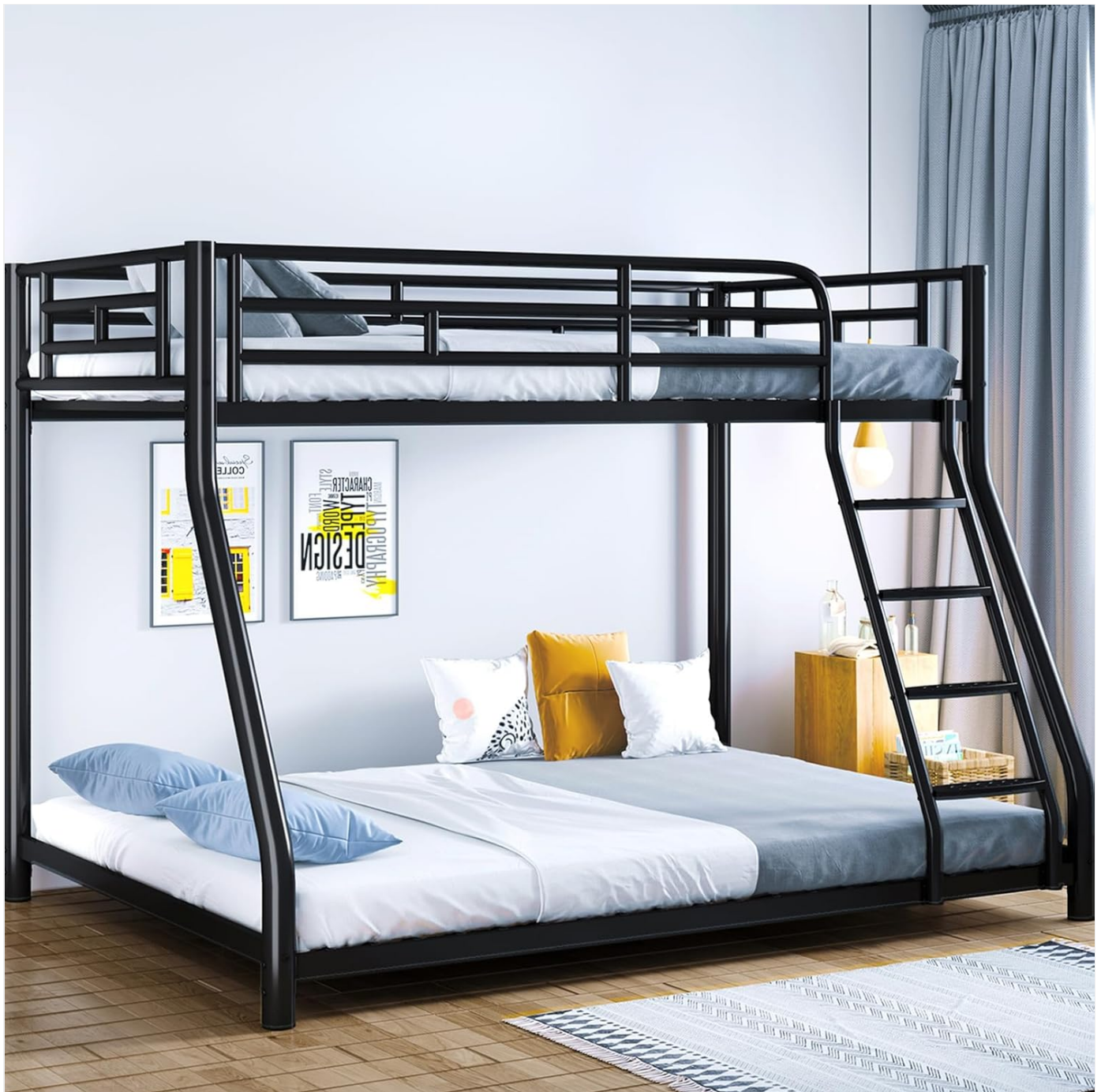
Image: The KAIFAM Metal Twin Over Full Bunk Bed, showcasing its design and functionality in a modern bedroom.