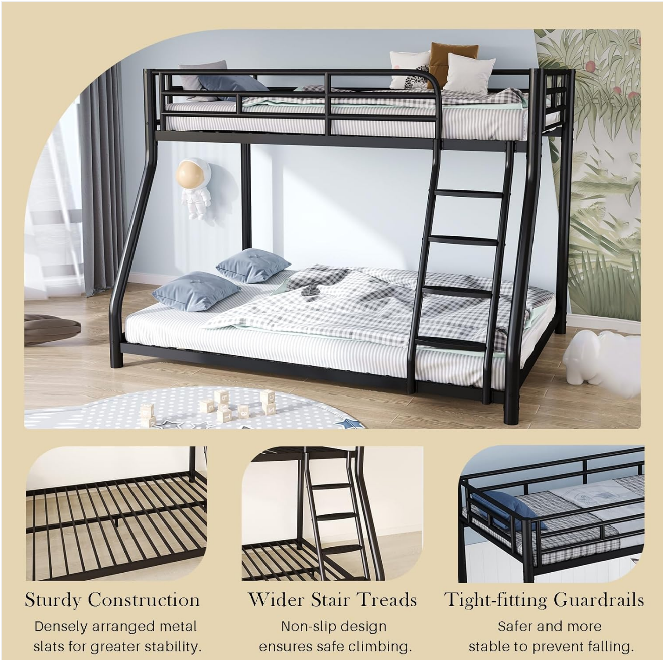
Image: Visual detail of the ladder attachment, sturdy construction, wider stair treads, and tight-fitting guardrails.

Hook the ladder onto the top bunk rail and secure the bottom to the lower frame using bolts (D) and washers (H).