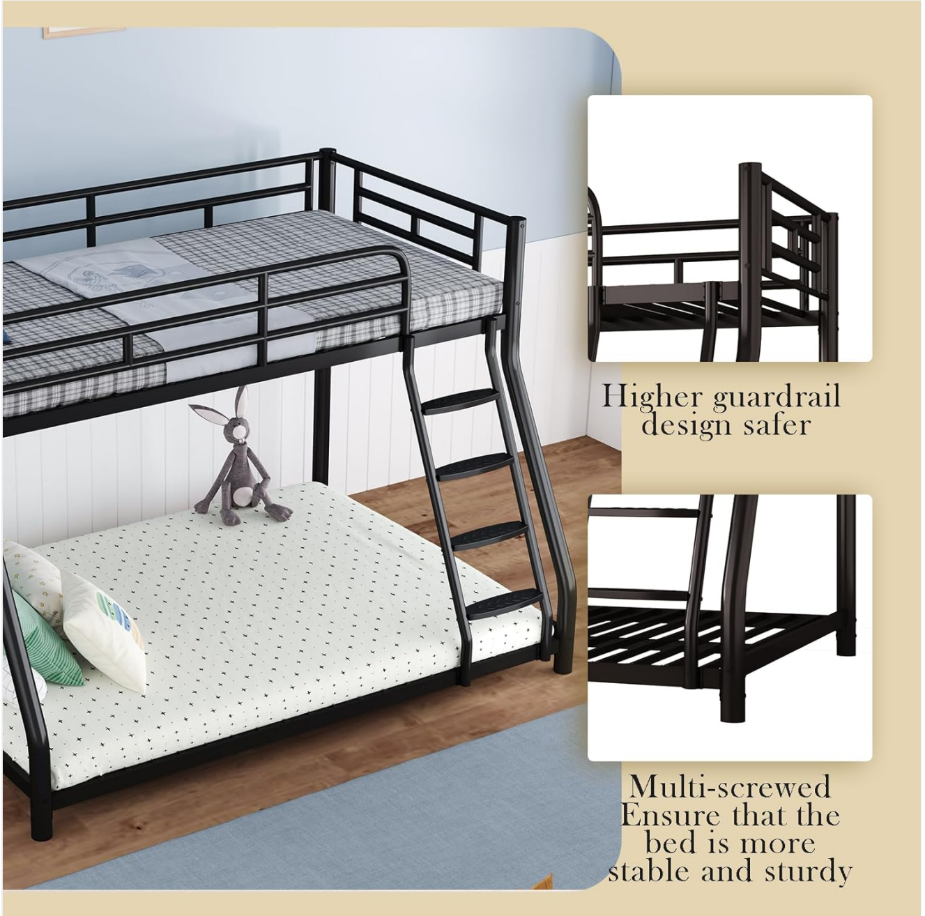
Image: Illustration of connecting the side frames and crossbar for the bottom bunk, showing guardrail and multi-screwed details.

plastic feet (K) to the bottom of the frames.