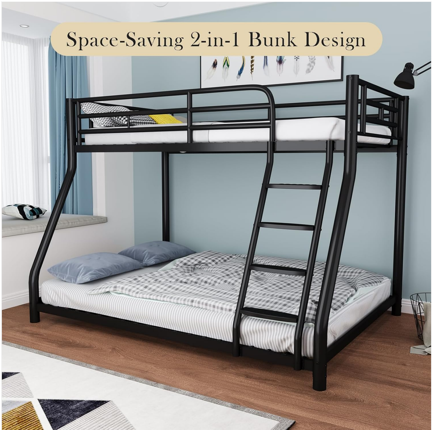
Image: The bunk bed's space-saving design, ideal for maximizing room utility.