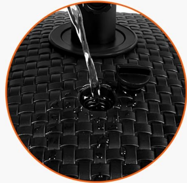
Top Water Inlet For adding water and sand