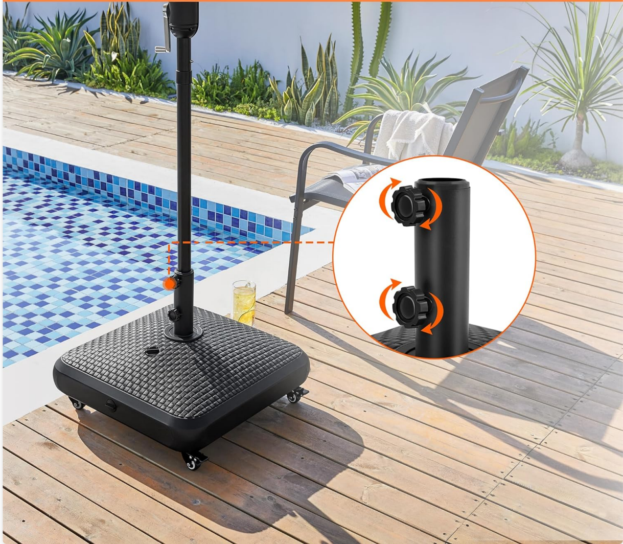
Image: Close-up of the umbrella pole holder showing the two thumb screws, with arrows indicating the tightening direction to keep the umbrella fixed and secure.