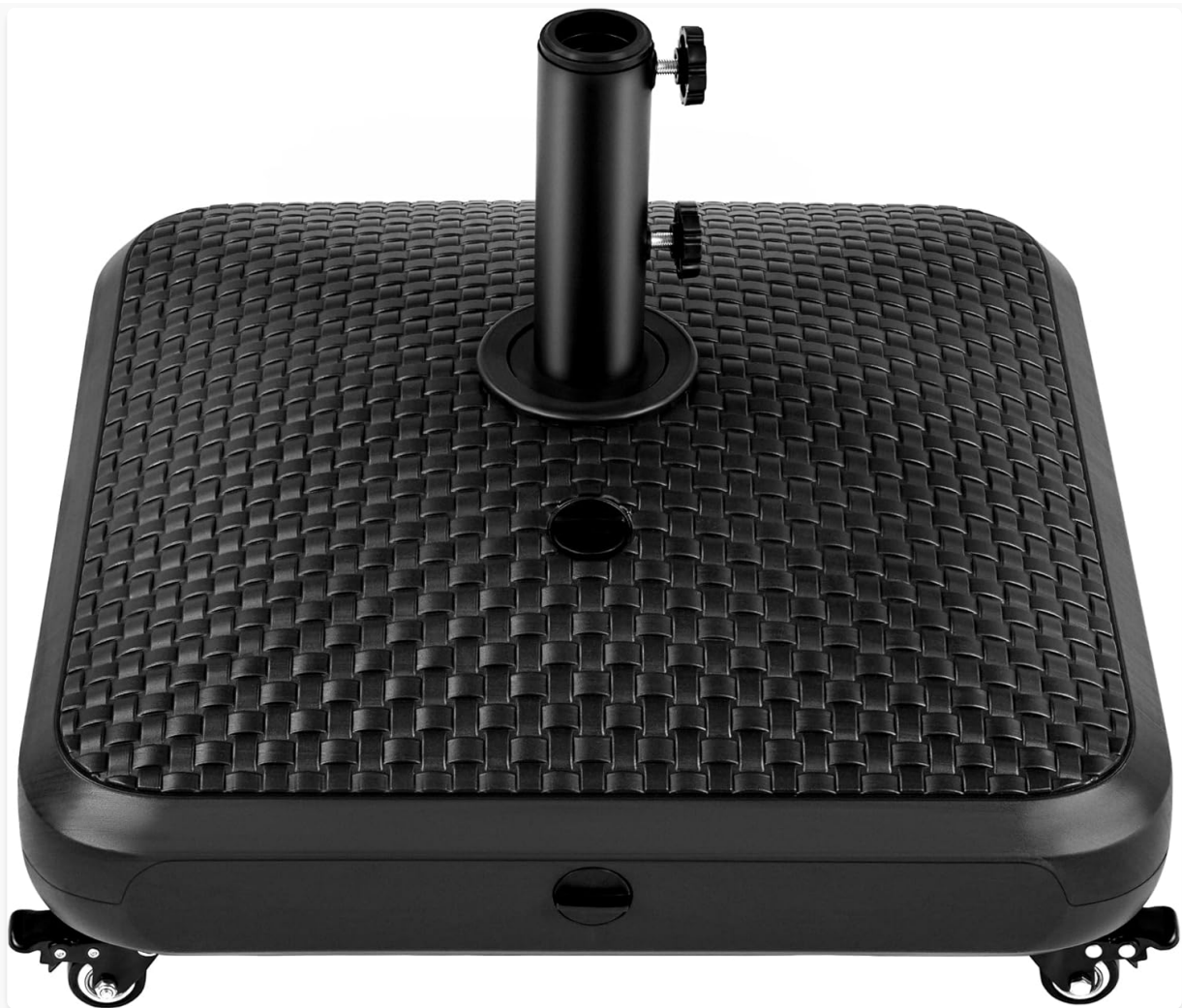
Image: The Yaheetech Fillable Mobile Umbrella Base, showcasing its square, faux-rattan textured design and four integrated wheels.