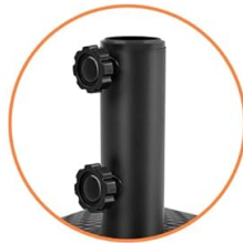
Dual Thumb Screws