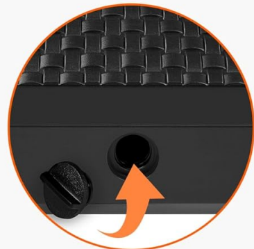
Side Drainage Outlet Convenient for emptying the filling material

Image: Diagram showing the top water inlet for adding water and sand, and the side drainage outlet for convenient emptying of filling material. Indicates water capacity of 37L and sand/water mix capacity of 123 lbs.