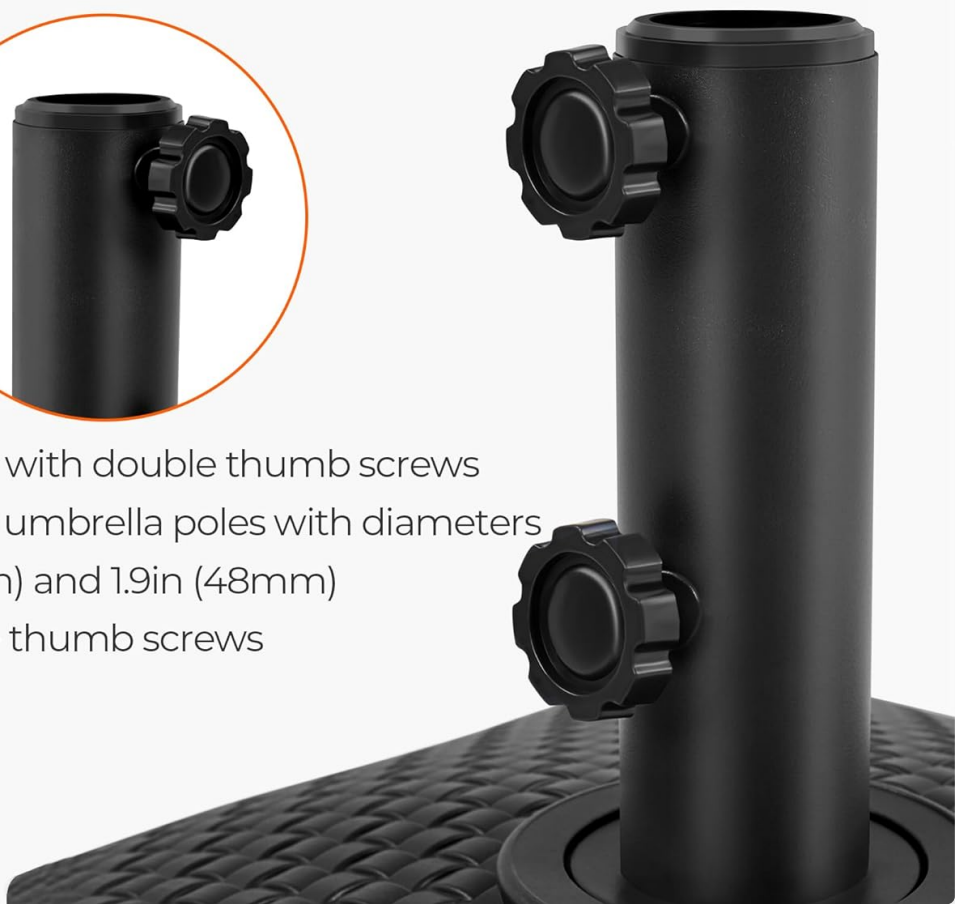
Image: Details on umbrella pole compatibility, showing the sturdy base with double thumb screws and suitability for umbrella poles with diameters of 1.5in (38mm) and 1.9in (48mm).