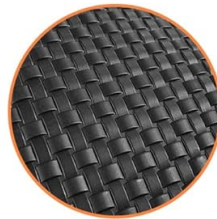
Elegant Textured Design