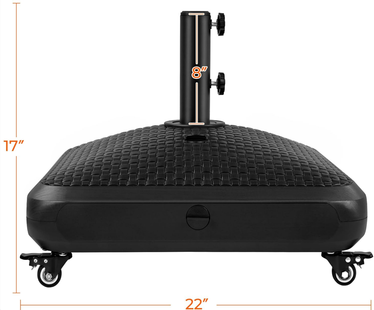
Image: Diagram illustrating the key dimensions of the umbrella base: 22 inches in length, 22 inches in width, and 17 inches in height, with the pole holder extending 8 inches above the base.