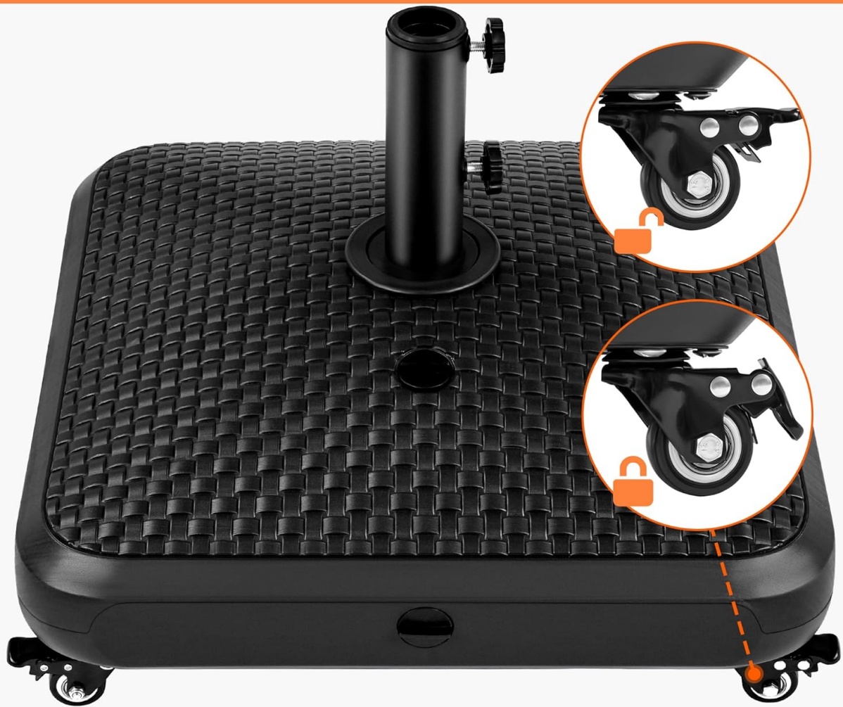
Image: Illustration demonstrating the four lockable universal wheels, highlighting the locked and unlocked states, which make movement effortless while keeping the base in place.

Four lockable universal wheels make movement effortless while keeping the base in place