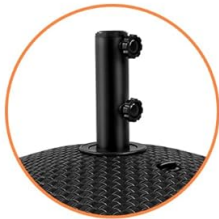
Sturdy Iron Metal Tubing