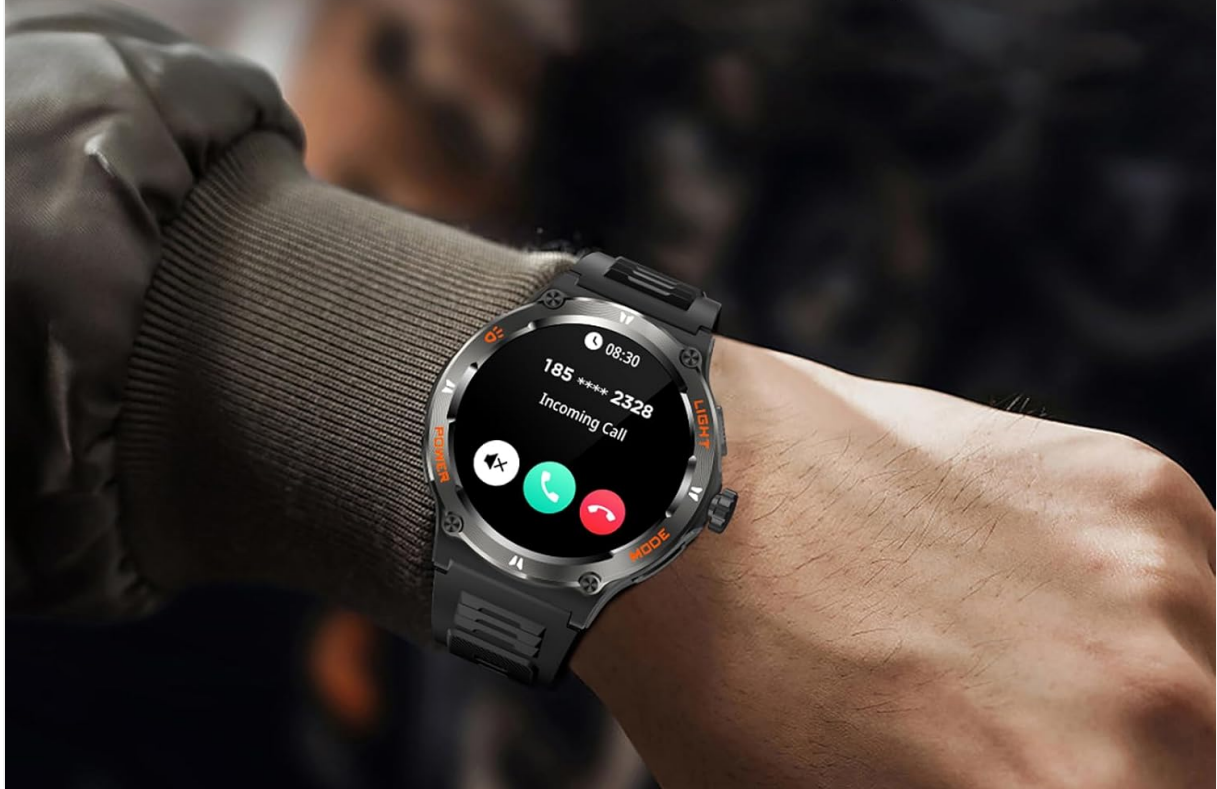
Image: Bluetooth connection and call functionality.

Hands free in anytime and anywhere in order to let the answer more efficiently