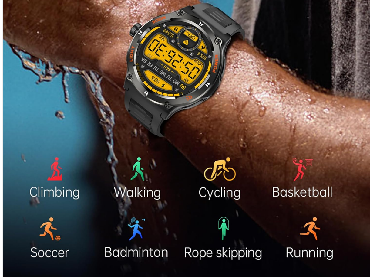
Image: Multi-sport modes available on the smartwatch.