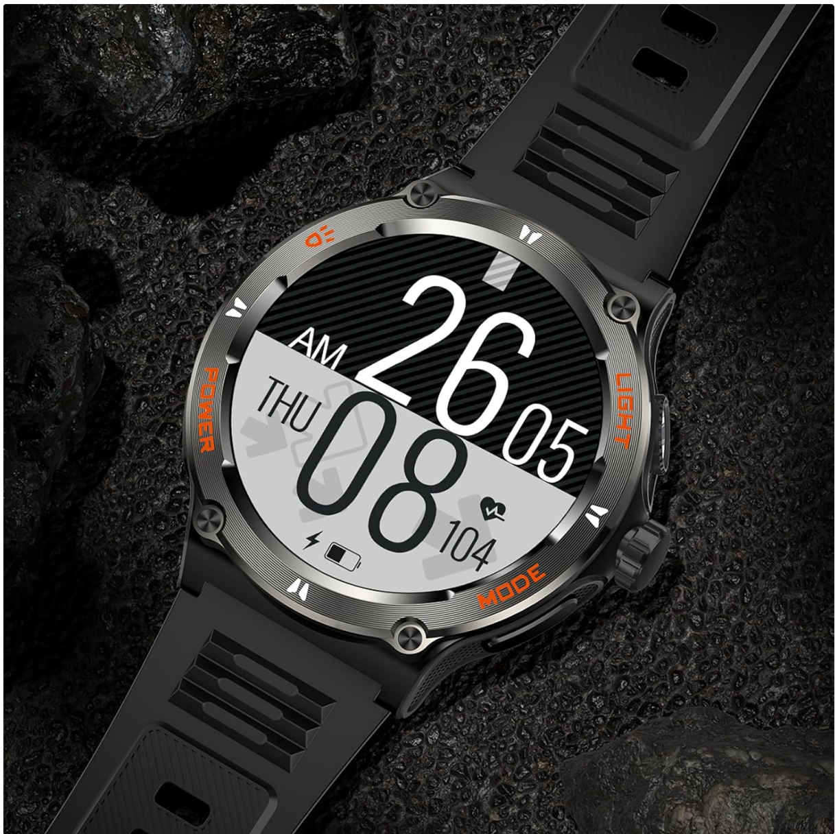
Image: Watch display showing time, date, and heart rate.