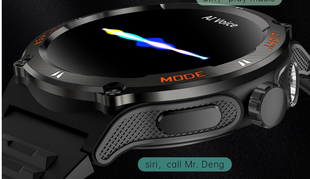
Image: AI voice assistant interface.