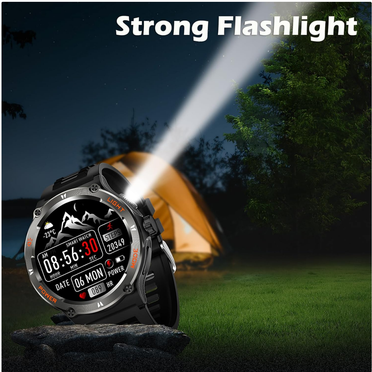
Image: Smartwatch flashlight in use during nighttime.