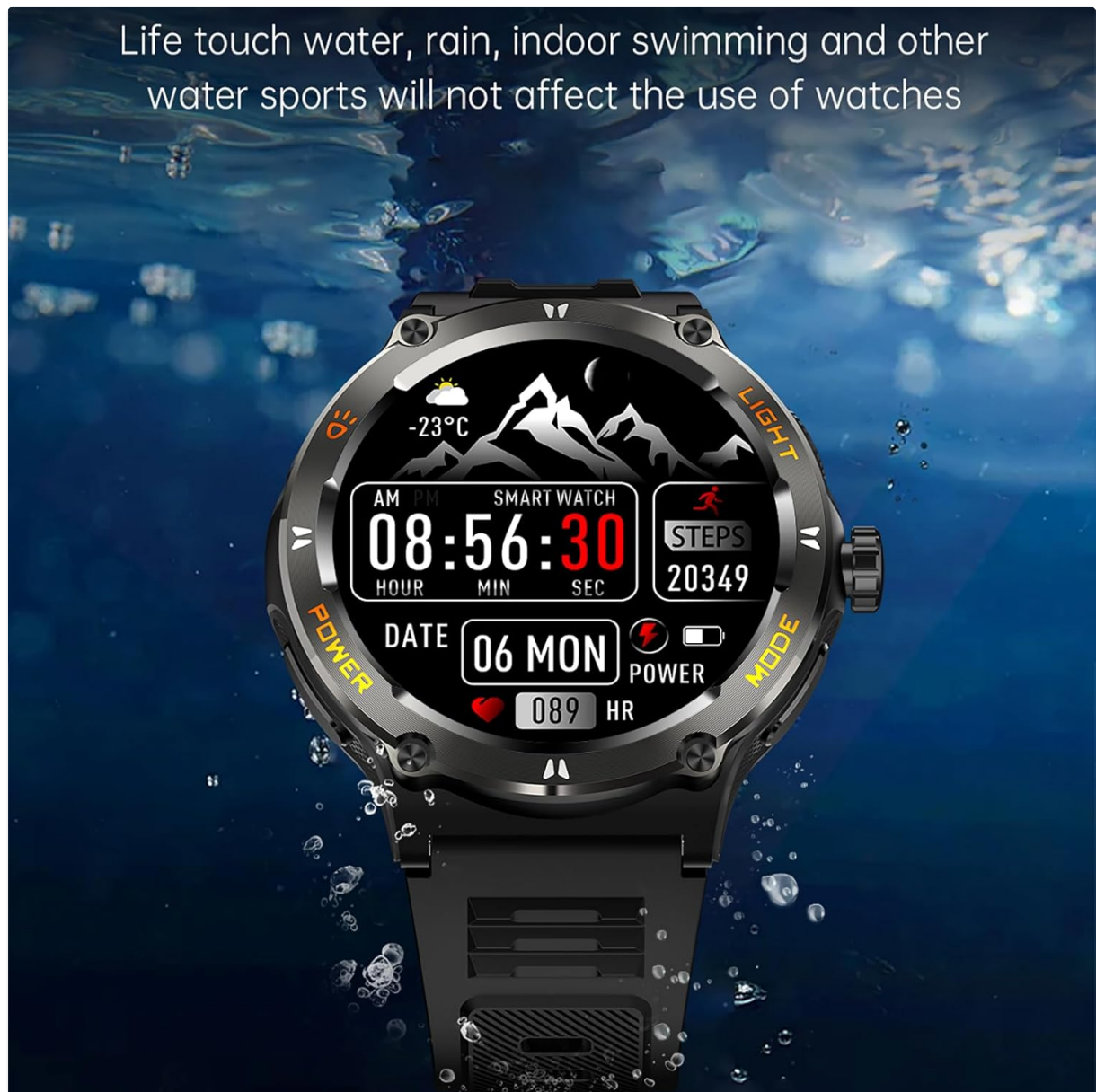
Image: Smartwatch demonstrating water resistance.