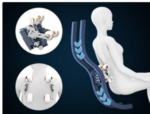
Image 4.3: Close-up of the SL track massage mechanism, showing the rollers and their movement.