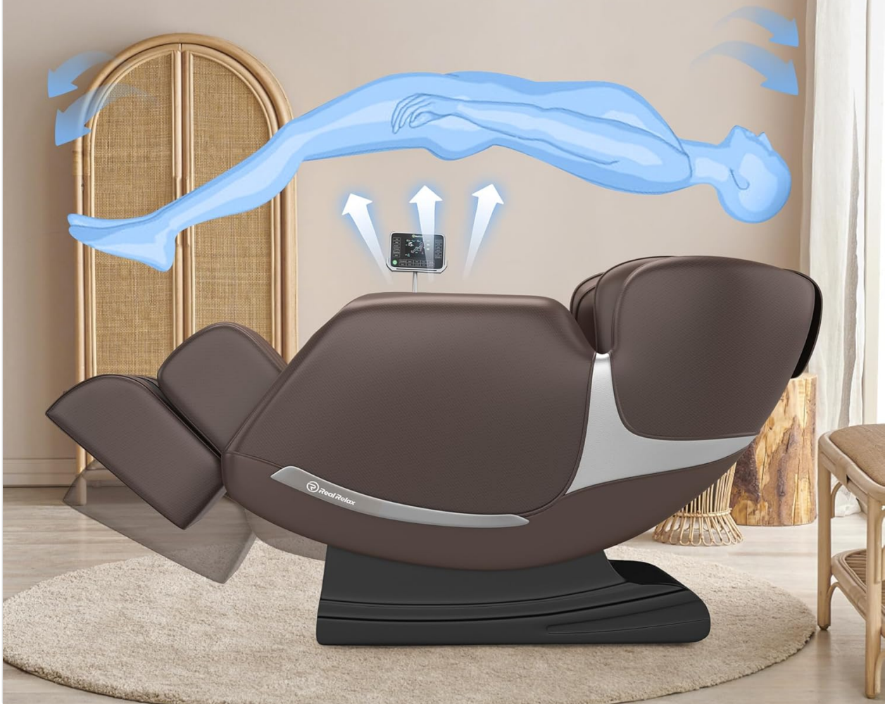
Image 4.4: Visual representation of the Thai stretching massage function.