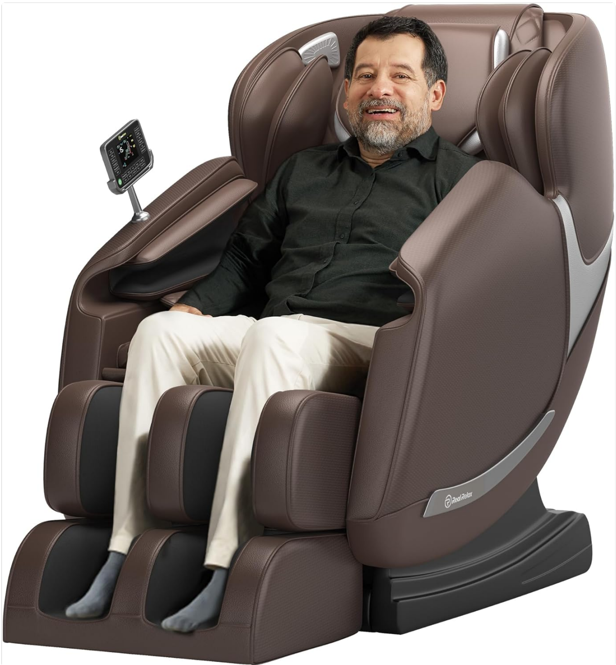
Image 2.1: The Real Relax 2025 Massage Chair Favor 04 ADV in brown, featuring a person seated comfortably, demonstrating its design and size.

The chair offers personalized control through both a dedicated LCD interface and a mobile application, allowing users to customize their massage preferences.