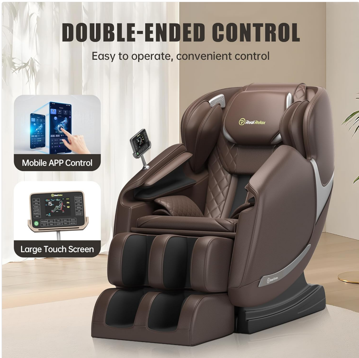
Image 4.1: The dual control options for the massage chair, featuring both the mobile application and the large LCD touch screen.

The massage chair can be controlled using either the integrated LCD touch screen or a dedicated mobile application. Both interfaces allow for selection of massage modes, intensity adjustments, and other functions.