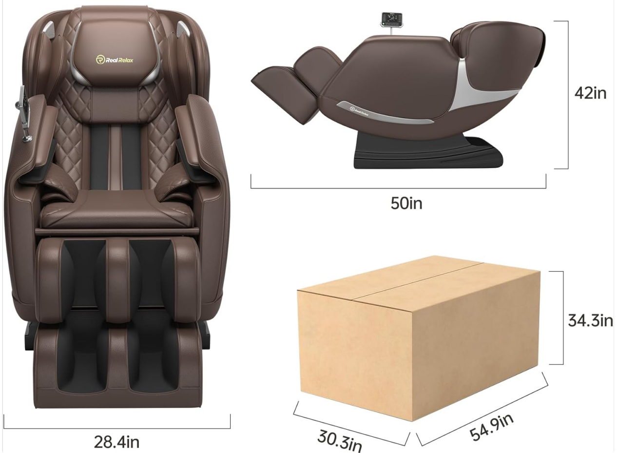
Image 3.1: Dimensions of the Real Relax massage chair (50in D x 28.4in W x 42in H) and its packaging box (54.9in L x 30.3in W x 34.3in H).