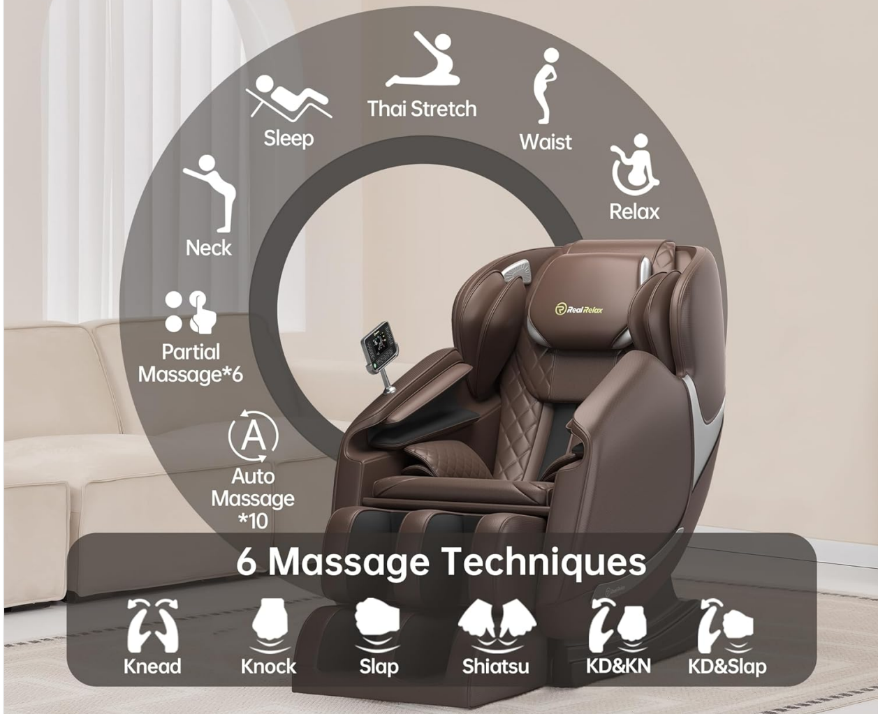
Image 4.5: Overview of the 21 auto massage modes and 6 massage techniques.