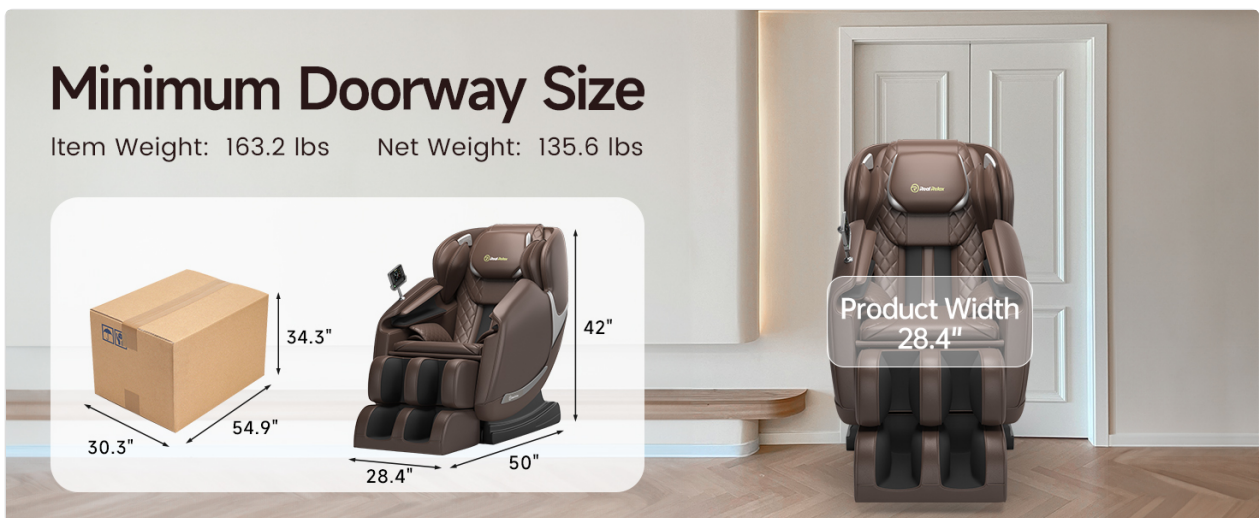
Image 3.2: Minimum doorway size requirement for the massage chair, indicating a product width of 28.4 inches.

Due to the chair's weight (approximately 163 pounds), it is recommended to have assistance when moving or positioning the unit to prevent injury or damage.