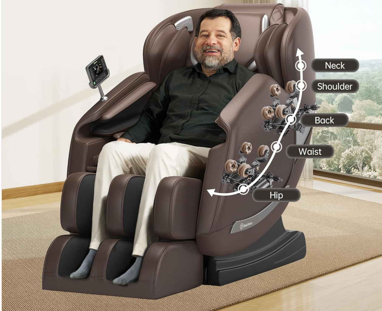
Image 4.2: Illustration of the SL track back massage, detailing the path from neck to hip.