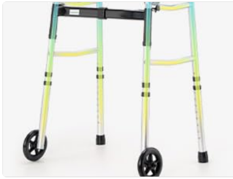
Image 4.1: Detail of the height adjustment pin and holes on the walker leg.