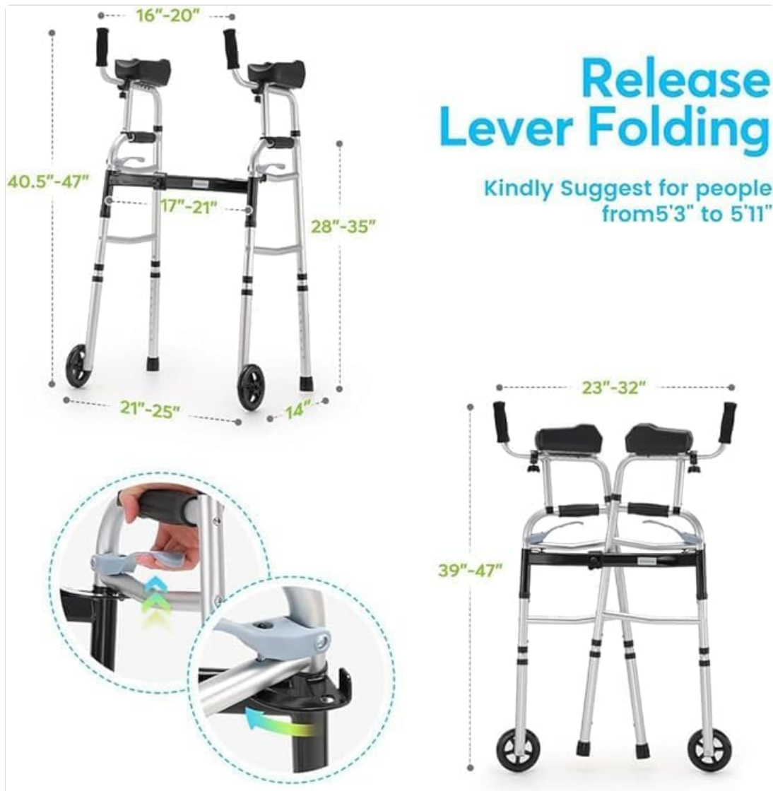
Image 3.1: Visual guide to the walker's dimensions and the release lever for folding.

To fold the walker for storage or transport, locate the release levers on each side of the frame. Lift these levers to collapse the walker. The compact design allows it to fit through narrow doorways and in car trunks.