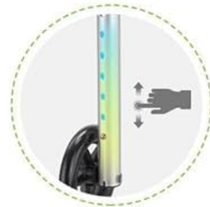
8 Level Adjustable Height