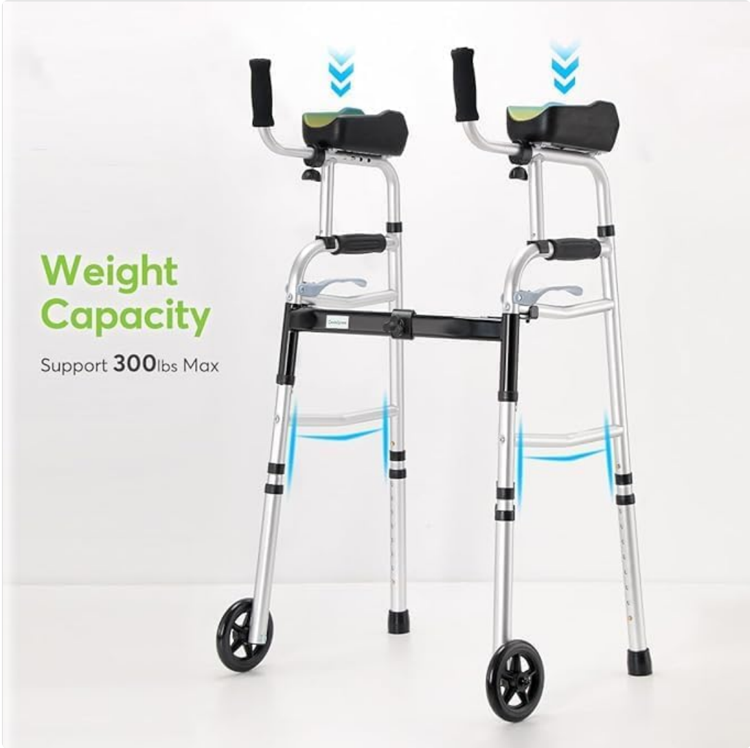
Image 8.1: The OasisSpace Folding Walker is designed to support a maximum weight capacity of 300 lbs.