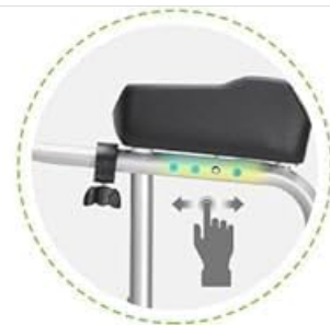
Adjustable Padded Armrest