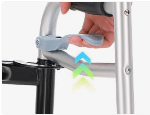
Image 3.2: Detail of the folding release lever, indicating how to operate it for compact storage.