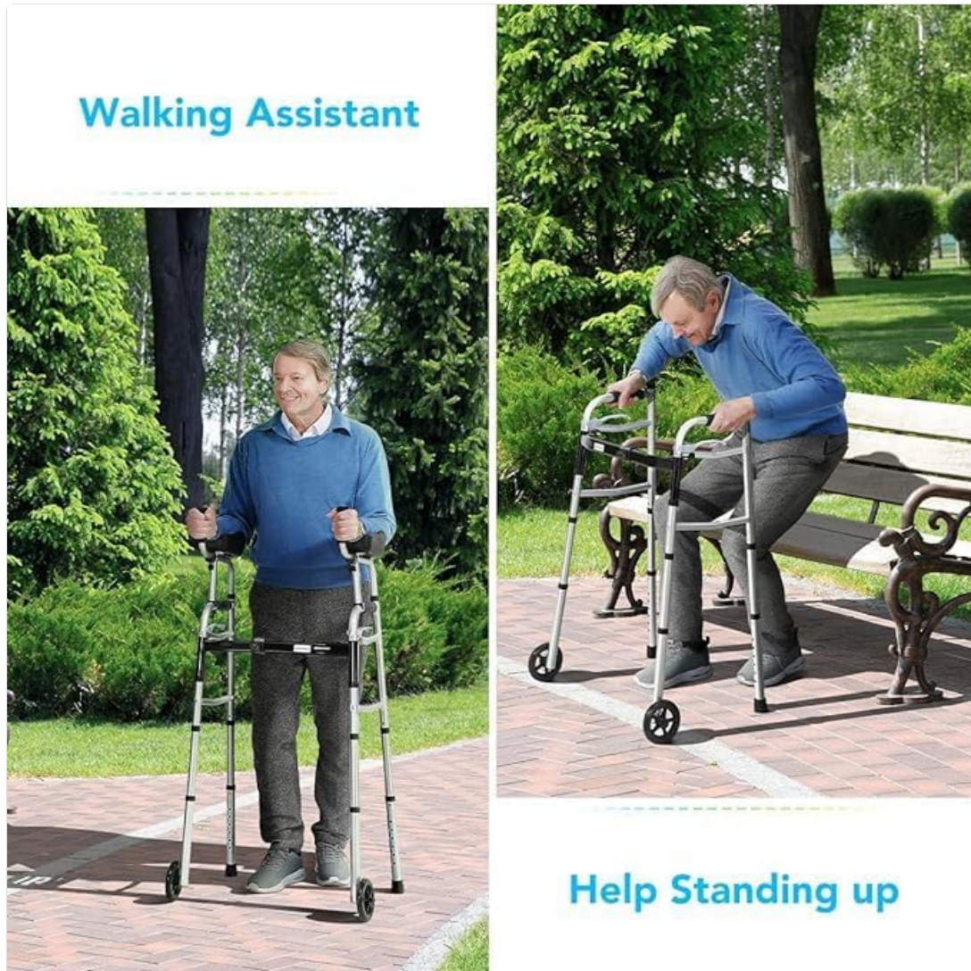
Image 5.1: The walker assists users in maintaining an upright posture while walking and provides support for standing up.