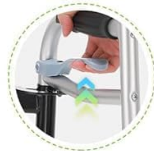
Release Lever for Folding