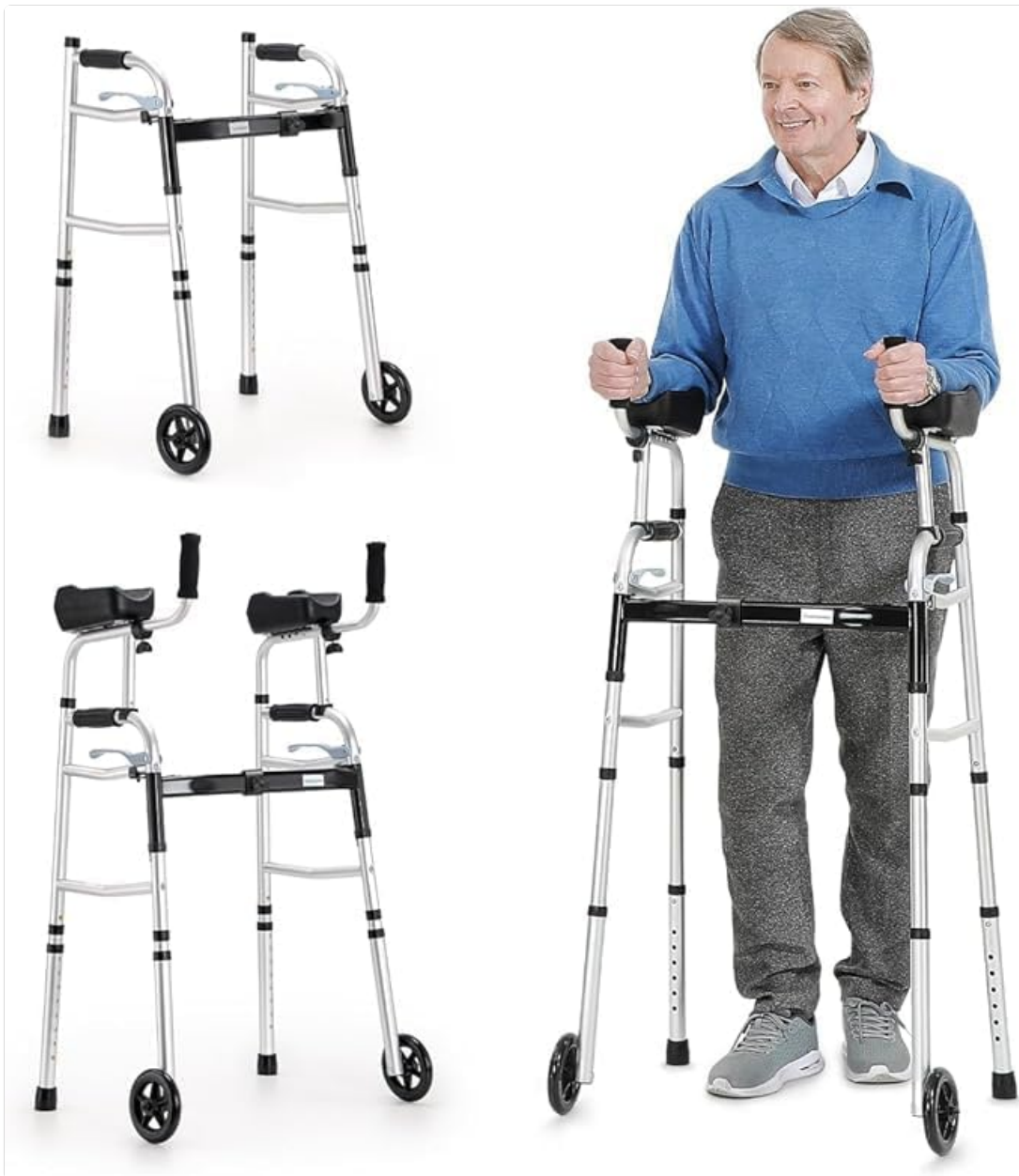
Image 1.1: The OasisSpace Folding Walker, showcasing its design with 5-inch wheels and padded armrests.