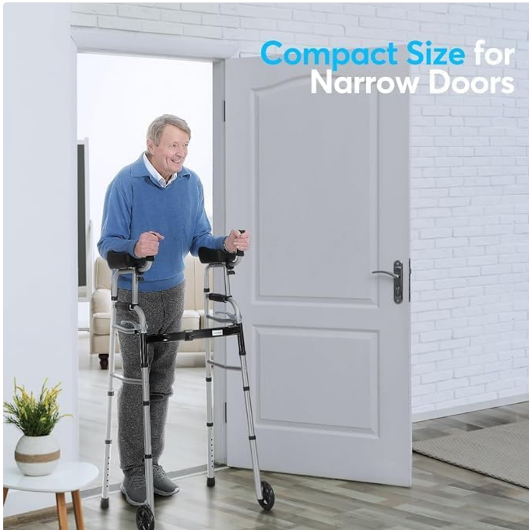
Image 3.3: The walker's compact size allows it to easily pass through narrow doorways.