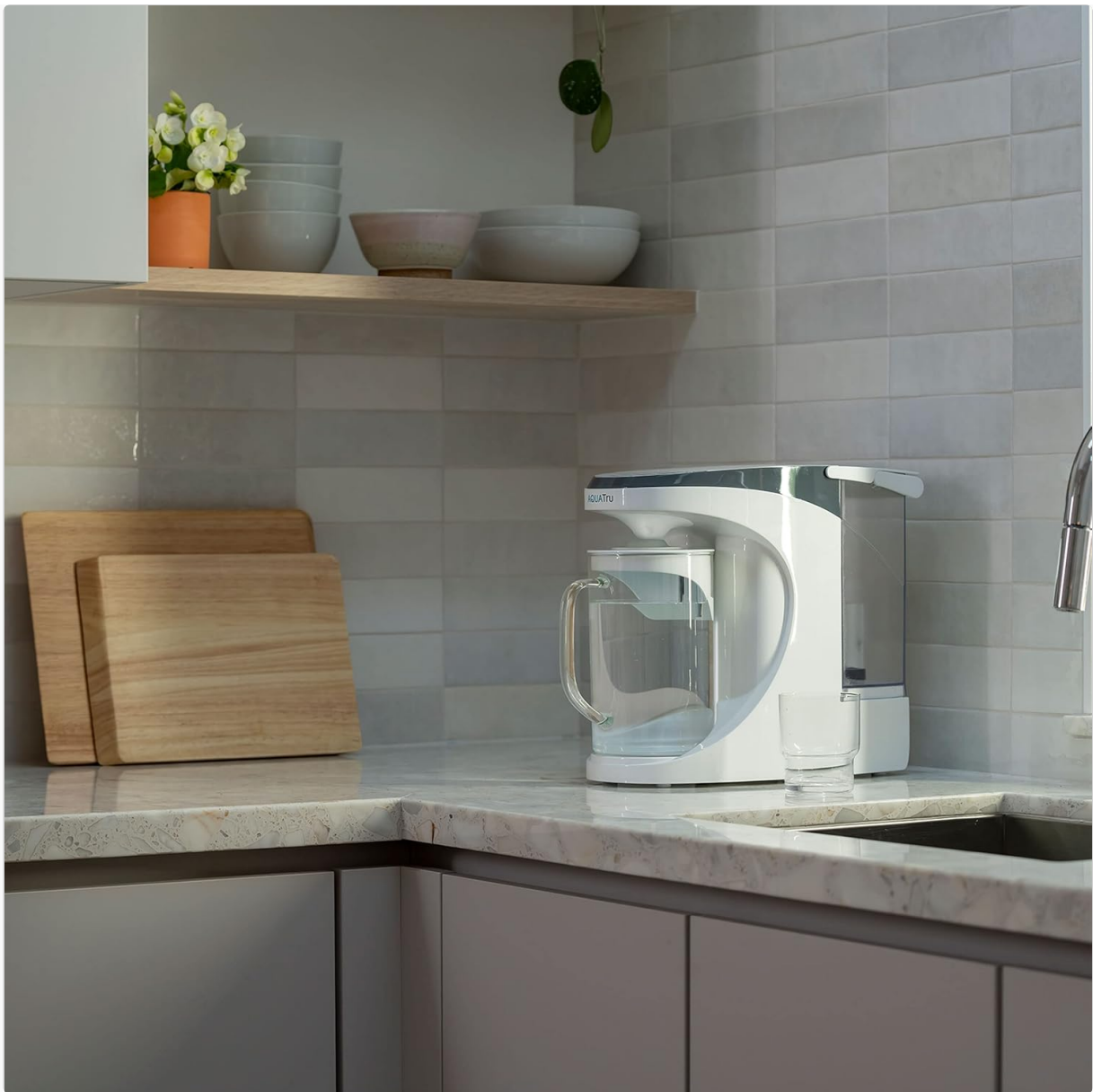
Image: Pouring purified water from the glass carafe.