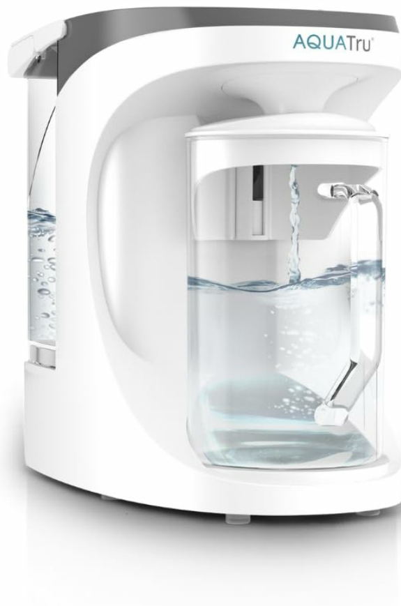
Image: Front view of the Aqua TRU Carafe water purifier with its glass carafe.