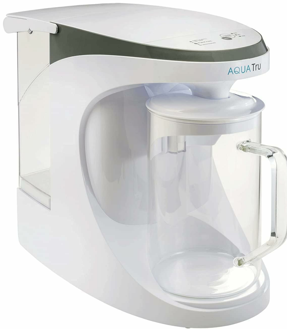
Image: Aqua TRU Carafe during the purification process.