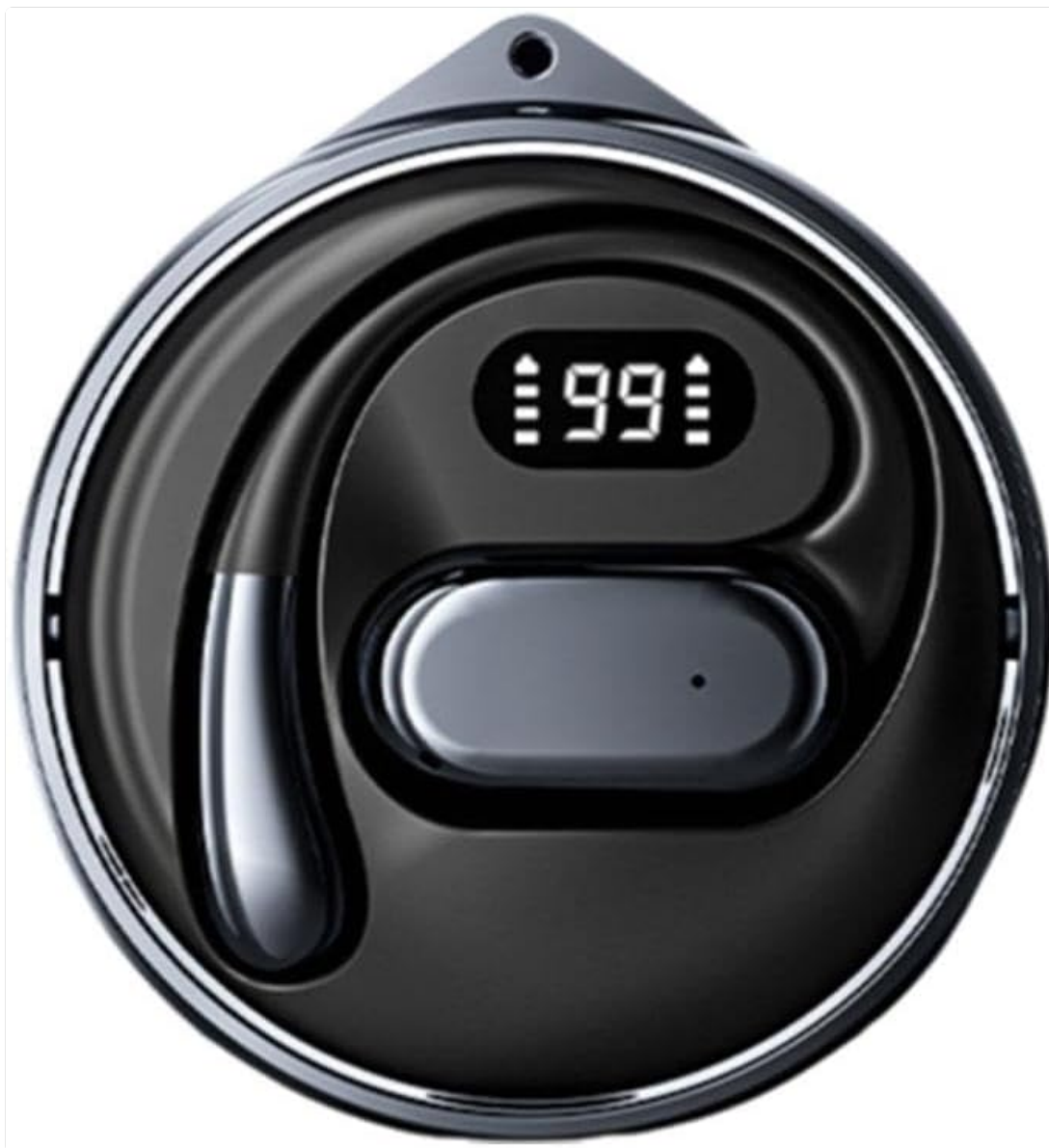
Image: The D88 headphone nestled in its charging case, featuring the digital display that shows battery percentage, crucial for initial setup and charging.