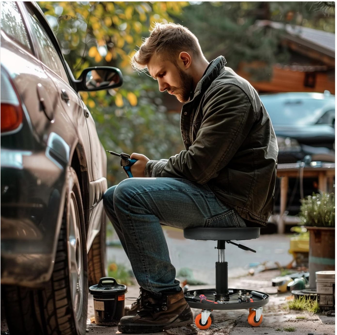
Image 1.1: The HOMCOM Rolling Mechanic Stool in a workshop setting.