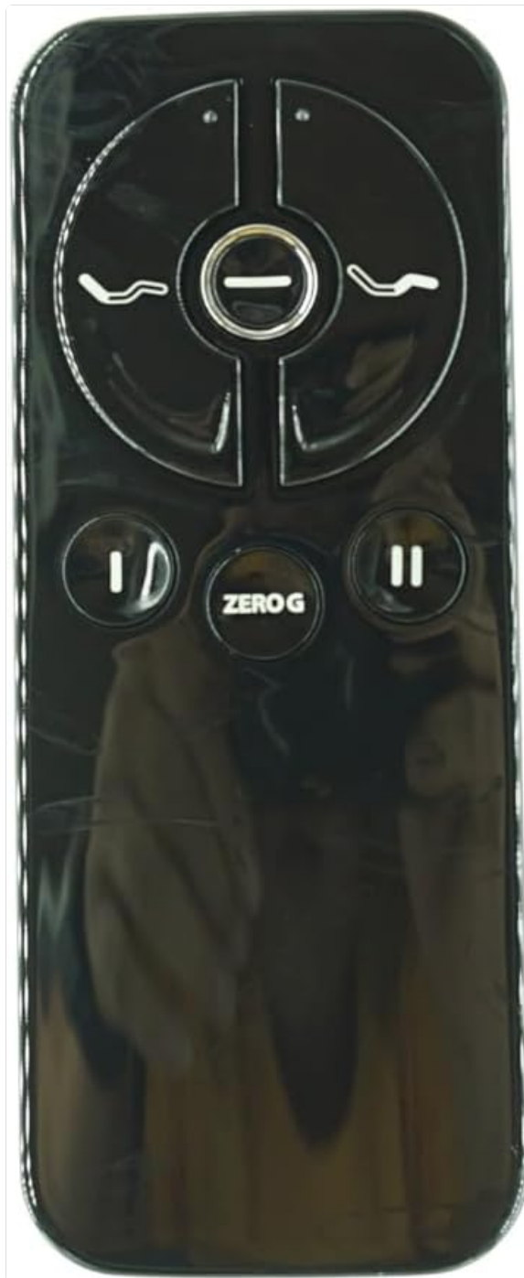
Figure 1.1: Front view of the Replacement Remote Control. This sleek black remote features intuitive buttons for adjusting your bed's position.

Important Compatibility Note: This remote control is not universal. It is crucial to verify that your existing control box is model CU358-2 and that your old remote is identical to this replacement. If you are unsure, please provide detailed information about your bed, control box, old remote control, and any existing manual to the seller for verification before purchase.