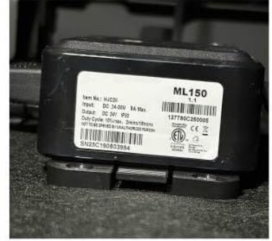
Figure 1.2: Visual guide emphasizing the importance of checking your control box and old remote for compatibility. This image displays examples of what to look for on your existing equipment.