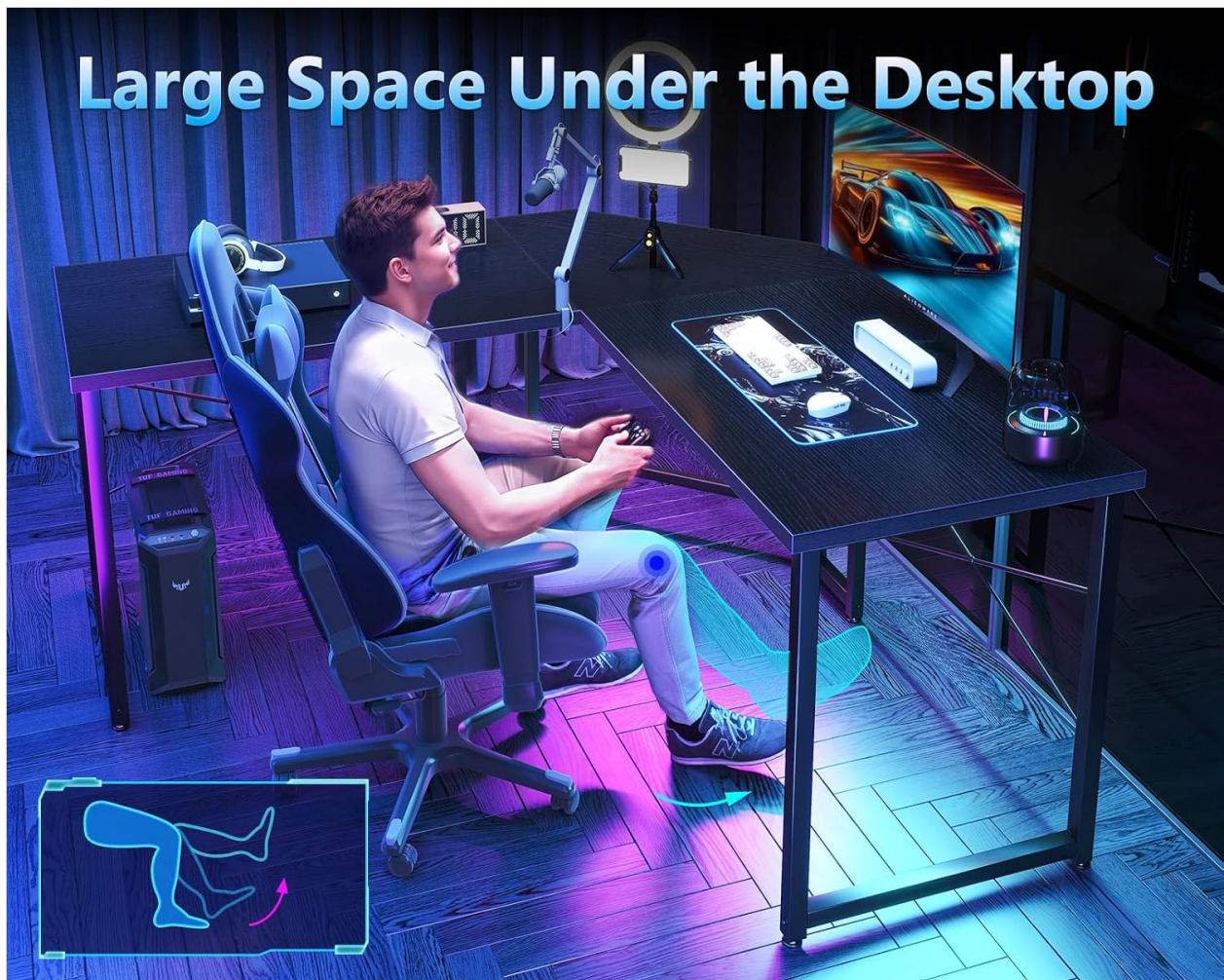
Image: A user seated at the desk, highlighting the generous legroom and open space beneath the desktop for comfortable use.