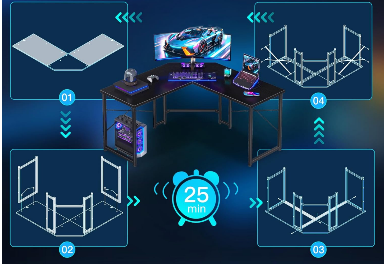
Image: A visual guide illustrating the 4 main steps for quick and easy assembly of the ODK L-shaped desk, estimated to take 25 minutes.