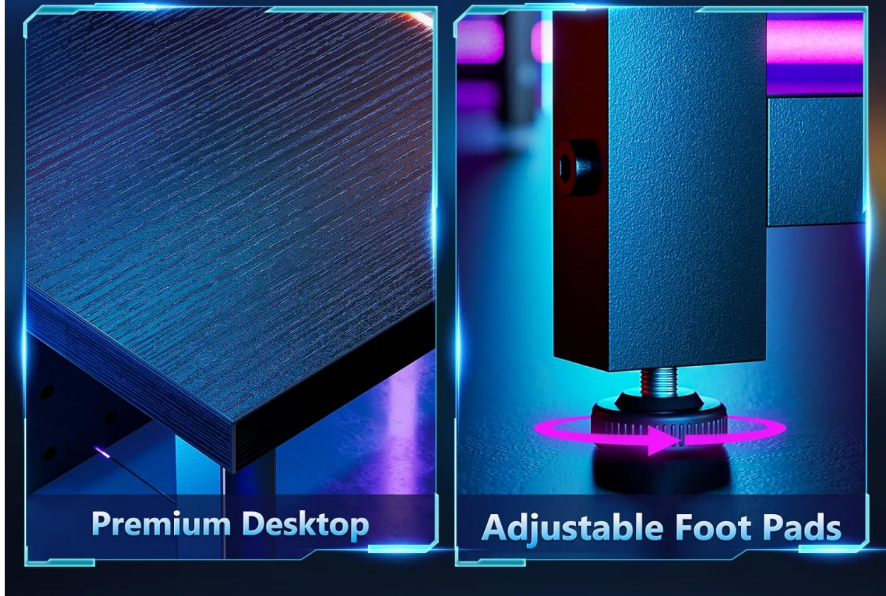
Image: Detailed views of the desk's premium desktop surface and the adjustable foot pads, emphasizing durability and stability features.