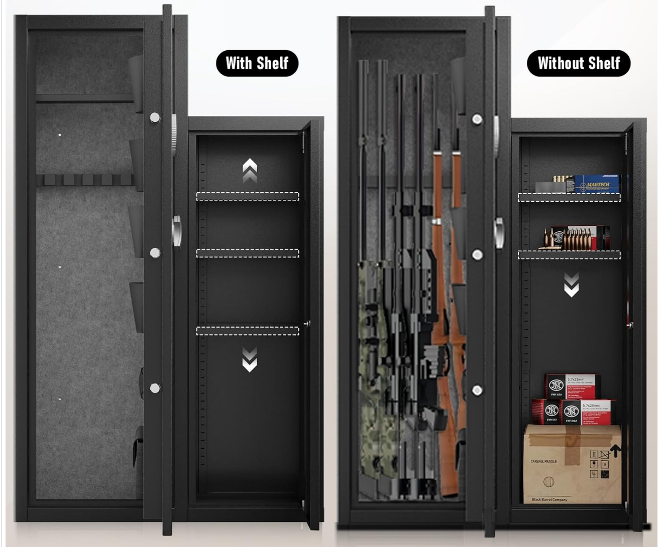
Figure 3: Removable Shelves. This image shows how the shelves within the gun safe can be removed or adjusted to accommodate various sizes of firearms and accessories, offering flexible storage solutions.