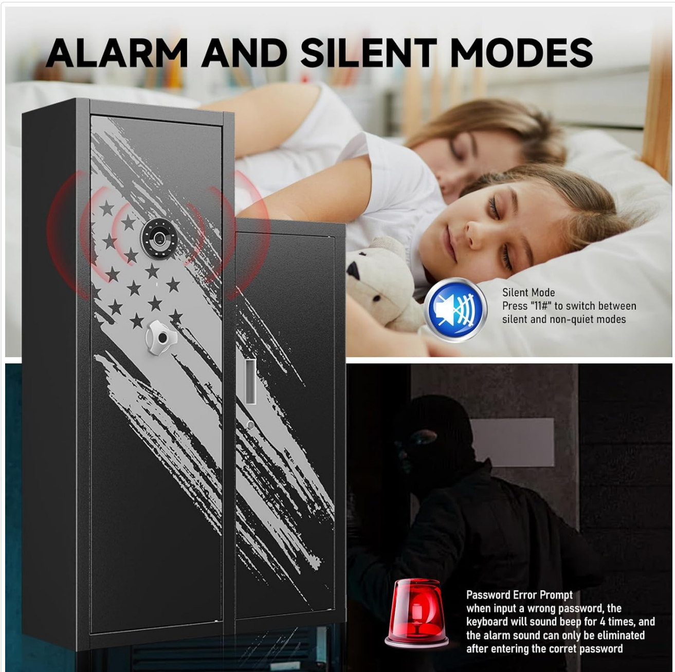
Figure 5: Alarm and Silent Modes. This image illustrates the dual functionality of the safe's alarm system. It shows a "Silent Mode" for discreet operation (indicated by a sleeping child) and an "Alarm Prompt" that activates if an incorrect password is entered multiple times (indicated by a burglar and a siren icon).