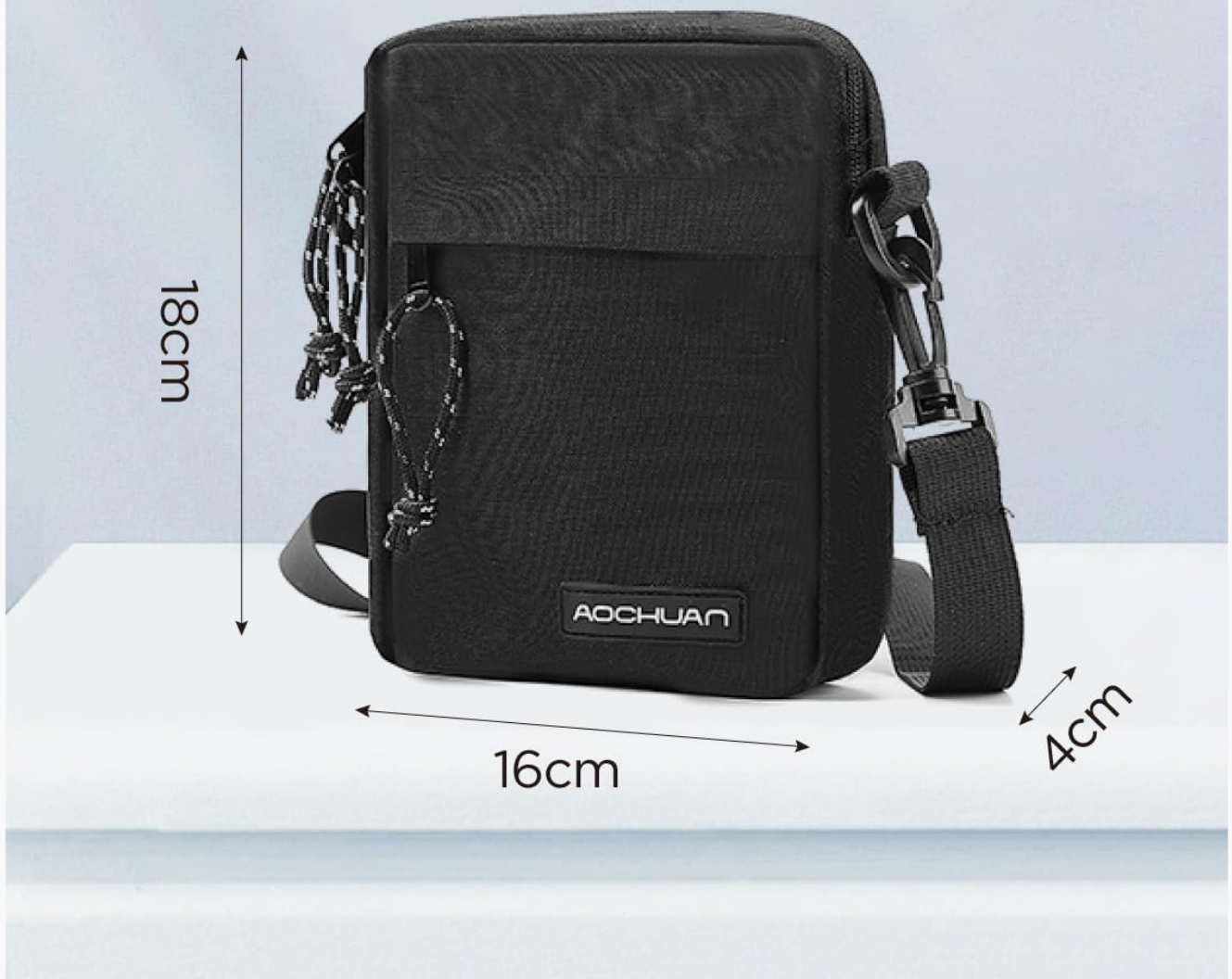
Image: Dimensions of the B10 Storage Bag, illustrating its compact and lightweight design.