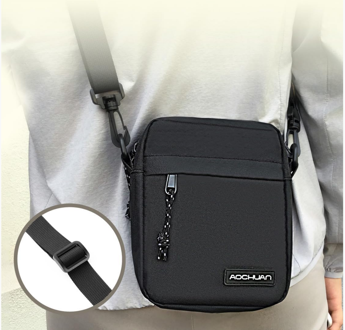
Image: The B10 Storage Bag with its adjustable shoulder strap, designed for comfortable and customizable carrying.

Easily alter the length to suit your preferred carrying style