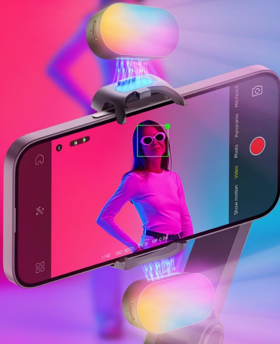
Image: The magnetic RGB fill light in action, highlighting its 7 color options, 3 brightness levels, 3-hour battery life, and magnetic attachment.