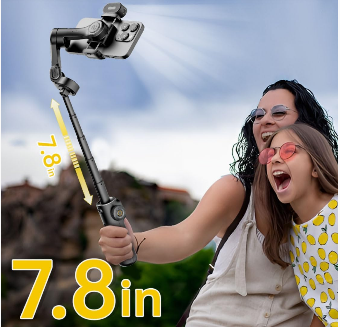
Image: The Smart X2 gimbal featuring its built-in 7.8-inch aluminum alloy extension rod, allowing for versatile shooting angles.