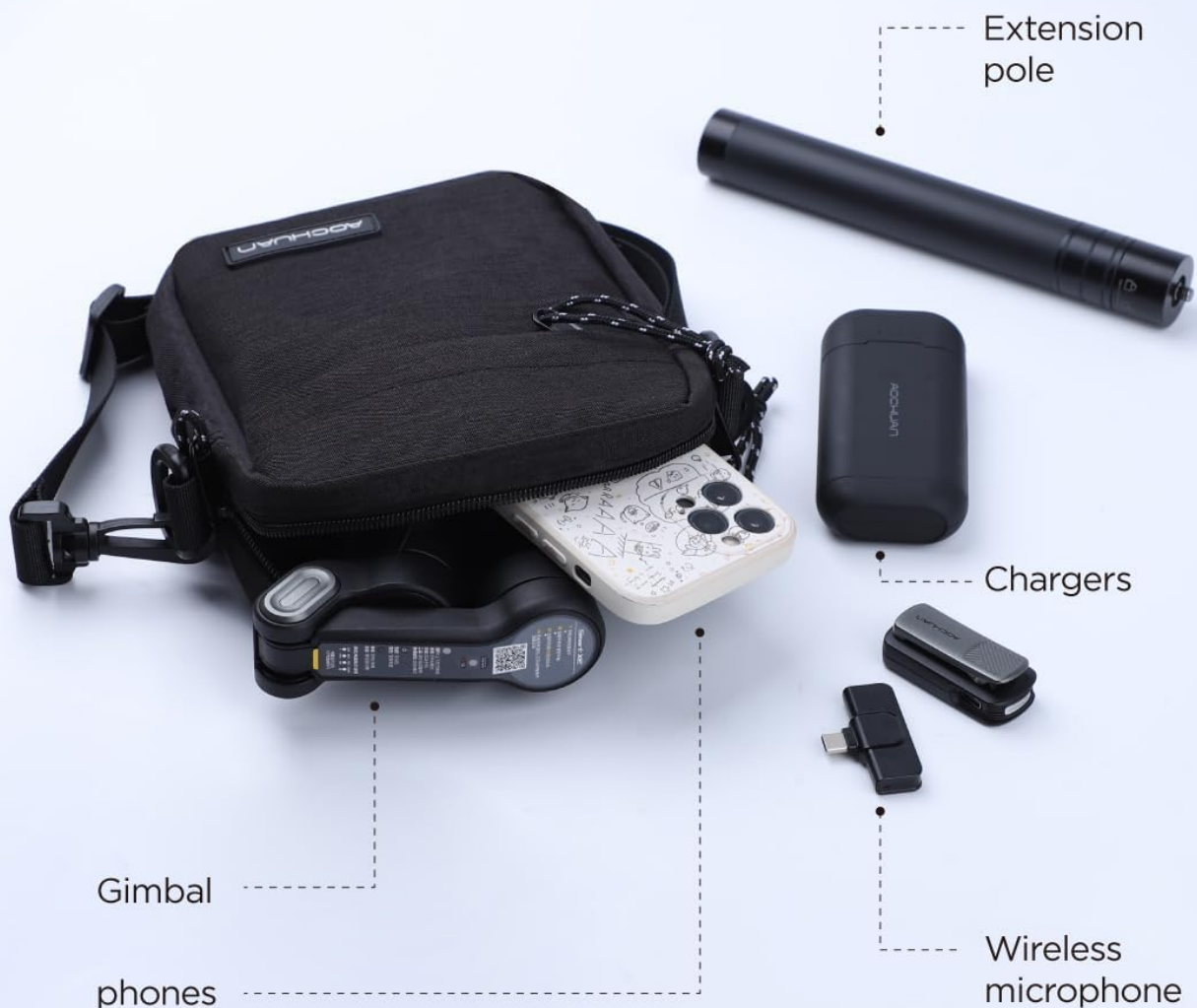
Image: The B10 Storage Bag demonstrating its ample capacity to hold the gimbal, extension pole, phone, chargers, and other accessories.

Keep your gimbal, accessories, and essentials organized in this storage bag, offering ample space for all your gear