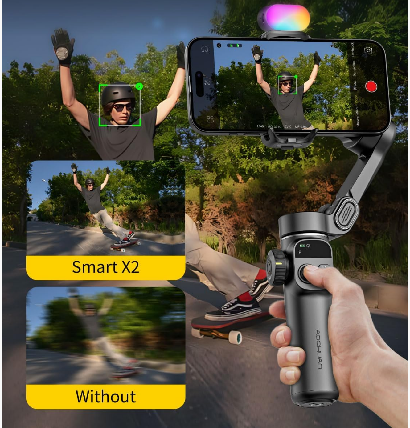
Image: Visual representation of the enhanced 8.0 stabilization system, comparing footage taken with and without the Smart X2 gimbal.