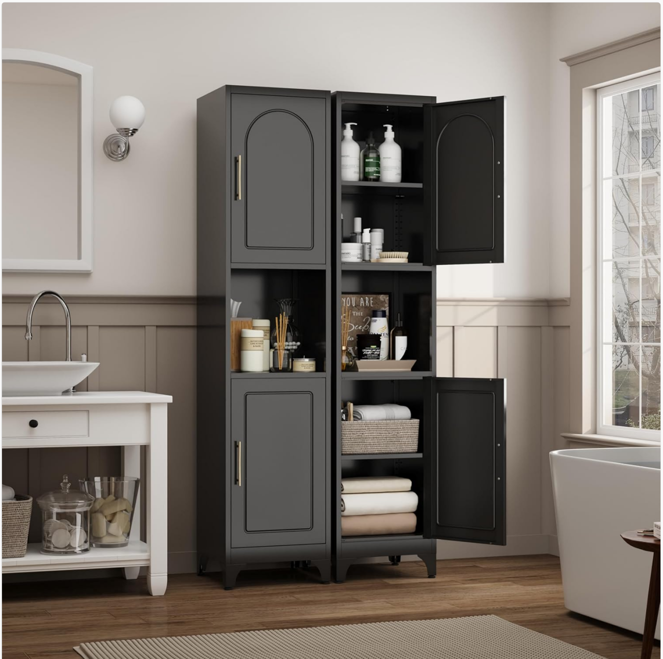
Figure 5.1: The cabinet integrated into a bathroom environment, showcasing its practical use for storing toiletries and towels. The image highlights the open central section and the closed compartments.