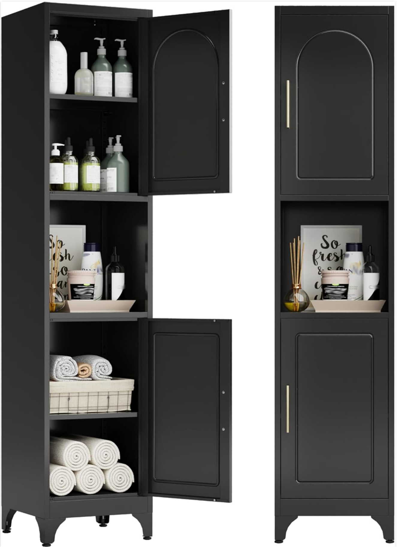
Figure 1.1: Front view of the Kubohogar 75" Tall Metal Storage Cabinet, illustrating its two closed compartments and open central shelf. The left image shows the cabinet with doors open, revealing stored items like bottles and towels. The right image shows the cabinet with doors closed, highlighting its sleek black finish and gold handles.