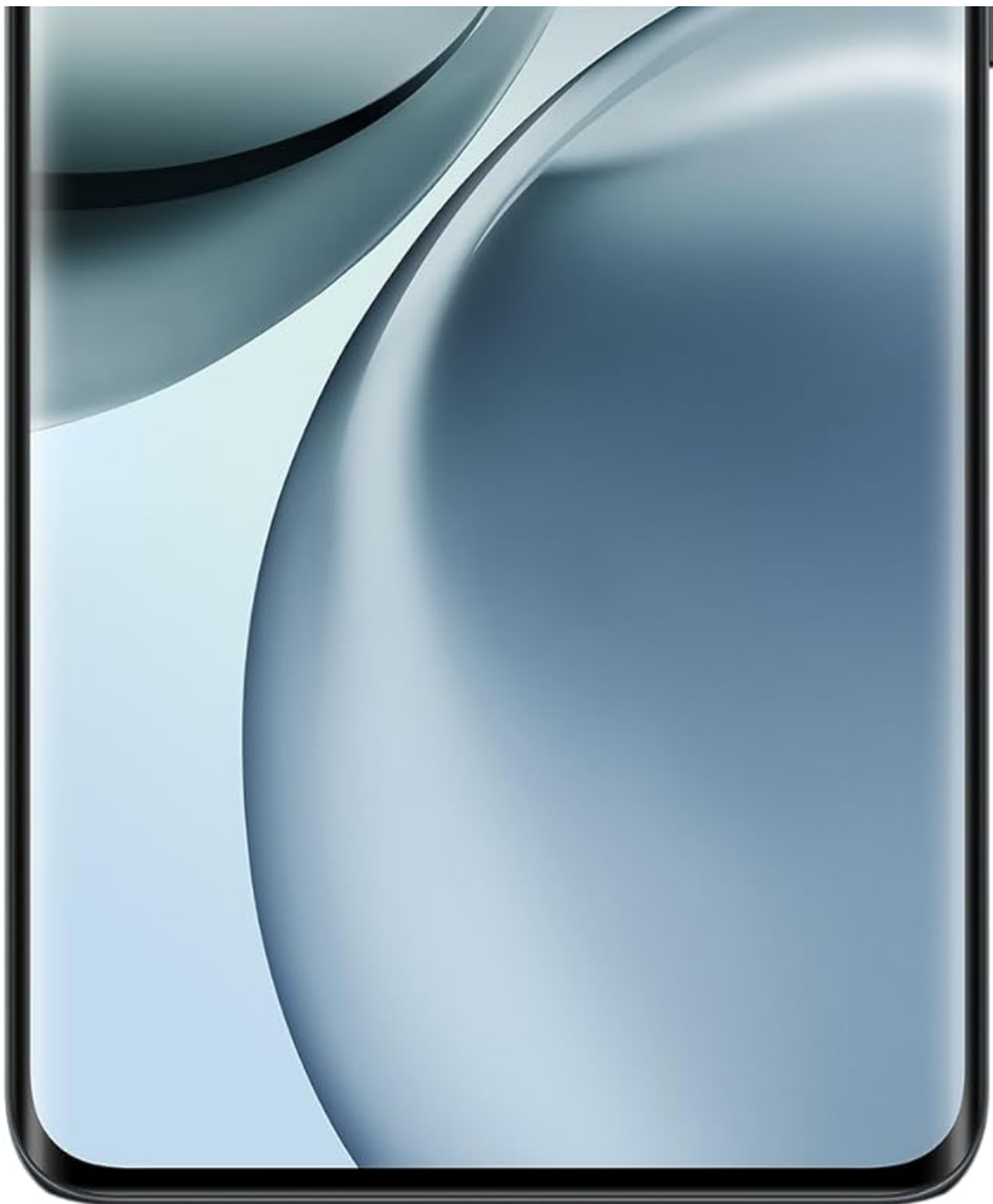
Image: Front view of the realme 14 Pro 5G smartphone.