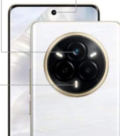
Image: Detailed view of the realme 14 Pro 5G camera system and its key features.

Smart Color Temperature Adjustment Studio-level Fill Light