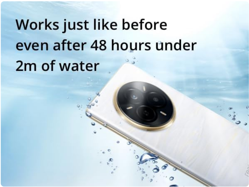
Image: The realme 14 Pro 5G demonstrating its water resistance.

Works just like before even after 48 hours under 2m of water