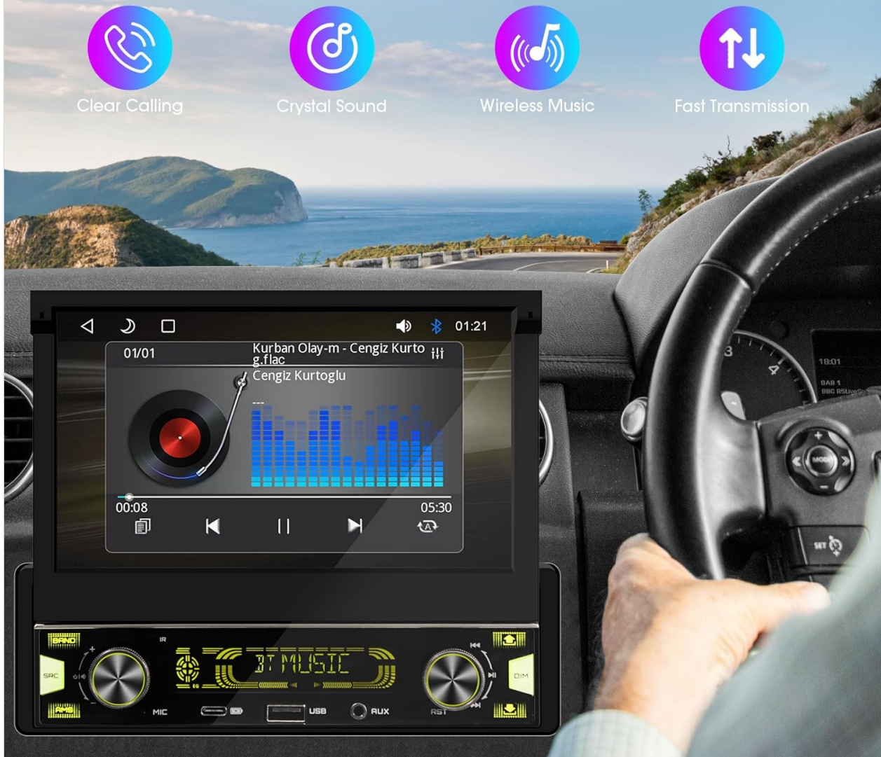
Image: The stereo displaying a music playback interface via Bluetooth, with icons indicating clear calling, crystal sound, wireless music, and fast transmission.

Stable bluetooth connectivity enables hands-free calling, wireless audio streaming, phonebook and more.