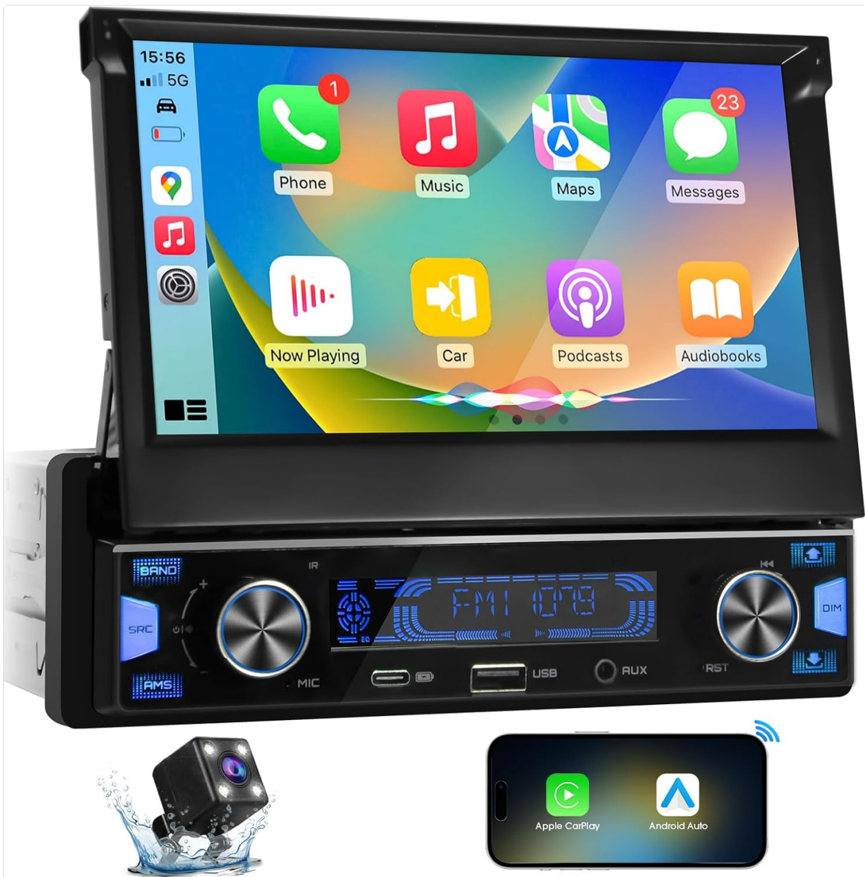
Image: Front view of the aboutBit single DIN stereo with its 7-inch motorized touchscreen extended, displaying the CarPlay interface. The main unit shows control knobs, USB, AUX, and Type-C ports.