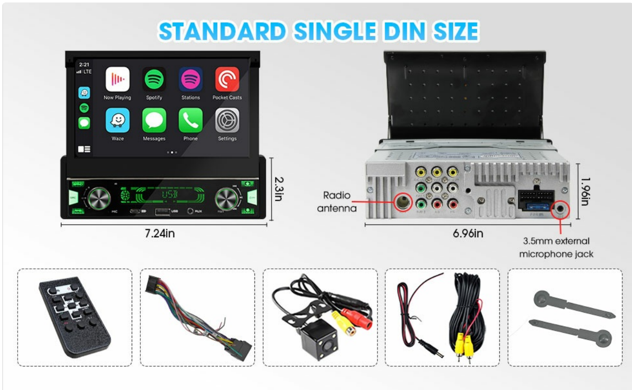
Image: Illustration of the standard single DIN size unit and included accessories such as the remote control, wiring harness, backup camera, and mounting keys.