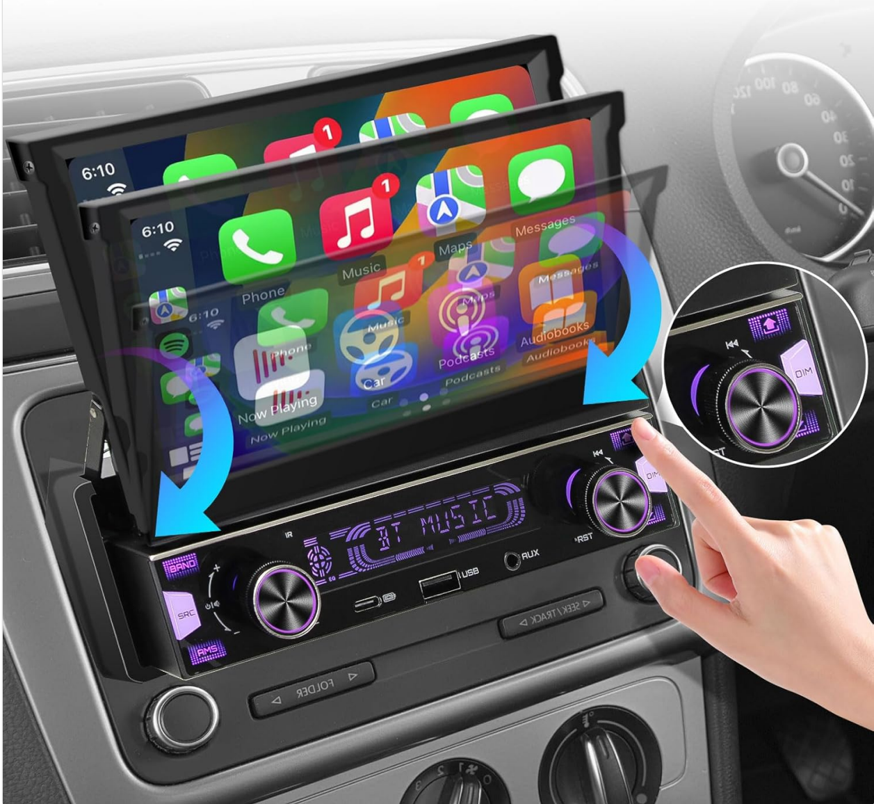
Image: Depiction of the motorized screen extending and retracting, highlighting the smooth operation and adjustable viewing angles.