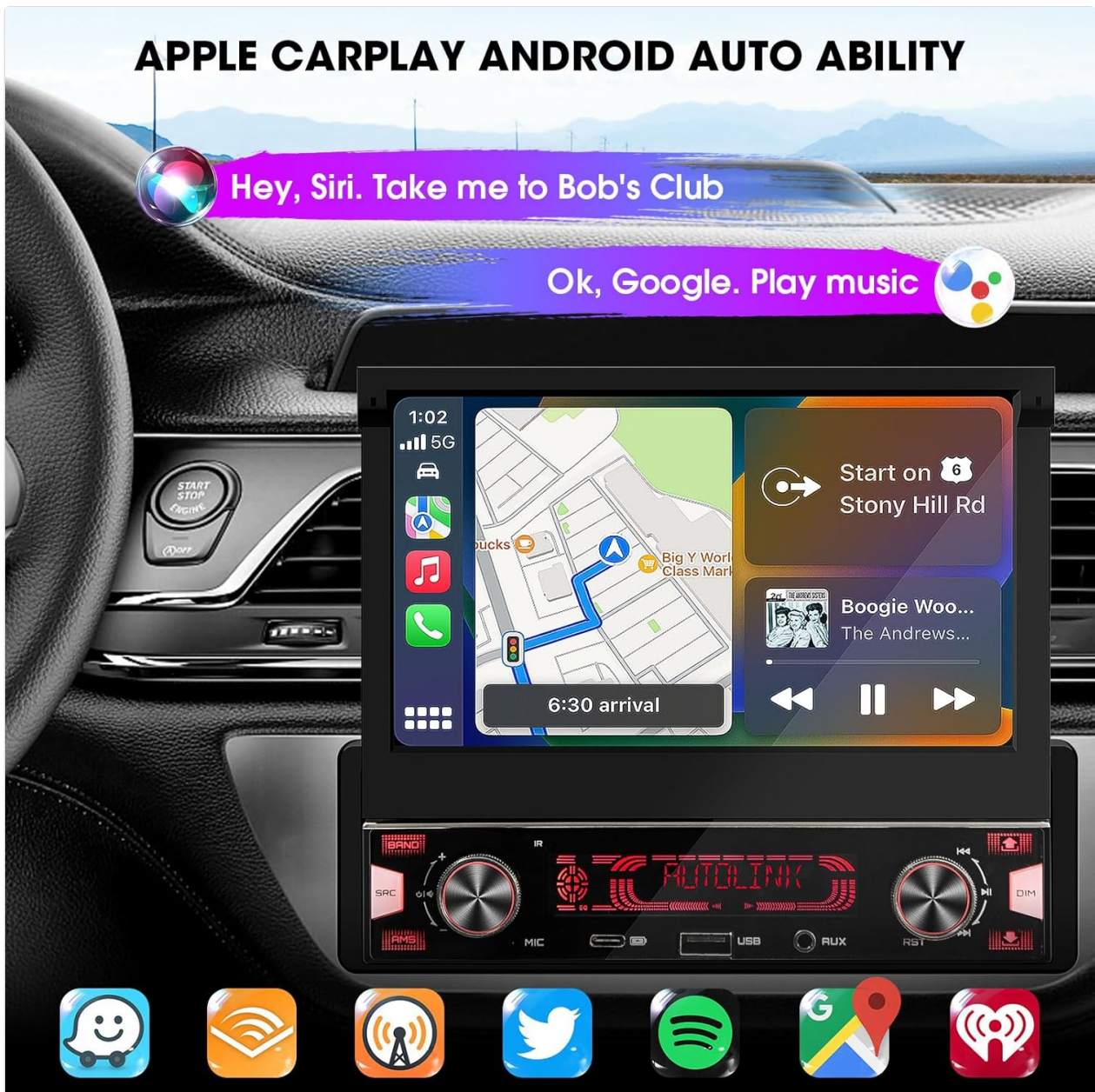
Image: The stereo's screen displaying the CarPlay interface with navigation and music. Text indicates voice command activation for Siri and Google Assistant.