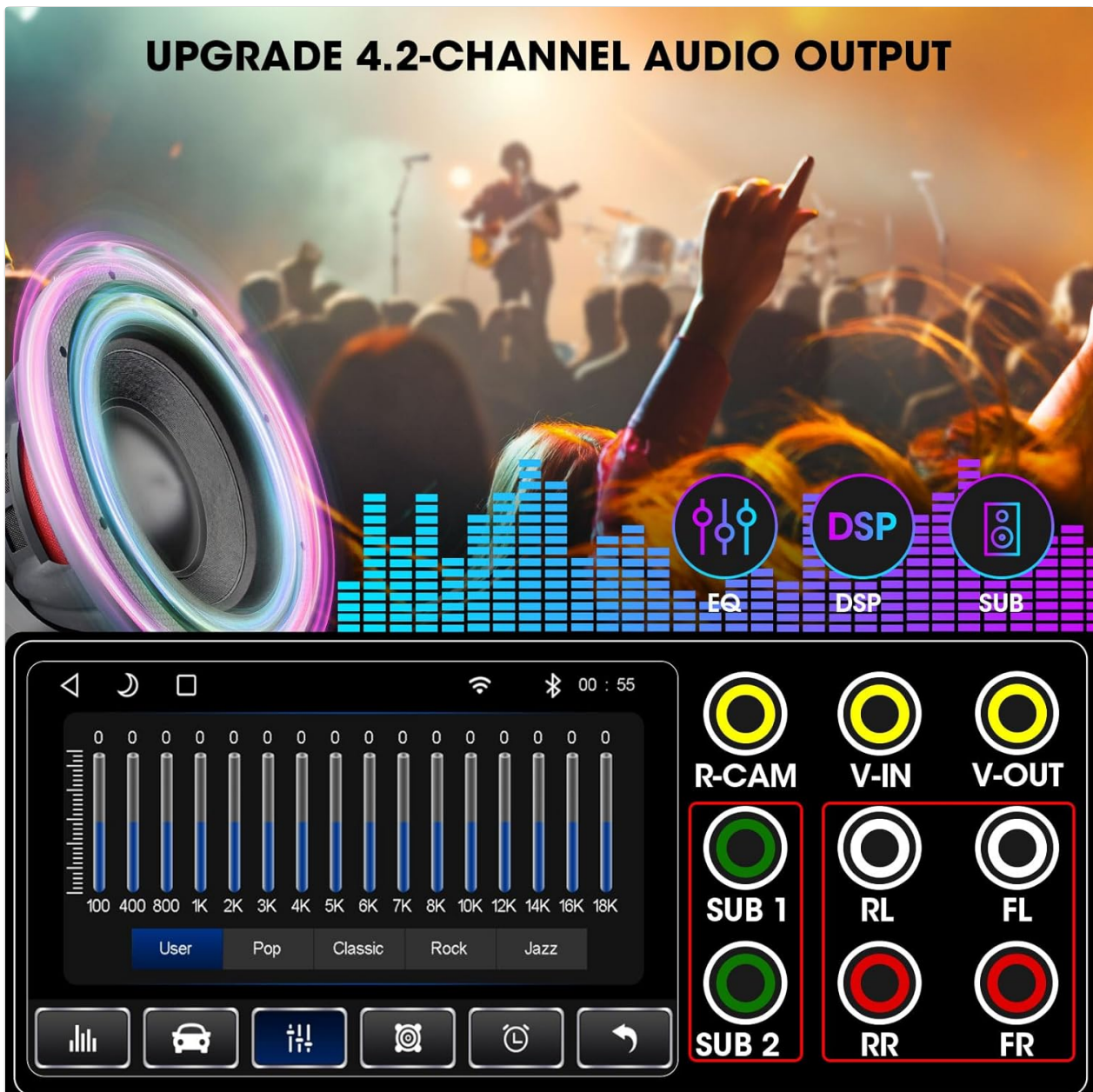
Image: The stereo's screen showing the 16-band graphic equalizer interface and a diagram of the 4.2 channel RCA audio outputs, including two subwoofer outputs.