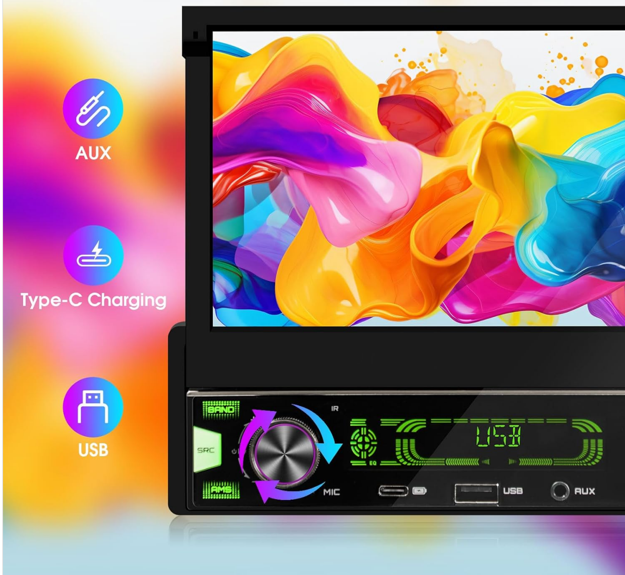
Image: Close-up of the stereo's front panel highlighting the AUX, Type-C, and USB ports, indicating their functions for multimedia input and charging.