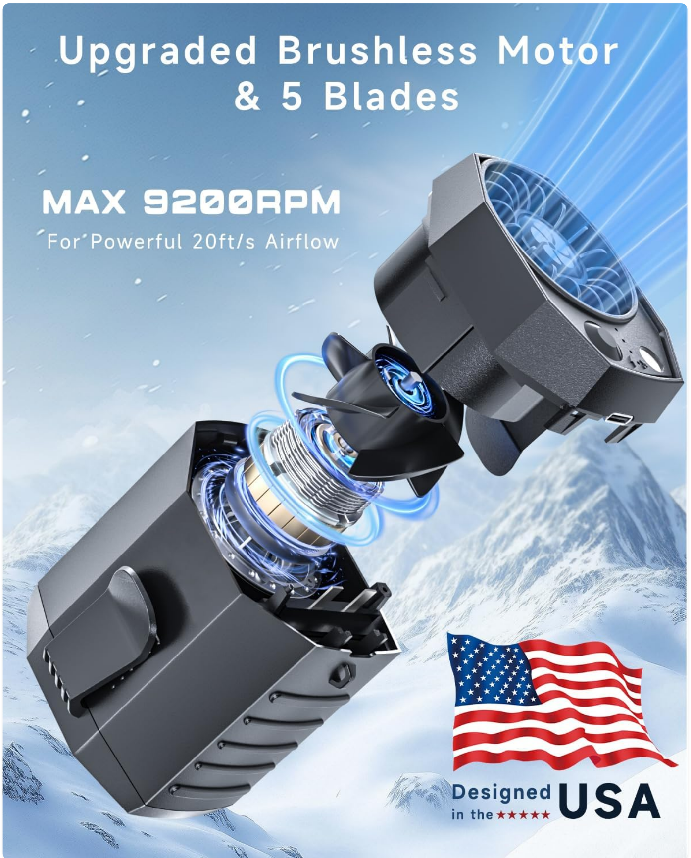
Figure 2: Internal view highlighting the upgraded brushless motor and 5-blade turbo fan for powerful airflow.