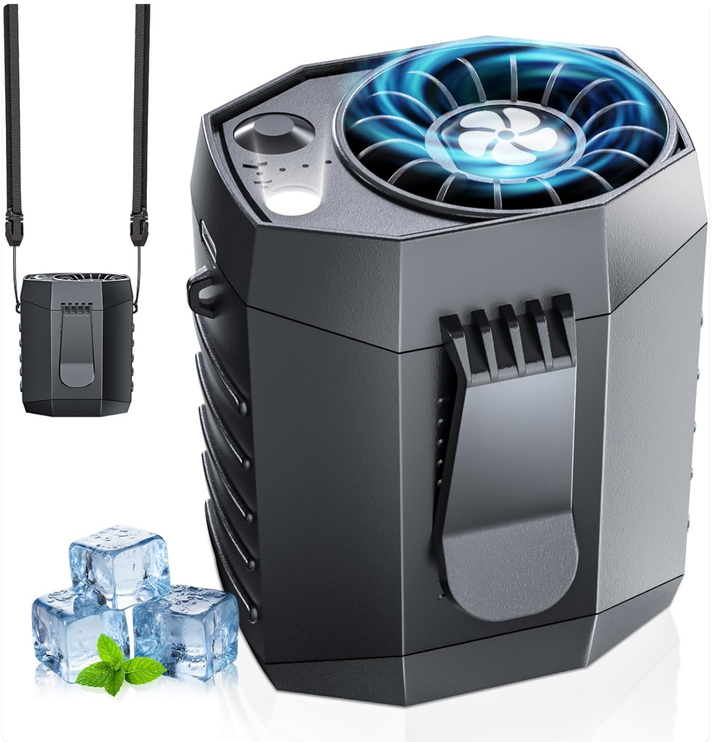
Figure 1: The JKBOOM 2025 Smart Portable Rechargeable Fan, showcasing its compact design and cooling capabilities.