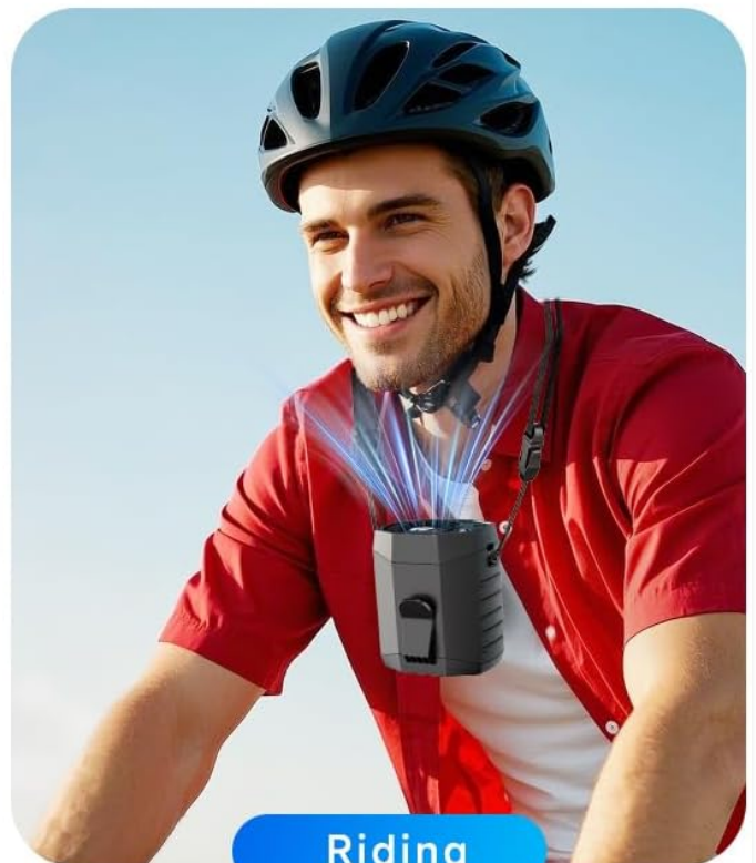
Figure 6: The fan is suitable for various occasions, providing personal cooling during physical activities and work.