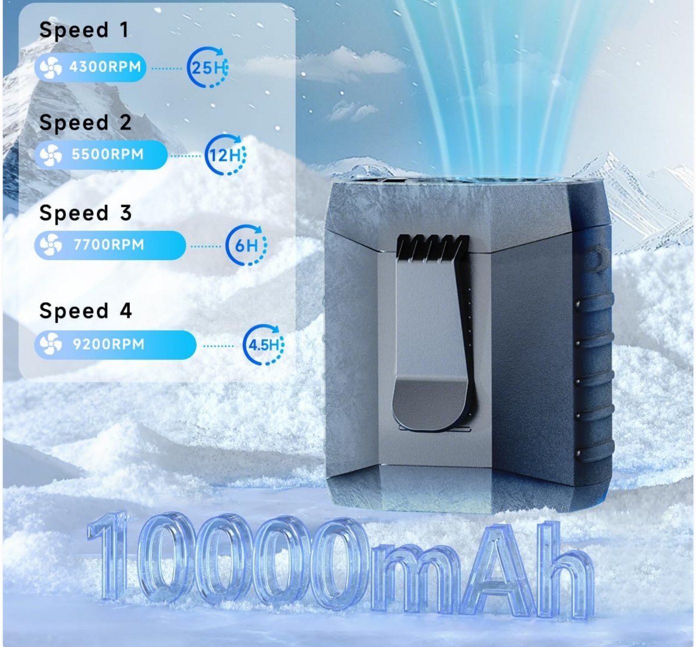
Figure 3: Fan speed settings and corresponding battery life.