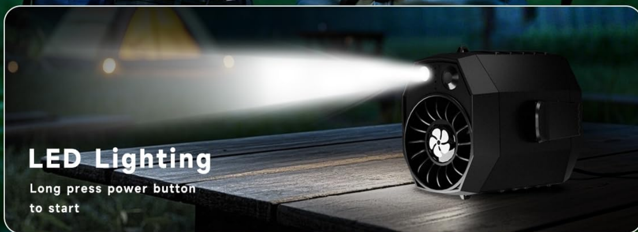
Figure 4: The fan's integrated LED light provides illumination for various activities.