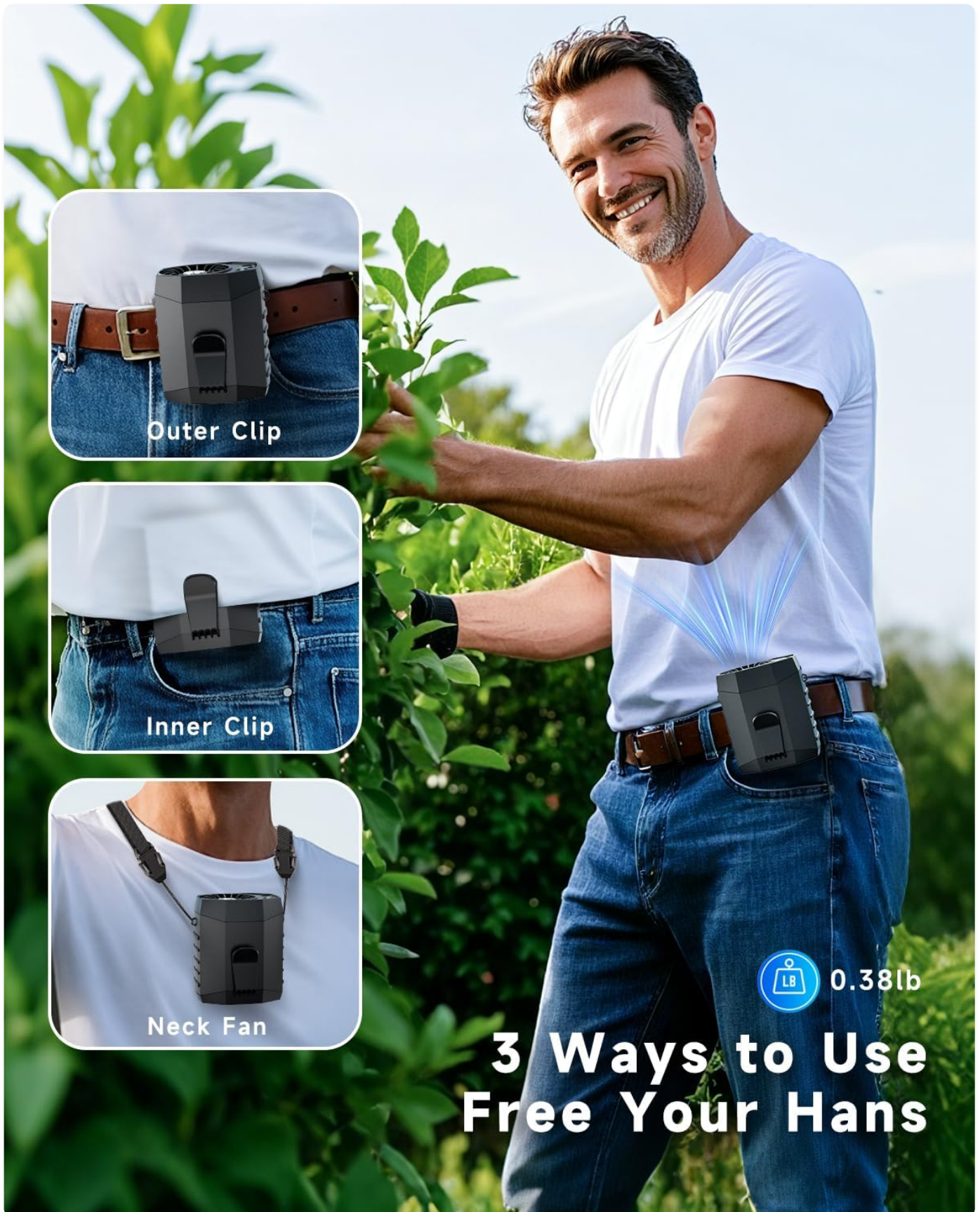
Figure 5: Demonstrating the versatile wearing options: outer clip, inner clip, and neck fan.