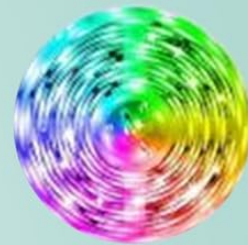
LED Strip Light