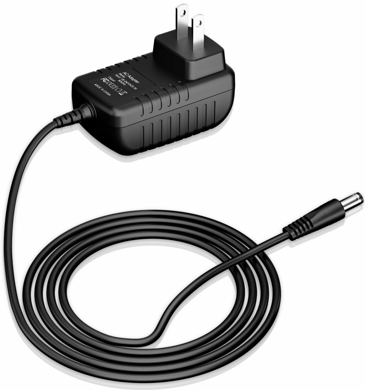
Image: The RXQMXG AC Adapter Charger connected to a power outlet, illustrating its compact design and cable length.

The RXQMXG AC Adapter Charger is a compact and lightweight power solution. It features a 4-foot power cord and is designed for universal use in various settings including bedrooms, living rooms, offices, and homes. The adapter incorporates multiple safety features to protect your devices.