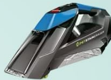
Pet cleaning machine