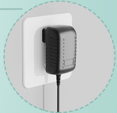
Image: Detailed view of the adapter's components, including the 4ft power cord, emphasizing its anti-oxidation, durability, and stable output characteristics.