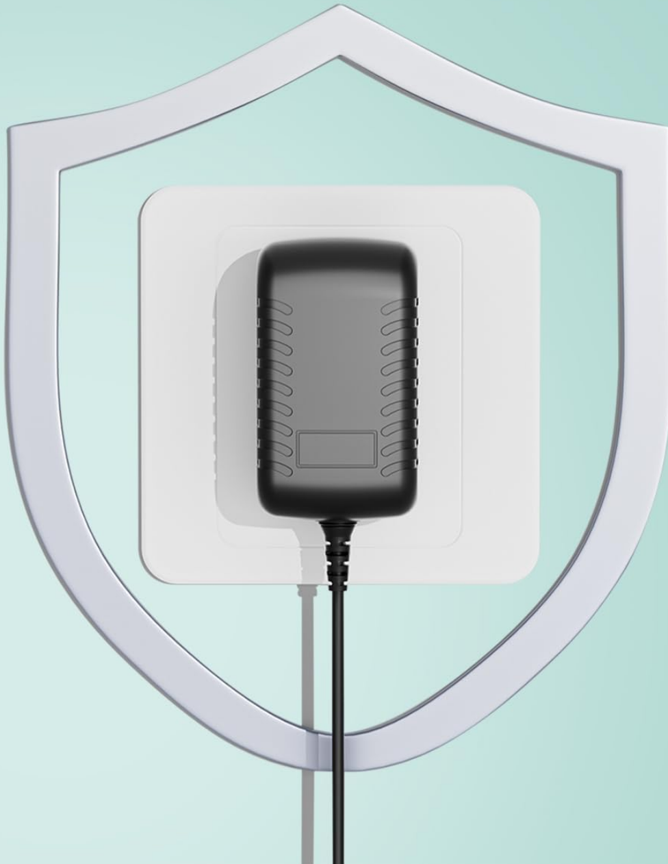
Image: Visual representation of the adapter's comprehensive safety features, including protection against overvoltage, overcurrent, short circuits, and overheating.