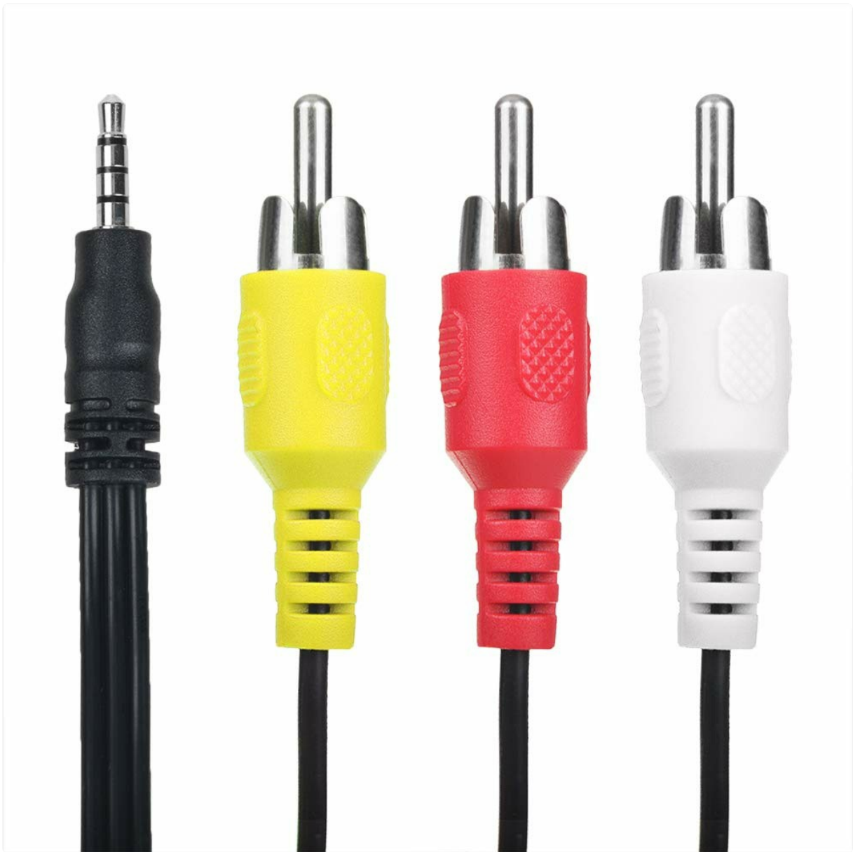
Image: A close-up view of the 3.5mm jack and the yellow, white, and red RCA plugs. This highlights the distinct connectors for proper identification during operation.