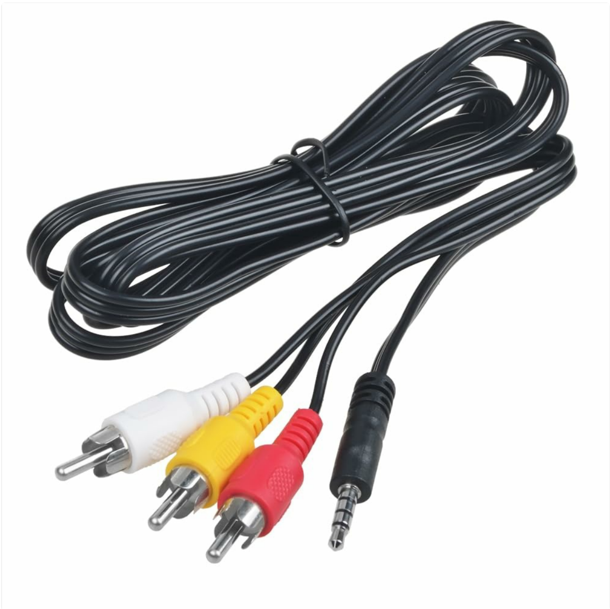
Image: The Acdctek A/V 3 RCA Audio/Video Cable, neatly coiled, showcasing its overall design and length. This provides a general view of the product.