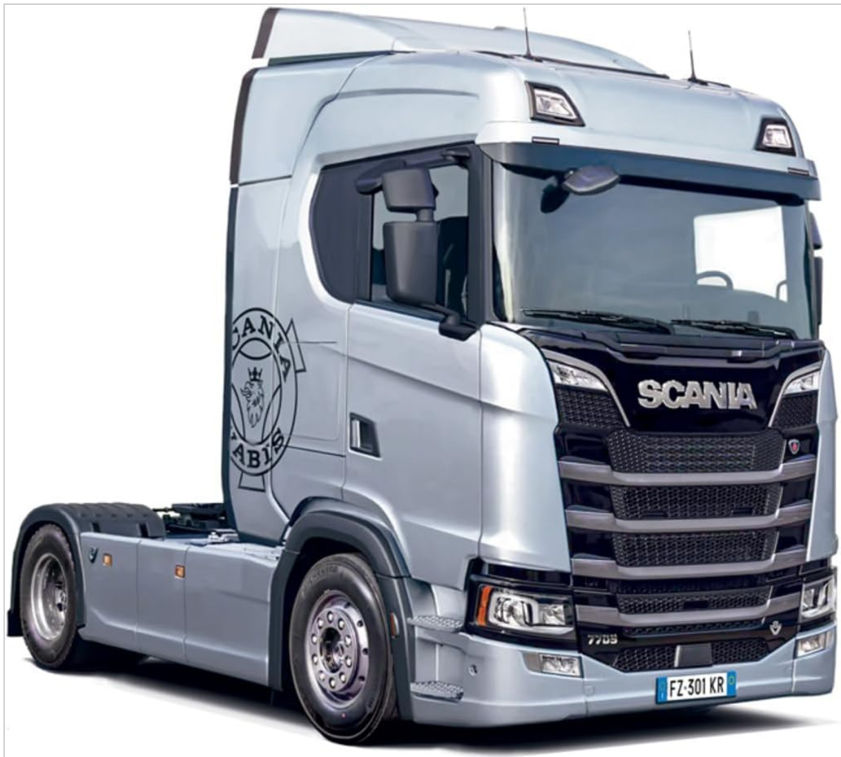
Image: A fully assembled Italeri Scania S770 4x2 Normal Roof model kit, showcasing the detailed exterior. This image