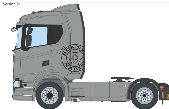
Image: Side profile of the Scania S770 4x2 Normal Roof model, illustrating a grey cab finish (Version A). This image serves as a painting reference.