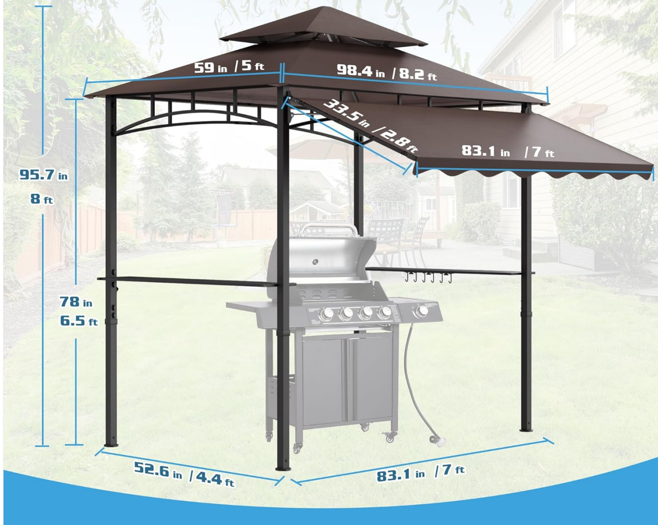
Image: Detailed product dimensions including height, width, and length of the gazebo and its components.