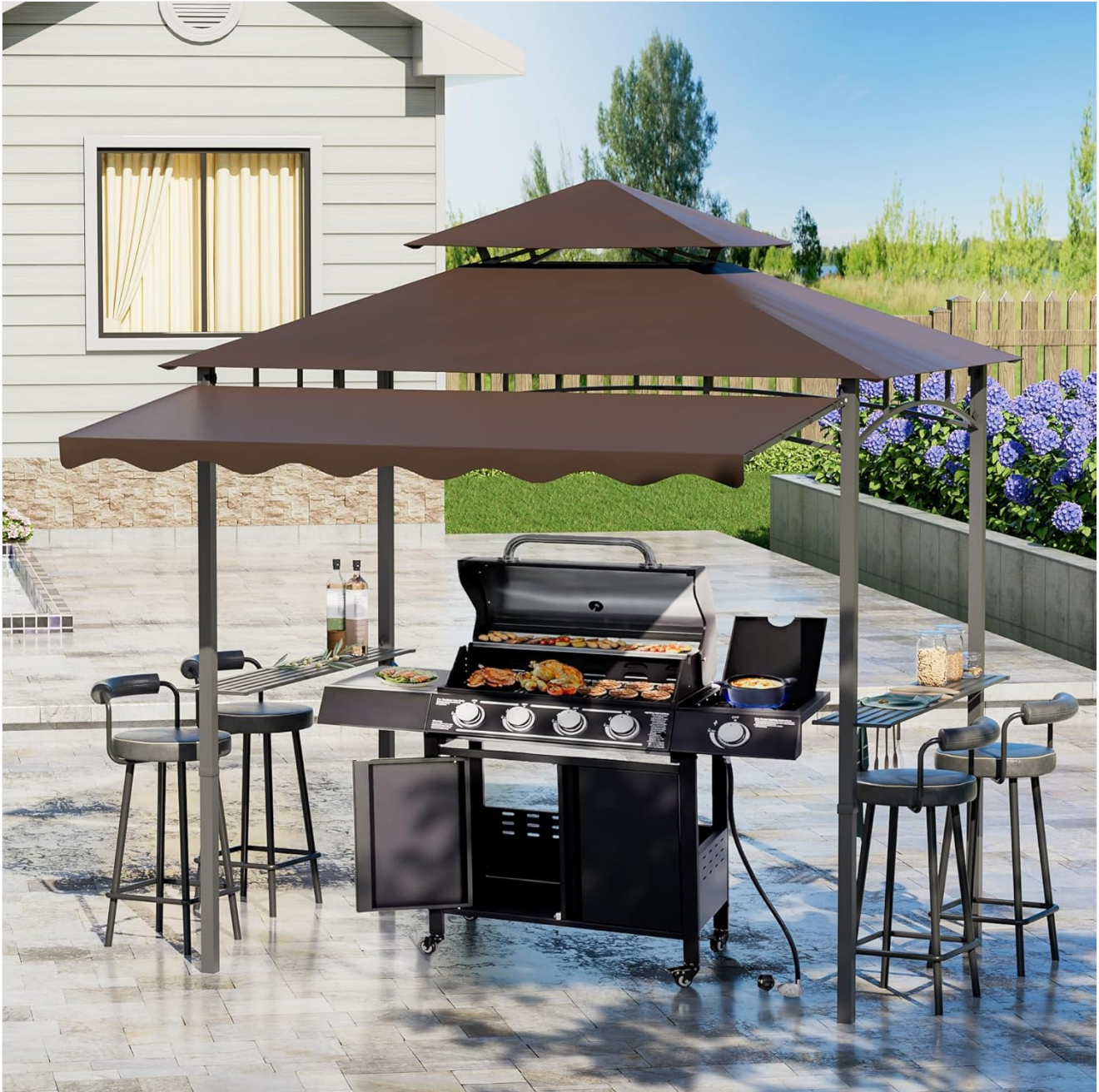
Image: Overview of the GIODIR BBQ Grill Gazebo, showcasing its main structure, side awning, and integrated shelves.