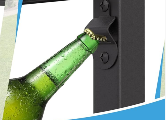
Image: Detailed view of the gazebo's practical features, including the two metal ventilated shelves, multiple hanging hooks for utensils, and the integrated bottle opener.