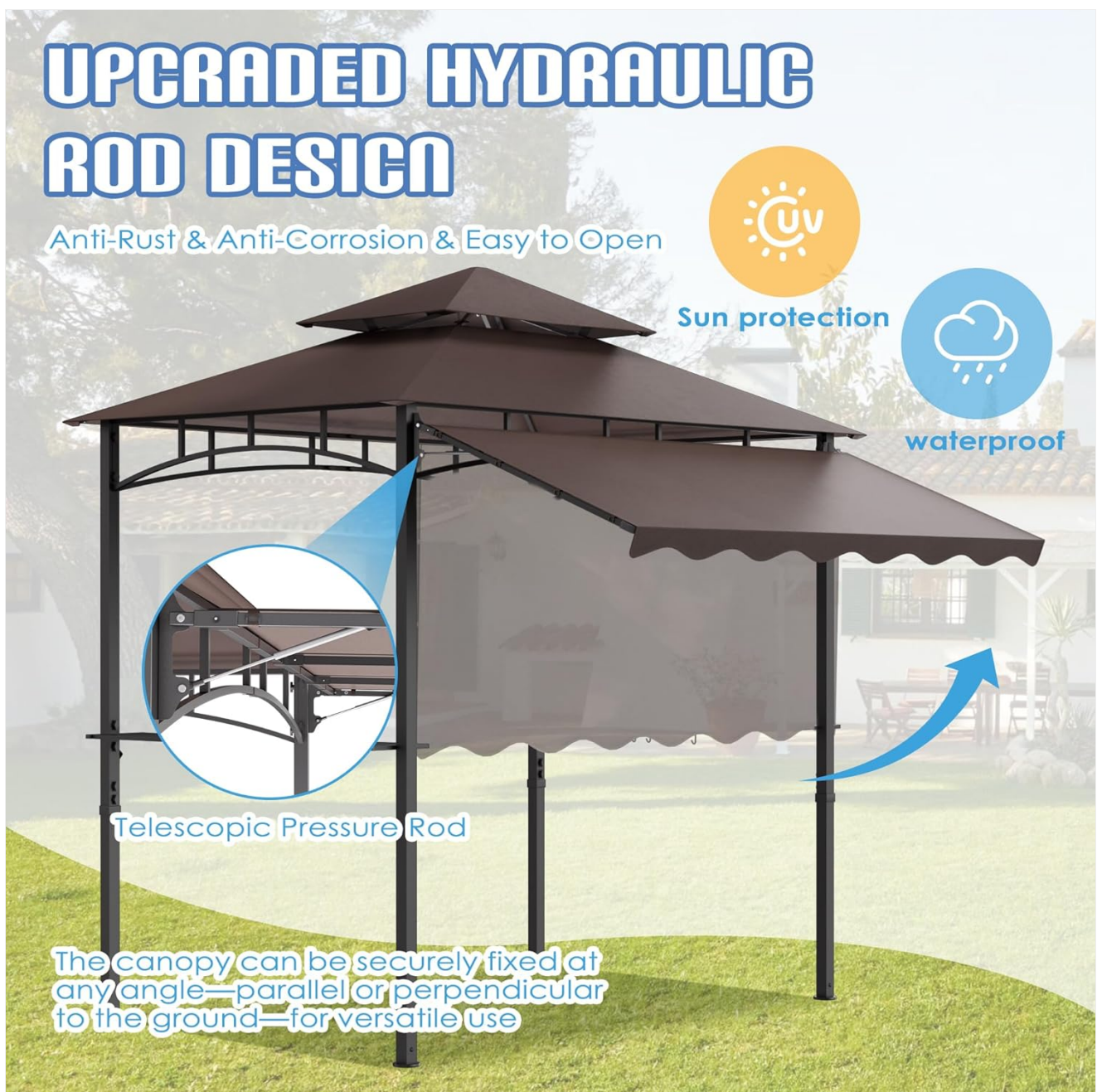
Image: Detail of the hydraulic rod mechanism for the adjustable side awning, highlighting its anti-rust and anti-corrosion properties for easy opening and secure positioning.