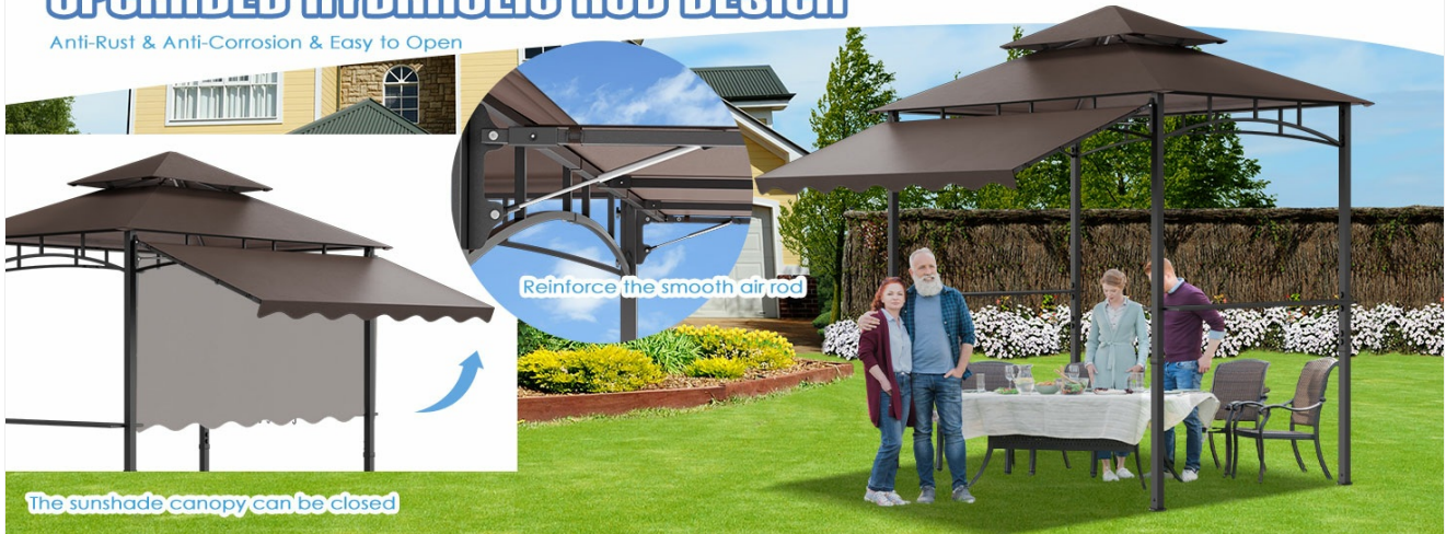
Image: The gazebo demonstrating the adjustable side awning in both extended and retracted positions, illustrating its versatility for sun protection.

Anti-Rust & Anti-Corrosion & Easy to Open