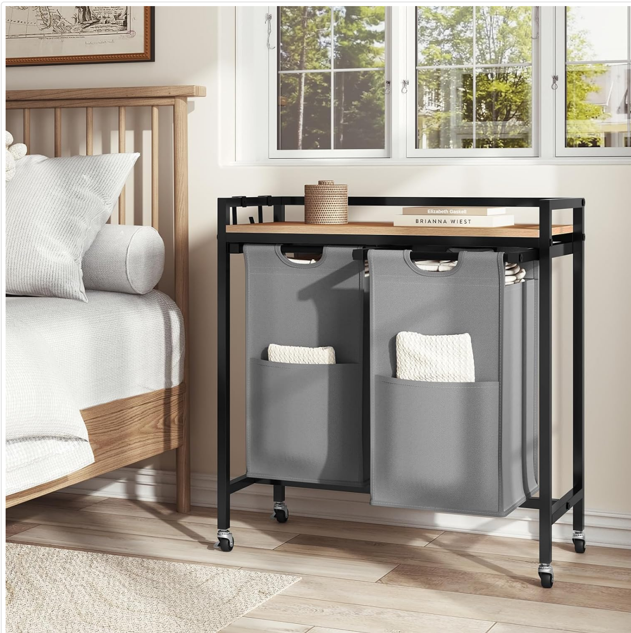
Figure 4.1: Product dimensions and structural overview. The frame is made of steel, and the top shelf is particle board, ensuring durability. Total dimensions are 70cm (L) x 30cm (W) x 71cm (H).