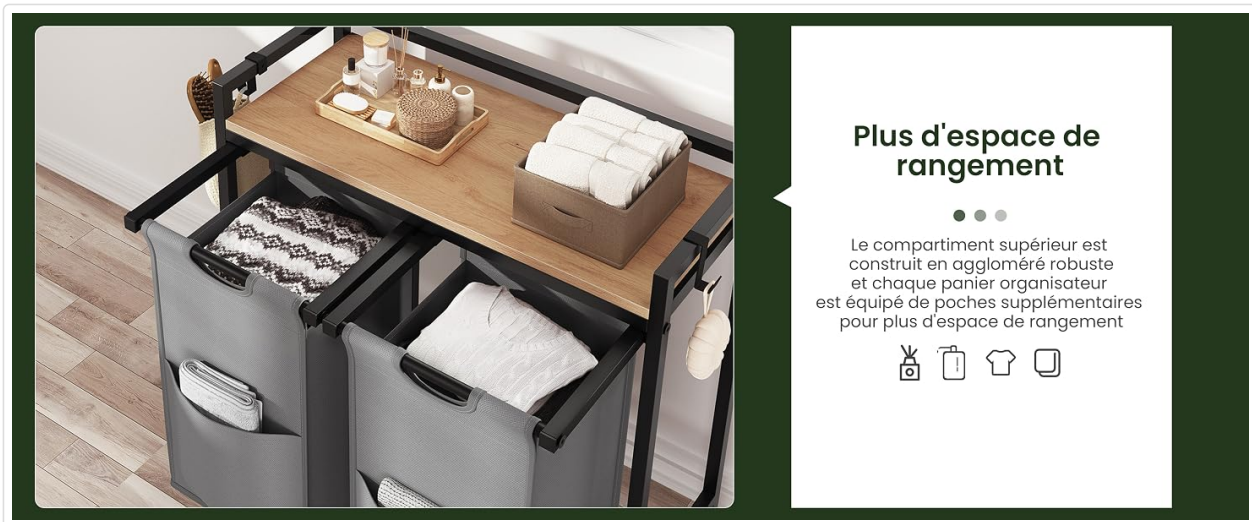
Figure 5.2: The hamper in use, showing the top shelf for storage and side hooks for hanging items like towels.