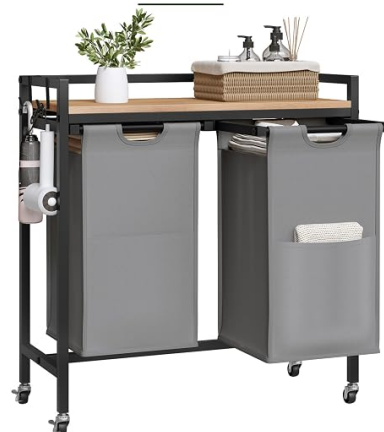
Figure 4.2: The assembled laundry hamper in a bathroom, showcasing its design and functionality as a storage unit.