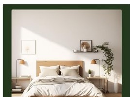
chambre à coucher