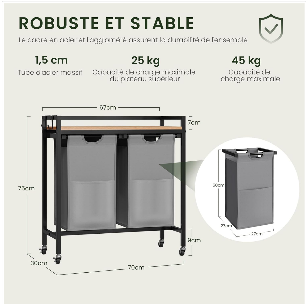
Figure 5.1: Detail of the extractable laundry bags, showing the hook-and-loop attachment and reinforced bottom bar for stability.