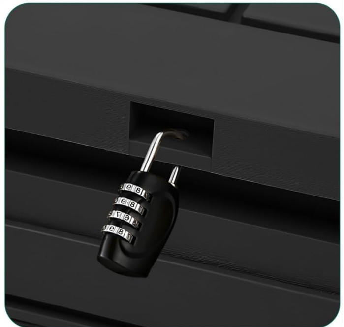
Figure 3: Detail of the hydraulic strut for smooth lid operation and the integrated lockable mechanism.

Bestows outdoor storage box with safety protection (Locks are not included)