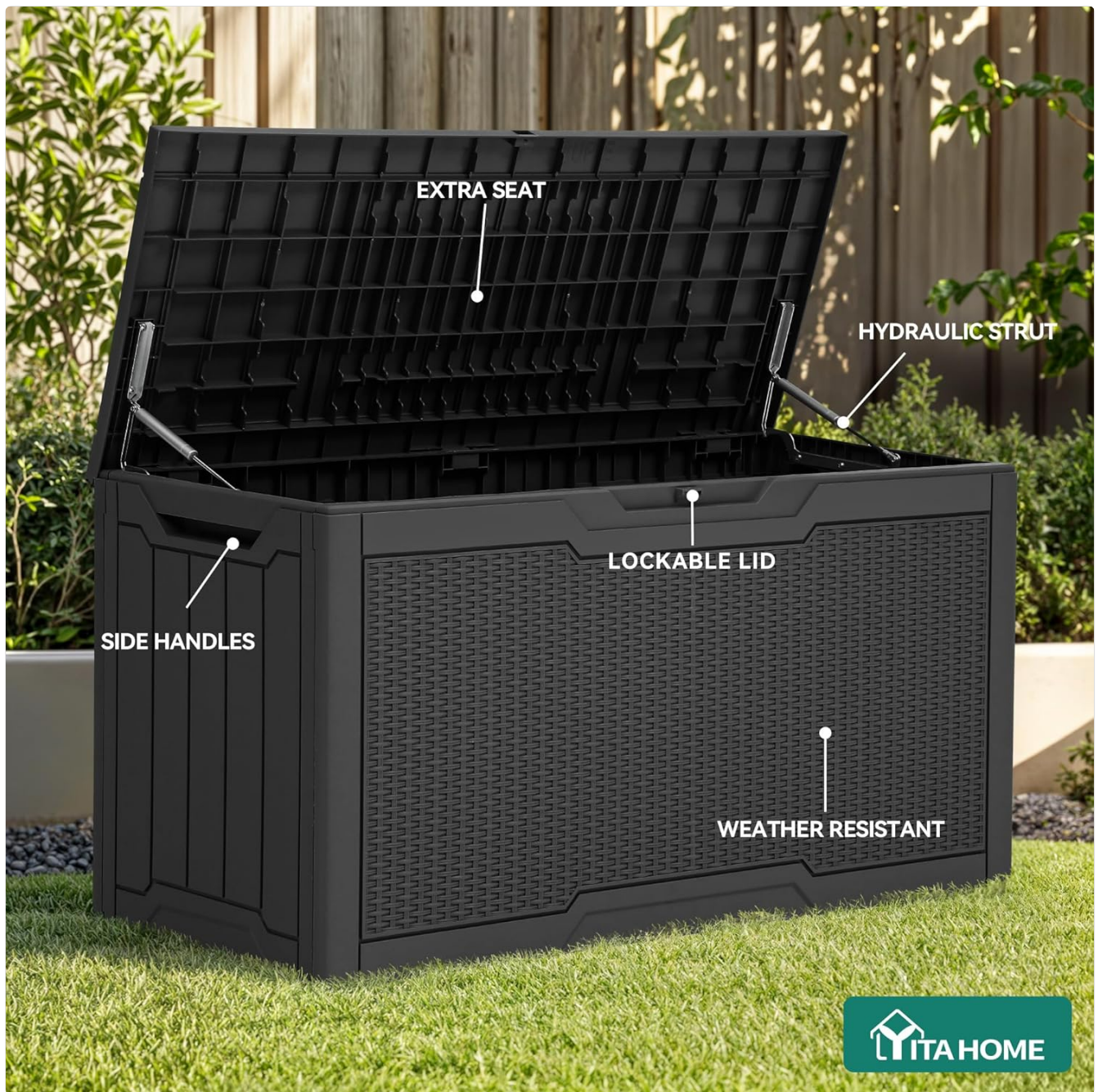
Figure 1: Key features of the YITAHOME 80 Gallon Resin Deck Box, highlighting its design for convenience and durability.