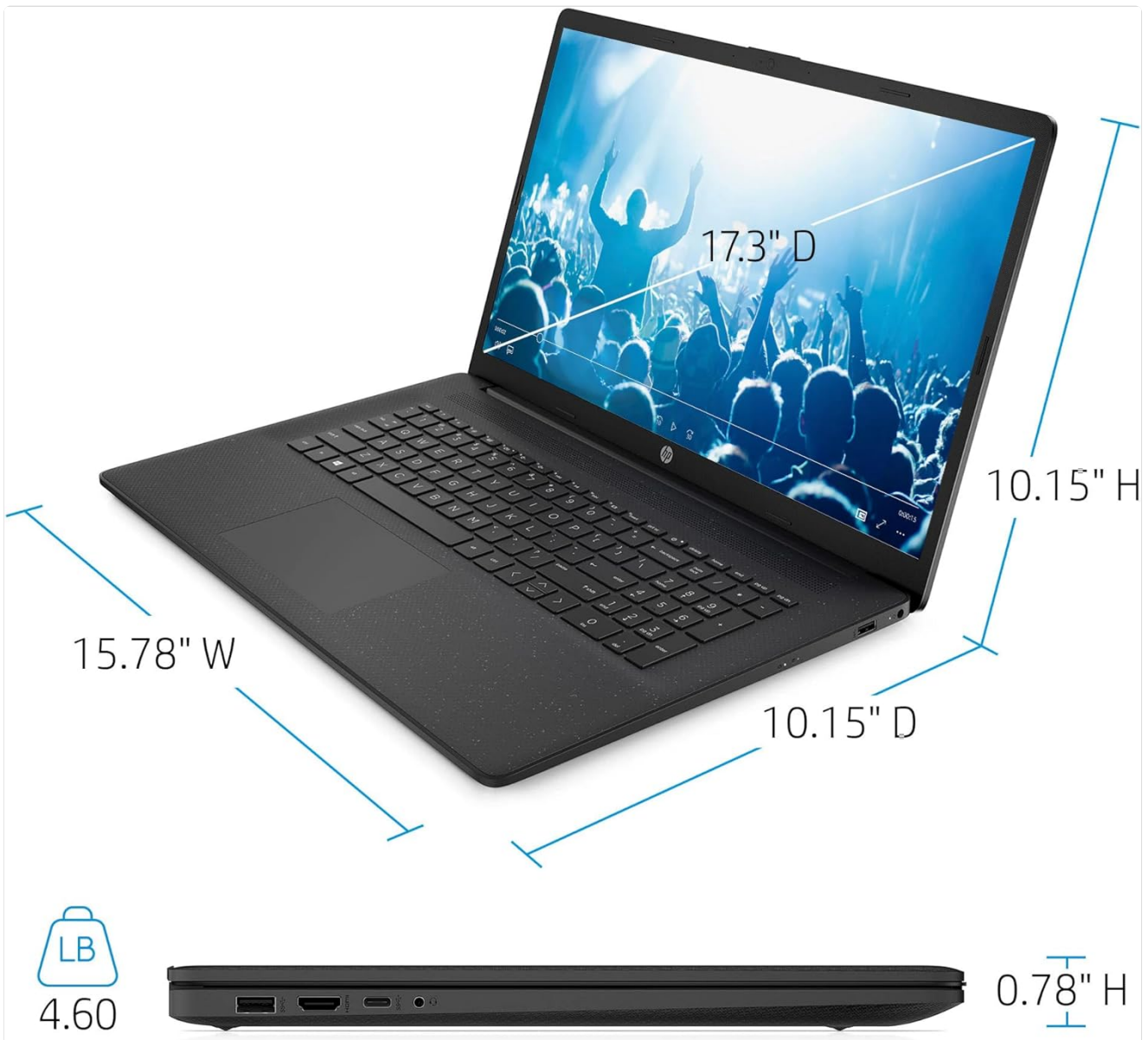
Figure 7.1: Laptop dimensions and weight.