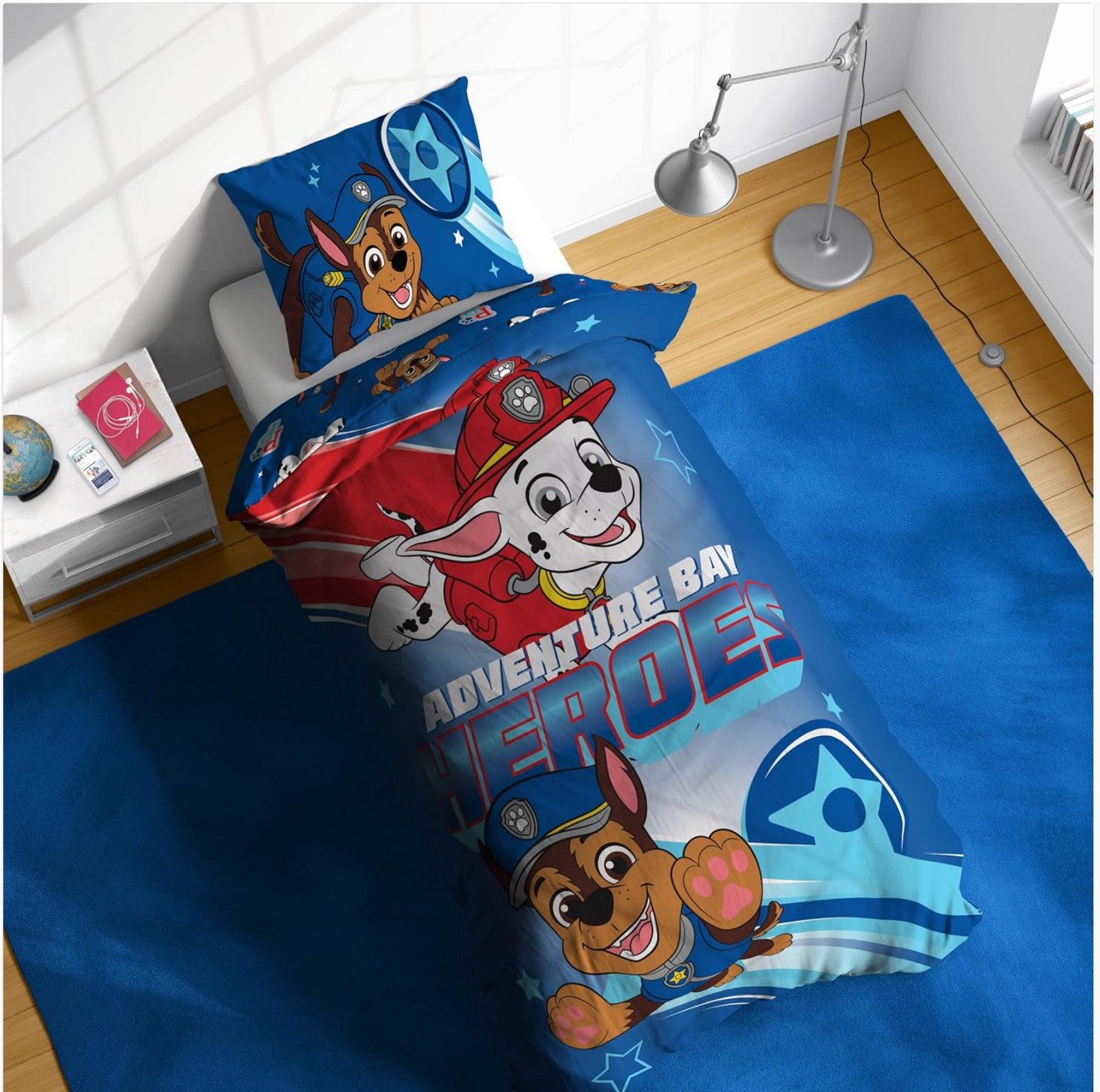
Image: The duvet cover set properly installed on a single bed, showcasing the main design.