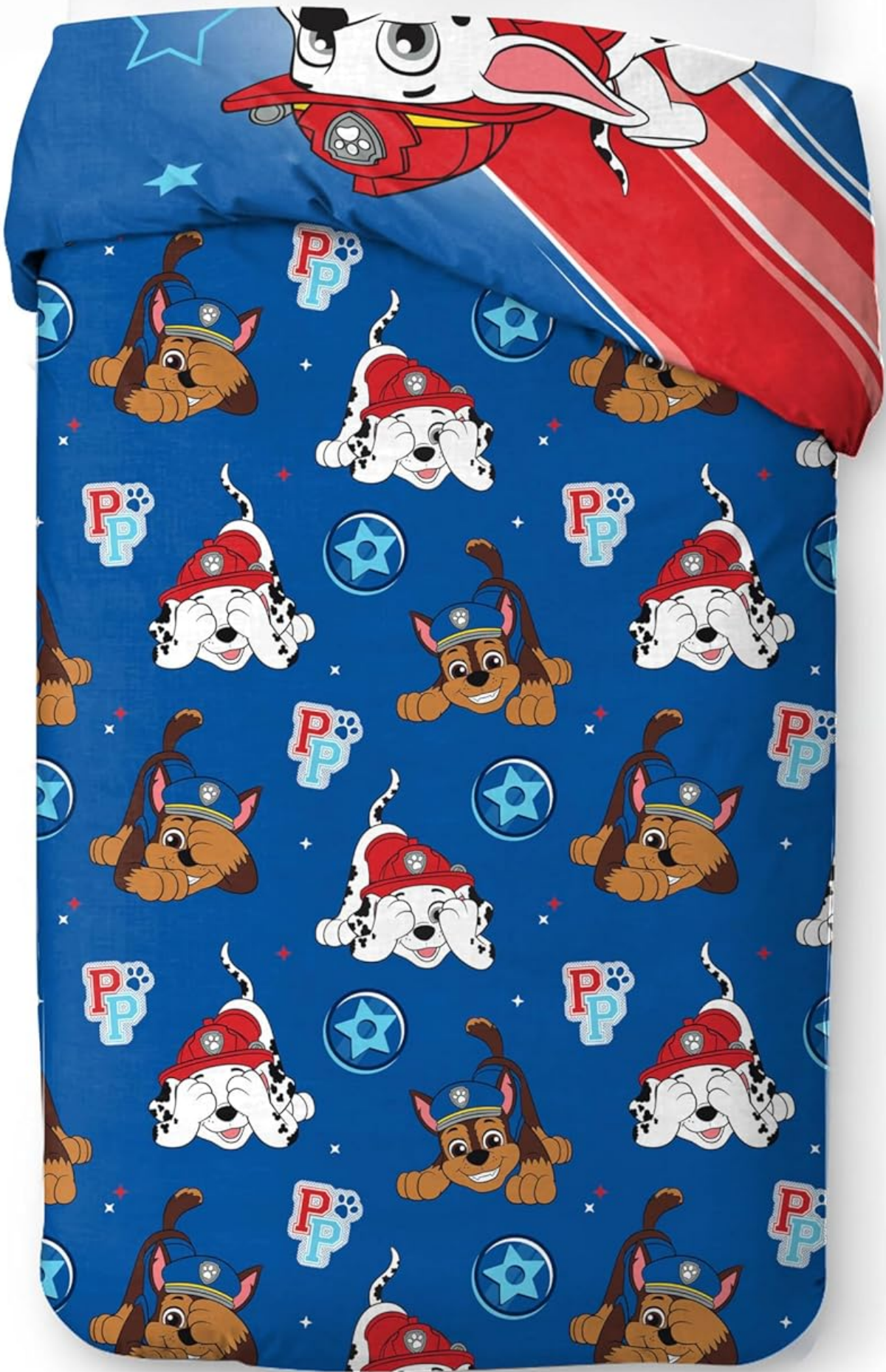
Image: The reversible side of the duvet cover, featuring a repeating pattern of Paw Patrol characters.