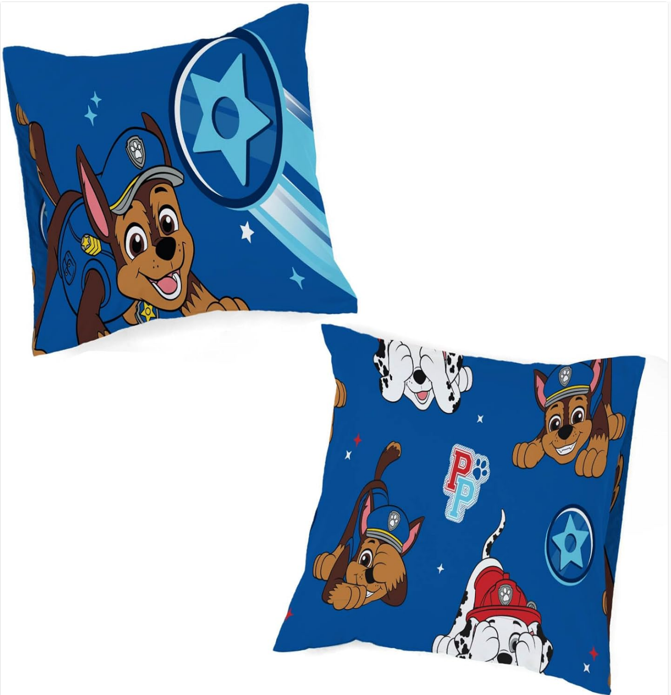
Image: Both sides of the pillowcase, one featuring Chase and the other with a repeating pattern.