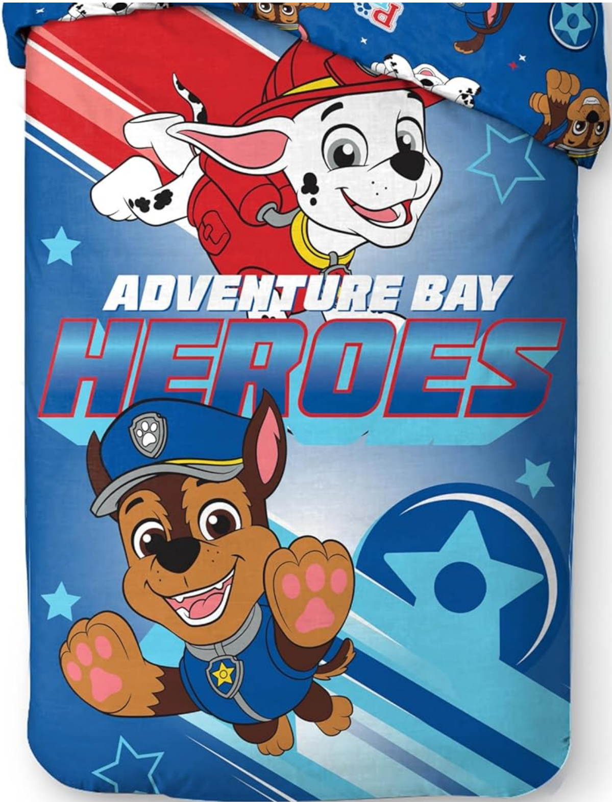
Image: Close-up of the main side of the duvet cover featuring Chase and Marshall.