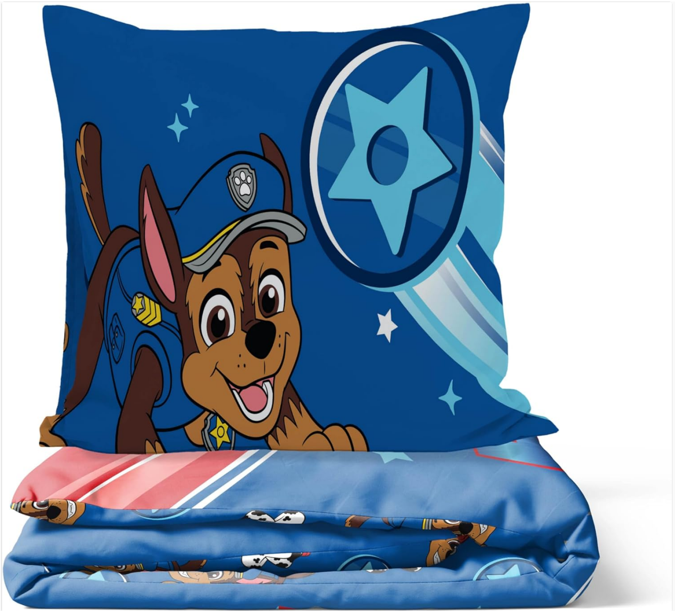
Image: The complete set, including the folded duvet cover and a pillowcase, as received in the package.