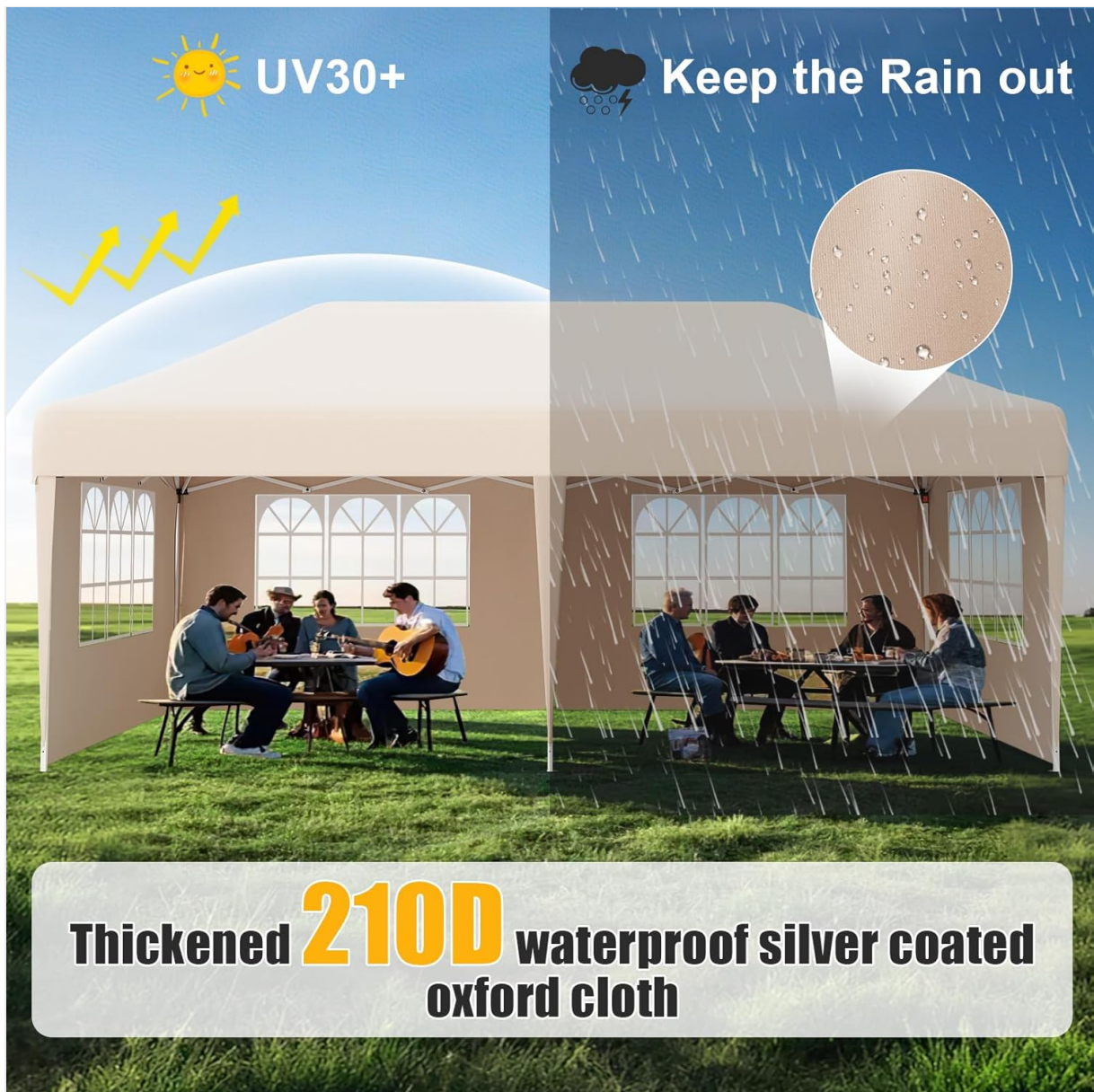
Figure 6.2: UV and Waterproof Features

This image illustrates the UV30+ protection and waterproof capabilities of the gazebo's 210D silver-coated oxford cloth canopy, showing how it repels water effectively.