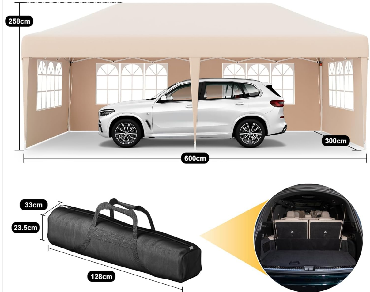
Figure 8.1: Product Dimensions

This image provides a visual representation of the gazebo's dimensions when fully assembled (600cm length, 300cm width, 258cm height) and its compact size when folded and stored in its carrying bag (128cm length, 33cm width, 23.5cm height).