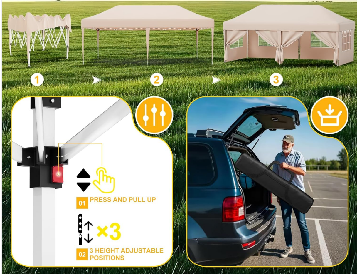
Figure 4.1: Gazebo Setup Steps

This image illustrates the three main stages of setting up the gazebo: unfolding the frame, attaching the canopy, and extending the legs. It also shows a close-up of the height adjustment button.