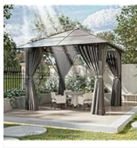
Figure 3.1: Included Components

This image displays the various parts that come with your Devoko folding gazebo, including the frame, canopy, storage bag, side walls, ropes, and ground stakes, along with the instruction manual.