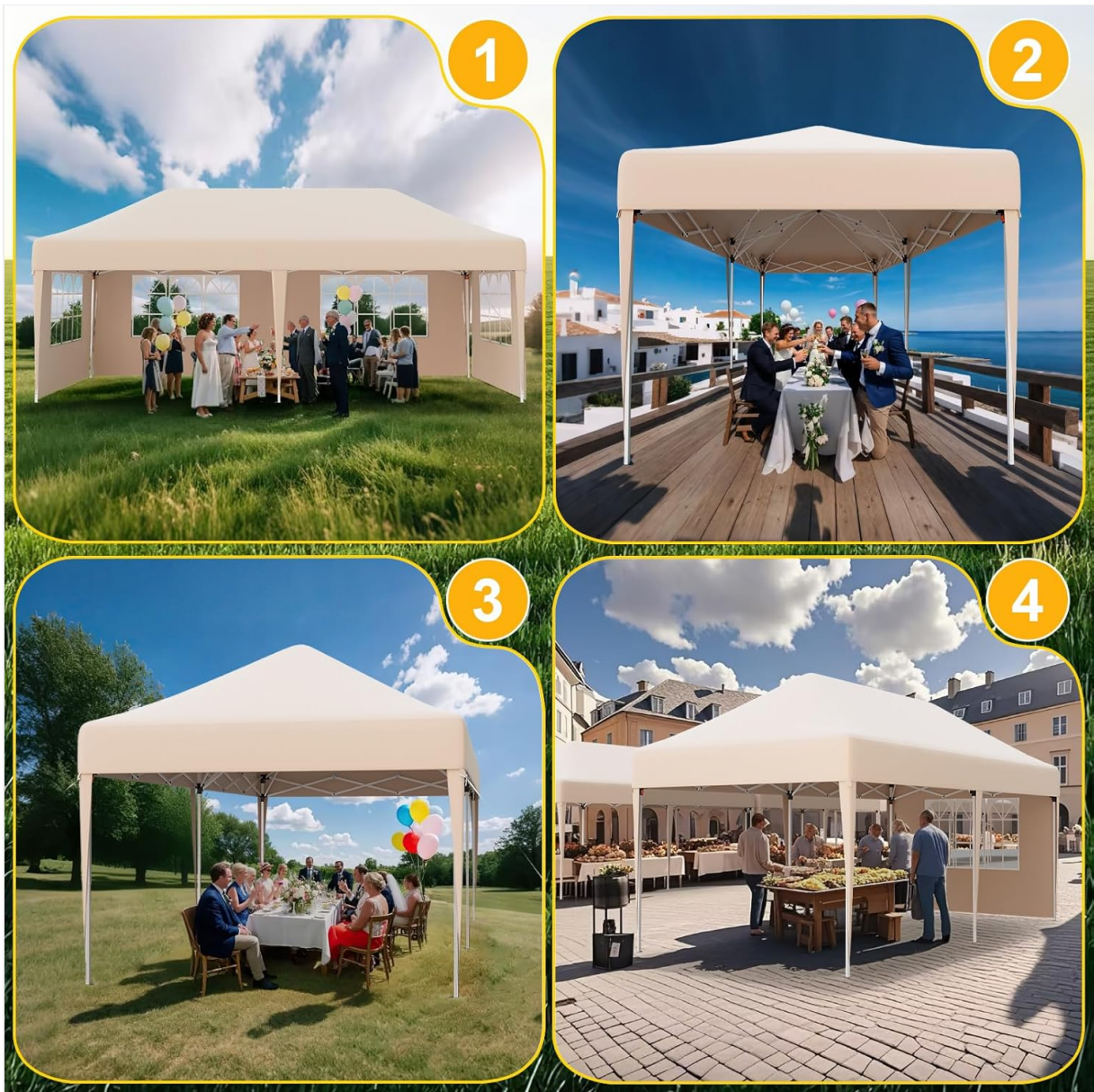
Figure 5.1: Versatile Usage

This image showcases the versatility of the Devoko gazebo, illustrating its use in different settings such as markets, outdoor activities, backyard gatherings, and beaches.