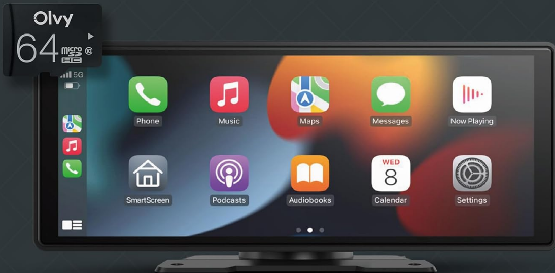
Figure 7.1: Screen size comparison, illustrating the optimal 10.26-inch format for an improved driving experience.