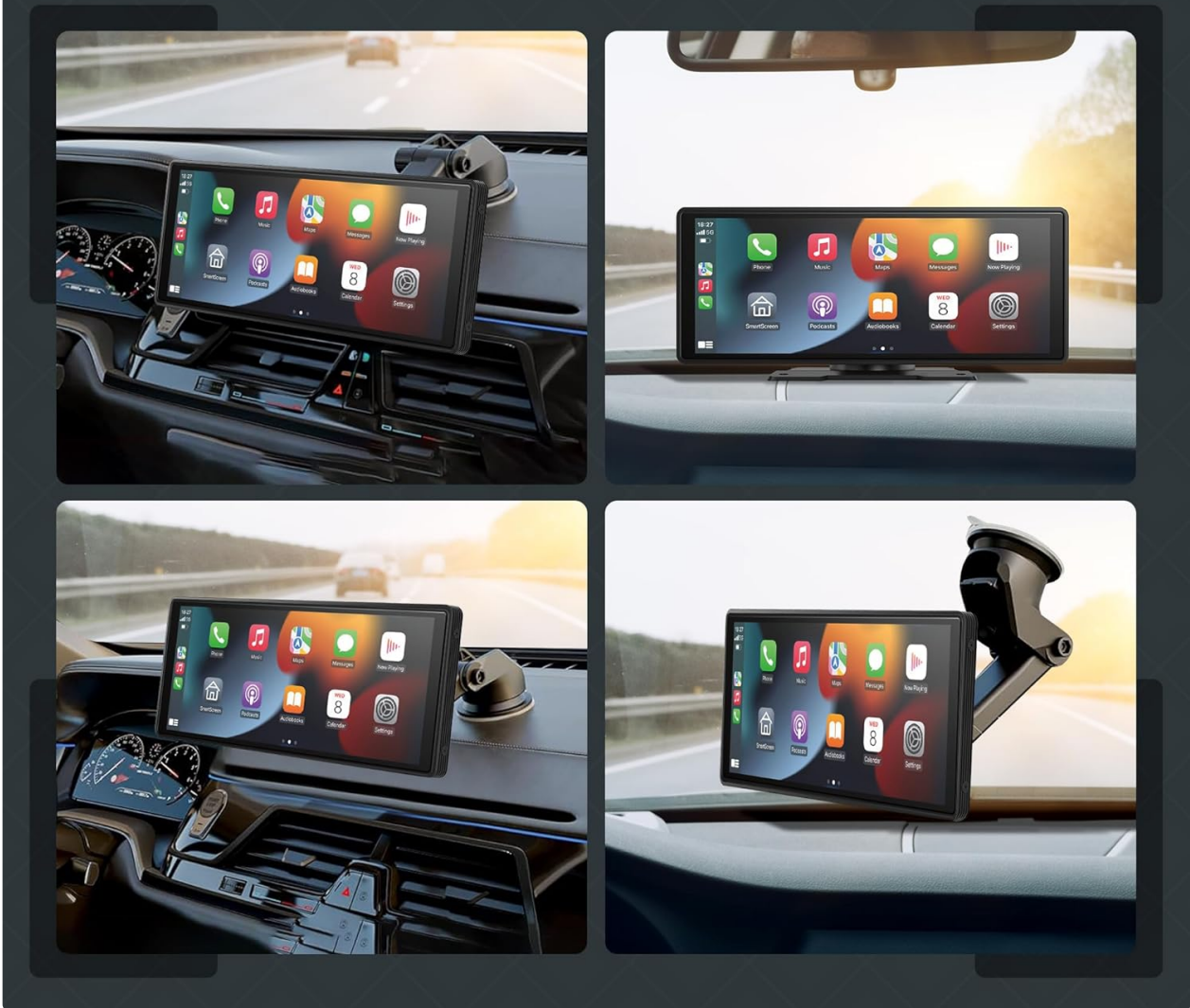
Figure 4.1: Various ways to install the Olvy CarPlay Display in a vehicle.