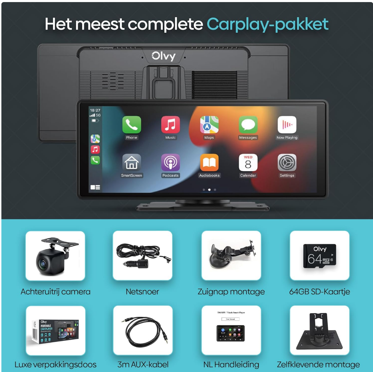
Figure 3.1: All components included in the Olvy CarPlay Display package.