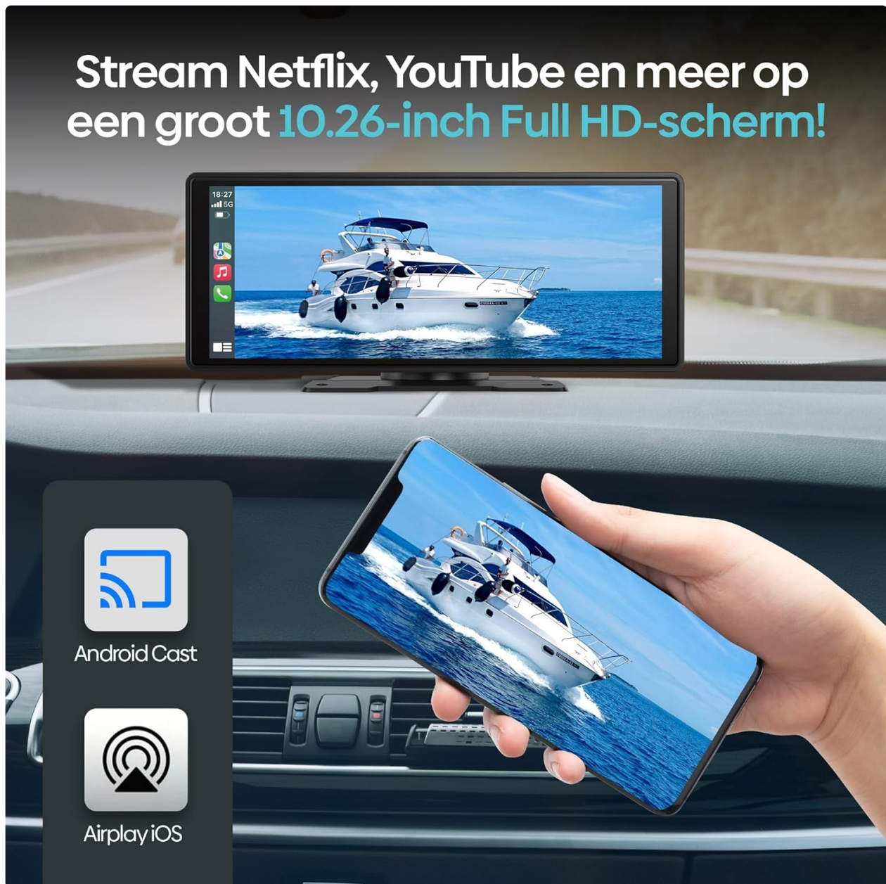
Figure 5.1: Streaming content from a smartphone to the Olvy display using Android Cast or AirPlay iOS.

This feature allows you to mirror your smartphone's screen directly onto the Olvy display. This is ideal for passengers to view videos or other content from a connected phone.