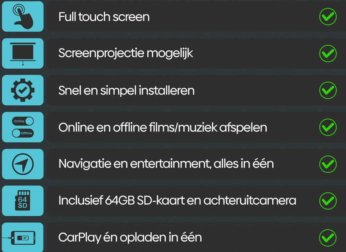
Figure 2.3: Key benefits of the Olvy CarPlay Display, highlighting its full touchscreen, screen projection capabilities, easy installation, media playback, integrated navigation and entertainment, included 64GB SD card and rear camera, and combined CarPlay with charging functionality.