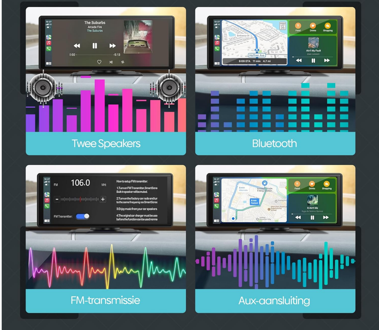
Figure 5.2: Illustration of the four available audio output methods.