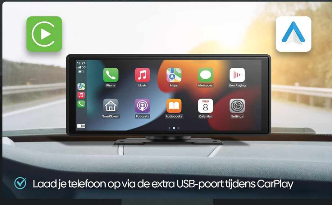
Figure 2.1: Overview of Olvy CarPlay Display key features including Full HD screen, 10.26-inch size, plug & play functionality, mirror link, rear view camera support, and USB charging.