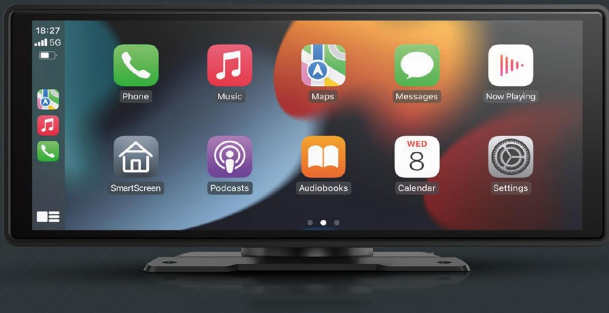
Figure 2.2: The display supports voice control and GPS navigation, showing common app icons for a safer driving experience.