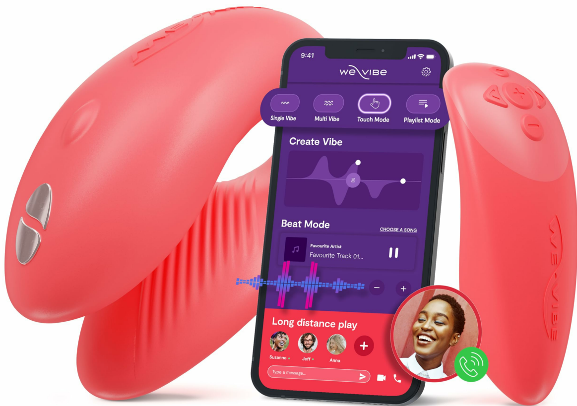
Image: The WE-VIBE Chorus Couples Vibrator in Coral, shown with its remote control and indicating app compatibility.