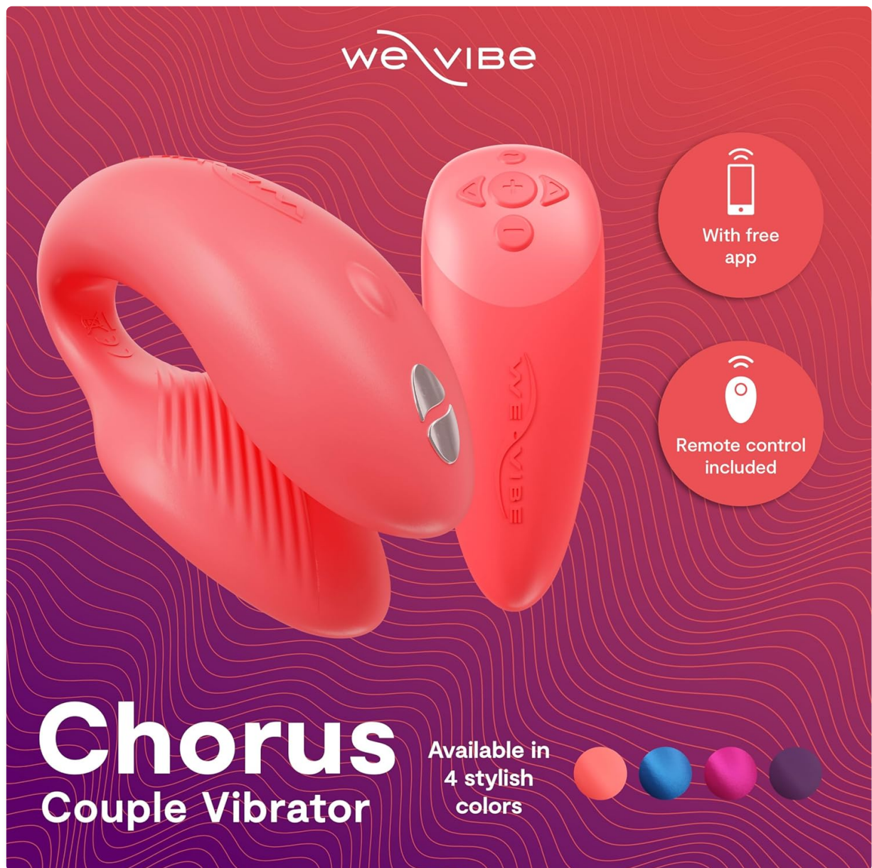
Image: The WE-VIBE Chorus vibrator and its remote control securely placed within their charging case.