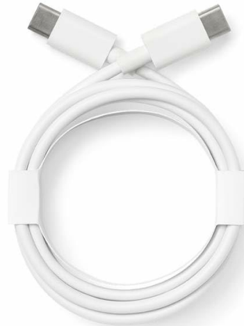
1 m USB-C® to USB-C® cable (USB 2.0)