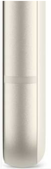
Image: Right side view of the Google Pixel 8a, showing the power button and volume rocker.