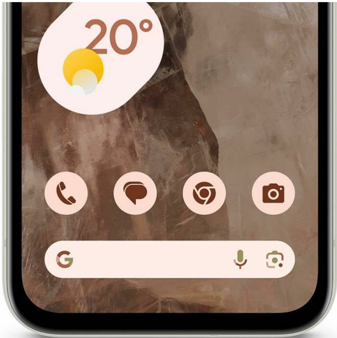
Image: Front view of the Google Pixel 8a displaying the Android home screen with widgets and app icons.