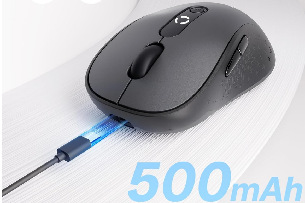
Image: The XBG B15 mouse connected to a charging cable via its Type-C port, illustrating the recharging process and highlighting its 500mAh battery capacity.