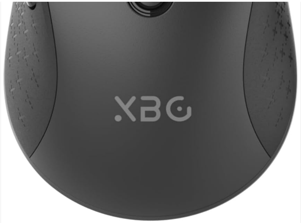
Image: Top-down view of the XBG B15 Tri-Mode Wireless Mouse, showcasing its ergonomic design and central DPI button.