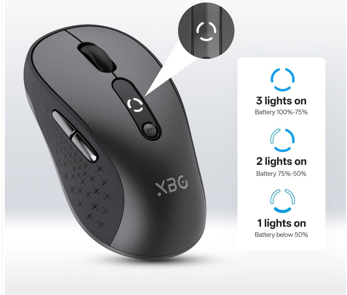
Image: Close-up of the XBG B15 mouse's display, showing the 3-level battery indicator and its corresponding battery percentage ranges.