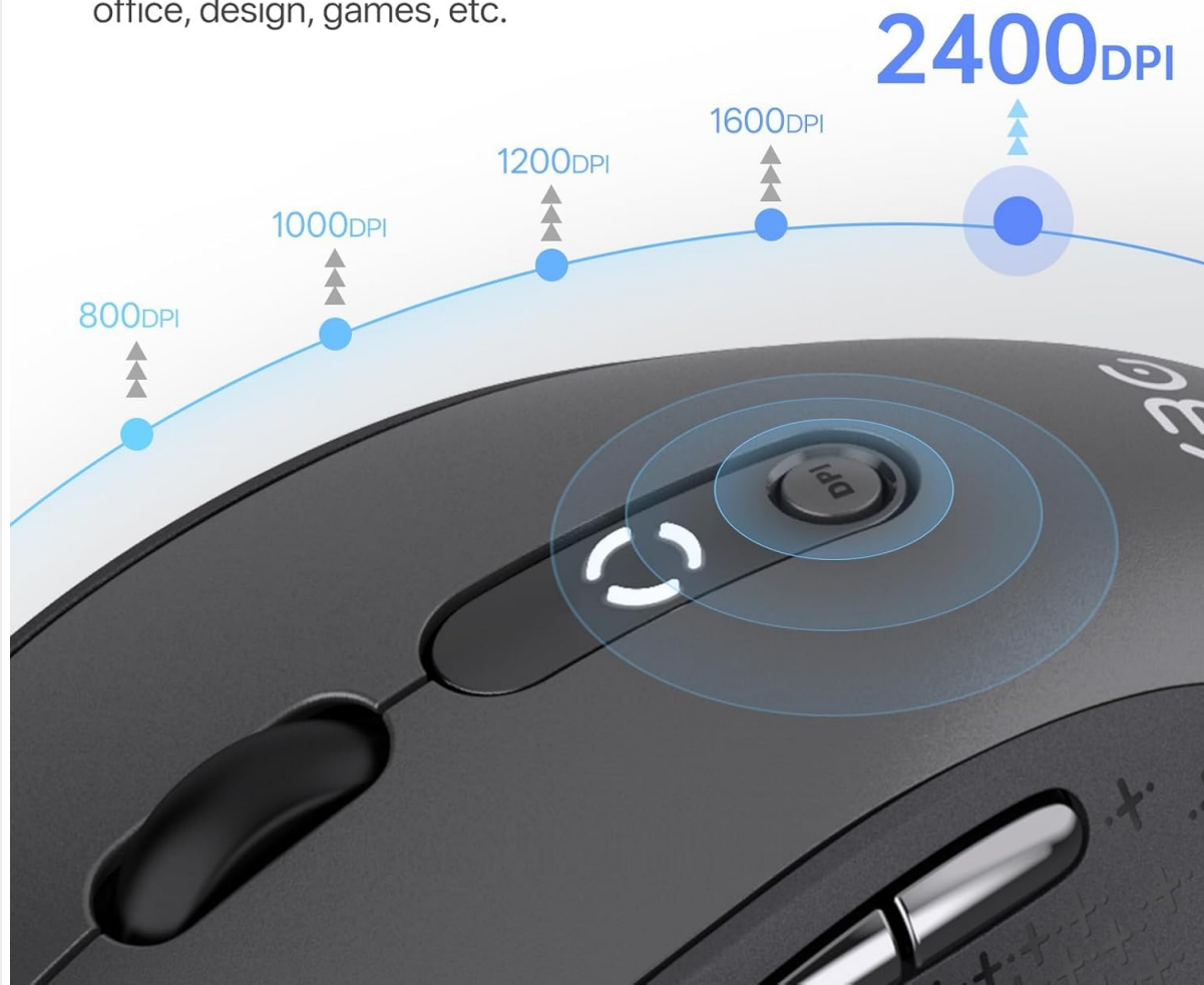
Image: Diagram illustrating the 5 adjustable DPI levels (800, 1000, 1200, 1600, 2400) and how to change them using the DPI button on the XBG B15 mouse.

800-2400 DPI, easily meet different needs such as office, design, games, etc.