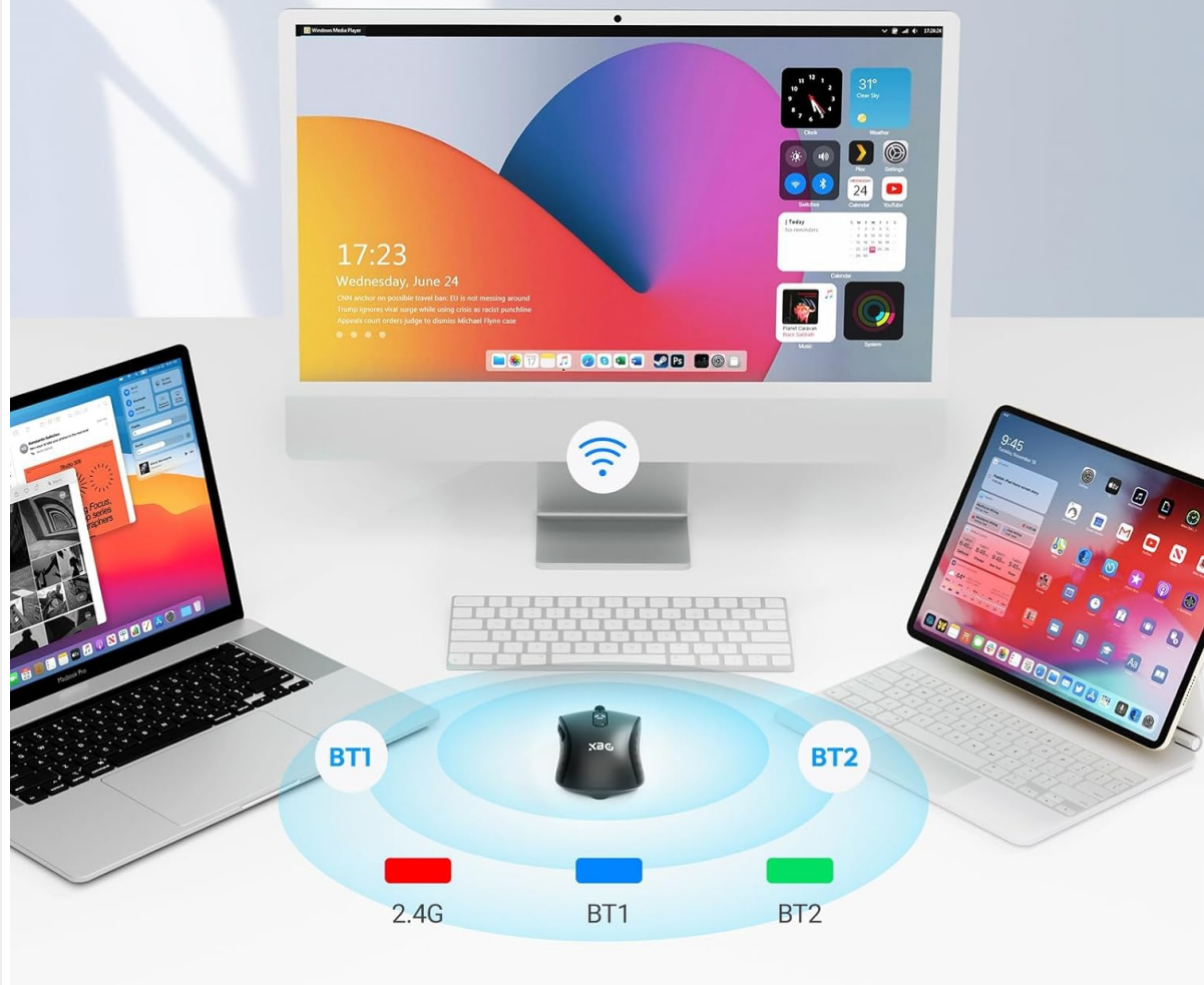
Image: Illustration showing the XBG B15 mouse connecting to a desktop PC via 2.4G wireless and to a laptop and tablet via Bluetooth (BT1 and BT2), indicating its tri-mode capability.

A mode switch indicator light on the bottom of the mouse will show the current connection mode: