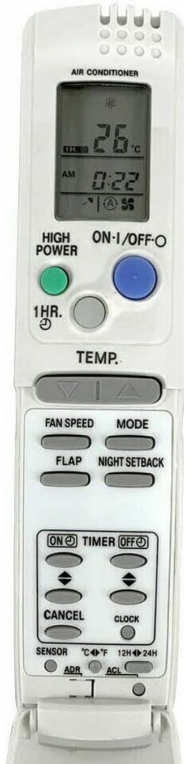
Figure 7: Detailed view of the remote control with the lower flap open, providing a clear look at all the advanced function buttons available for comprehensive control of the air conditioner.