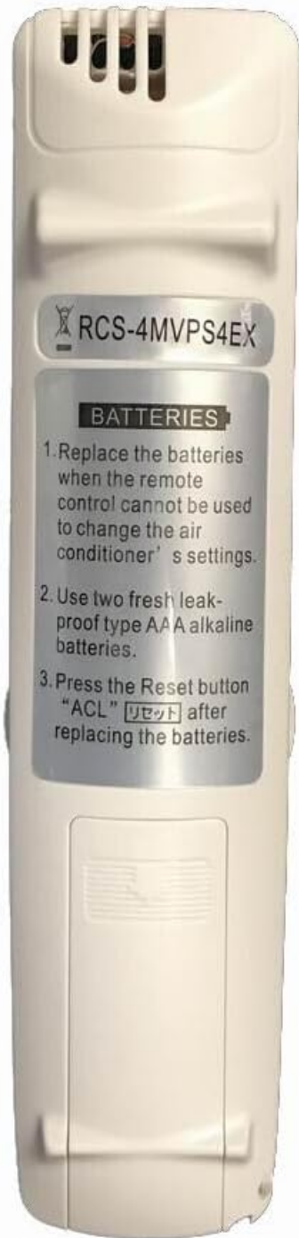
Figure 4: Rear view of the remote control, highlighting the battery compartment cover and printed instructions for battery replacement and reset procedures.