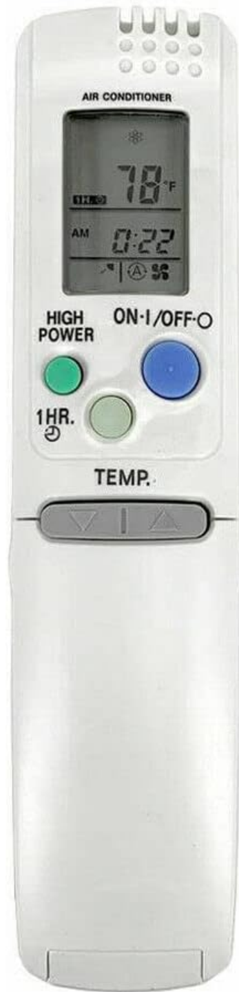
Figure 1: Front view of the remote control, showing the display with temperature set to 78°F, time, and basic function buttons like HIGH POWER, ON-I/OFF-O, 1HR., and TEMP. adjustment.