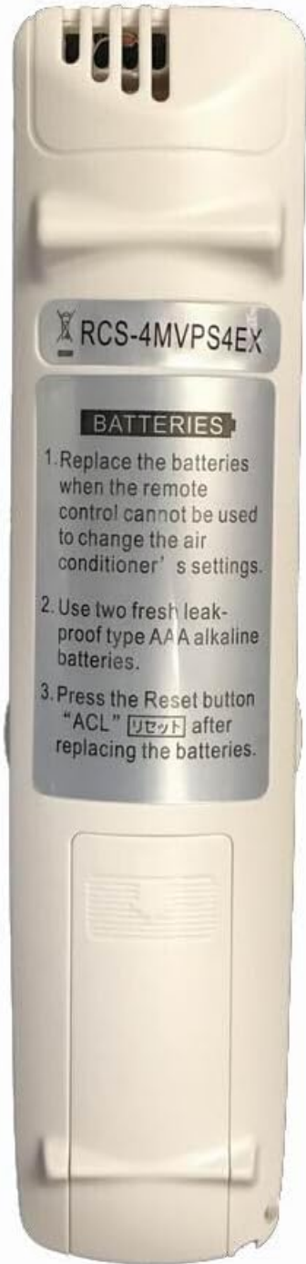
Figure 5: Detailed view of the battery compartment on the back of the remote, illustrating where to insert the AAA batteries and the printed instructions for battery replacement and reset.

Note: The remote control does not require any pairing or complex setup. Once batteries are installed, it is ready for use with compatible Sanyo Air Conditioners.