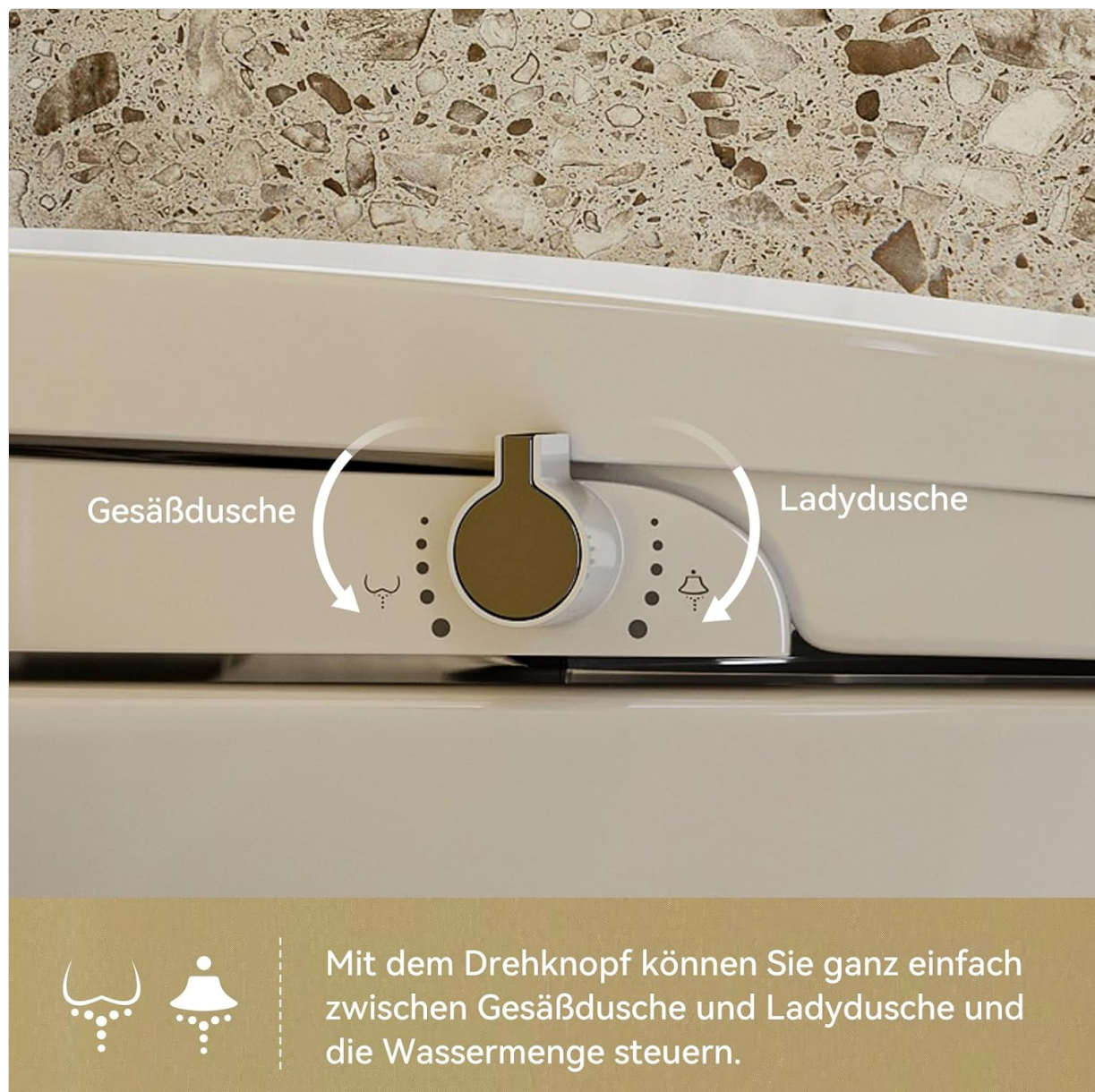
This image shows the intuitive rotary knob control for selecting between the buttock wash and lady wash functions, as well as adjusting the water pressure.