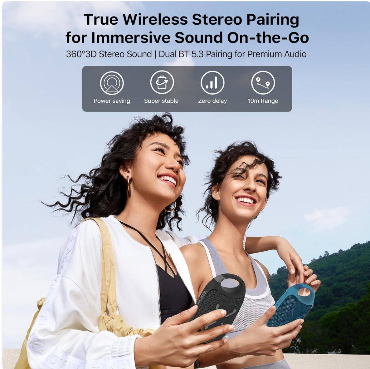
Figure 3: Two speakers connected for Wireless Stereo Pairing.