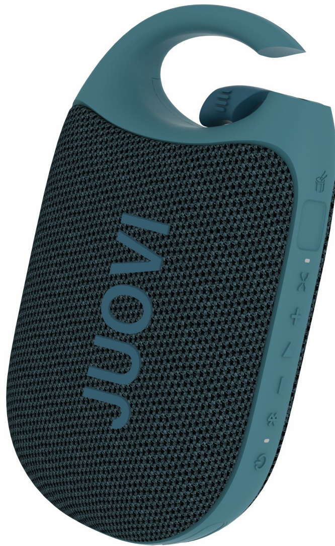
Figure 1: JUOVI CLIP J1 Bluetooth Speaker (Blue)