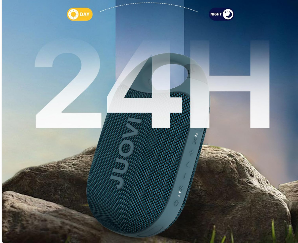
Figure 2: Speaker highlighting 24-hour playtime.