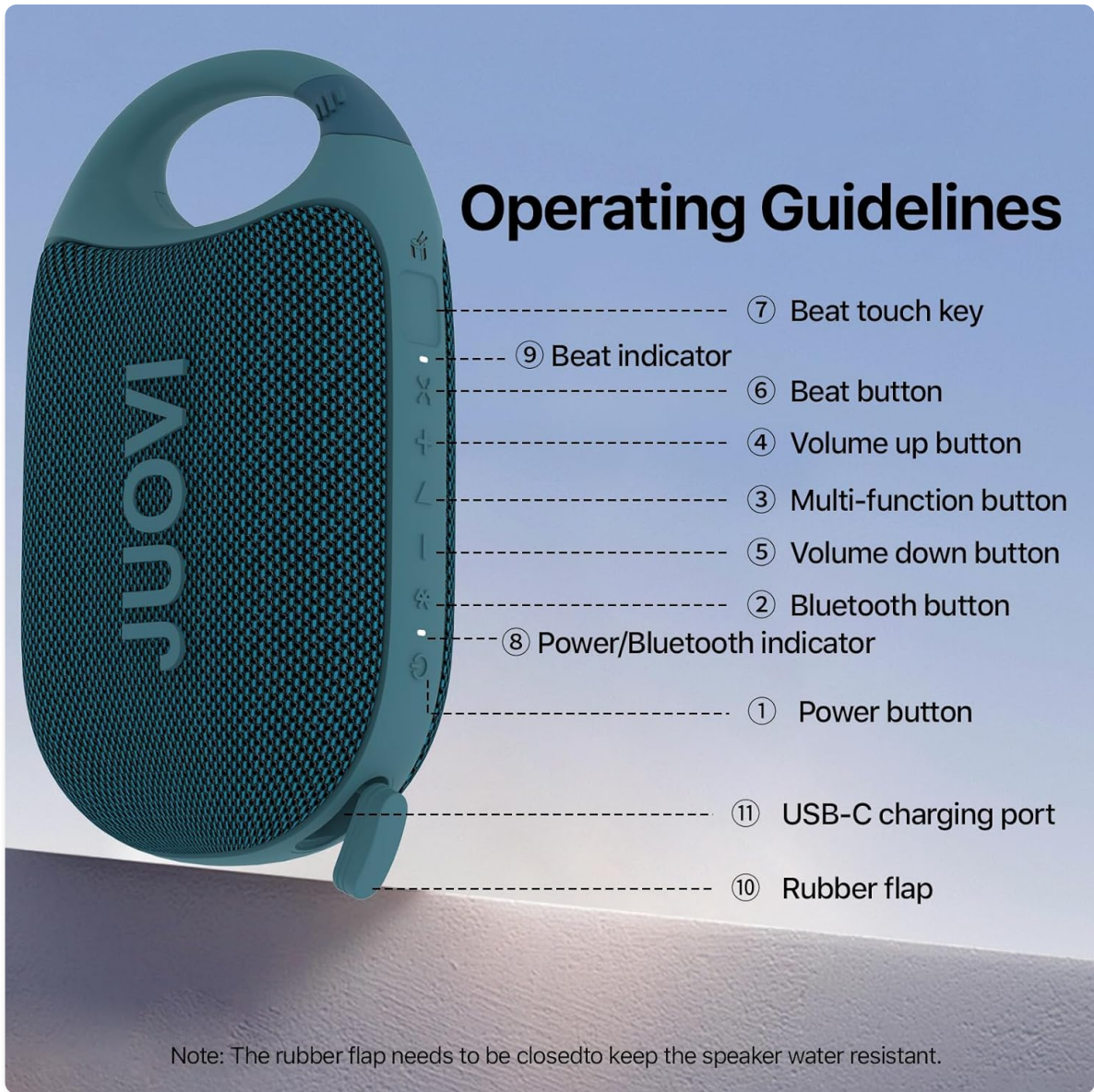
Figure 4: Operating Guidelines and Button Layout.