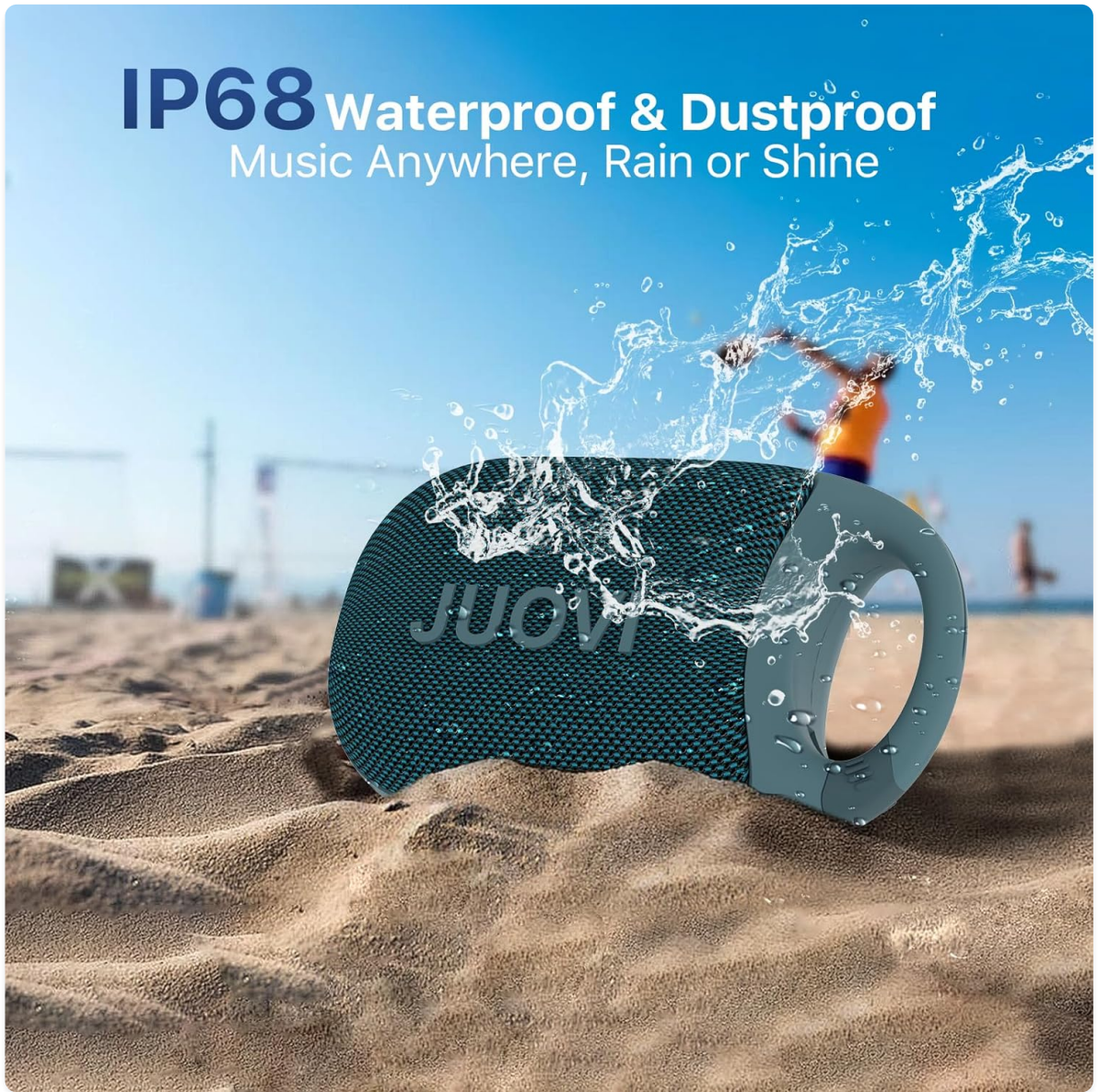
Figure 6: Speaker demonstrating IP68 waterproof capability.