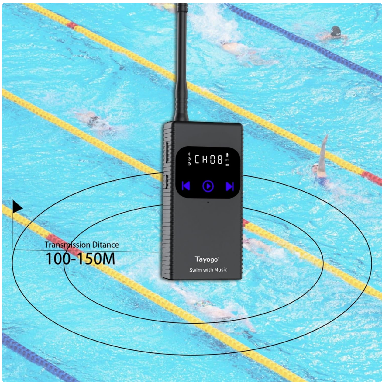
The effective transmission range of the Tayogo T6 in a pool environment.