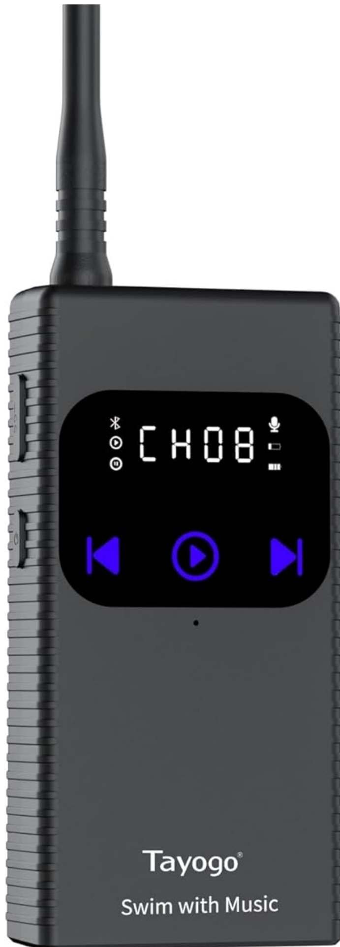
Front view of the Tayogo T6 Wireless Music Transmitter.