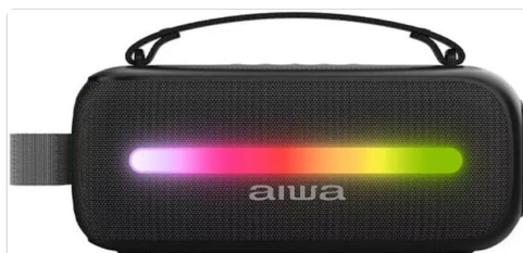
Figure 4.2: Front View of the Speaker. The front panel features the Aiwa logo and a prominent RGB LED light strip, showcasing its aesthetic appeal.