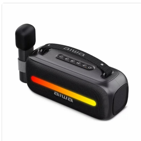
Figure 4.1: Aiwa AWS40BT Speaker with Wireless Microphone. This image shows the speaker from an angled perspective, highlighting its compact design and the microphone attached to its side.

Familiarize yourself with the components of your Aiwa AWS40BT speaker.