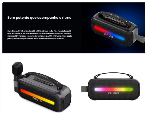
Figure 4.3: Top Control Panel. This image displays the intuitive control buttons on the top surface of the speaker, including power, volume, play/pause, mode, and light controls.