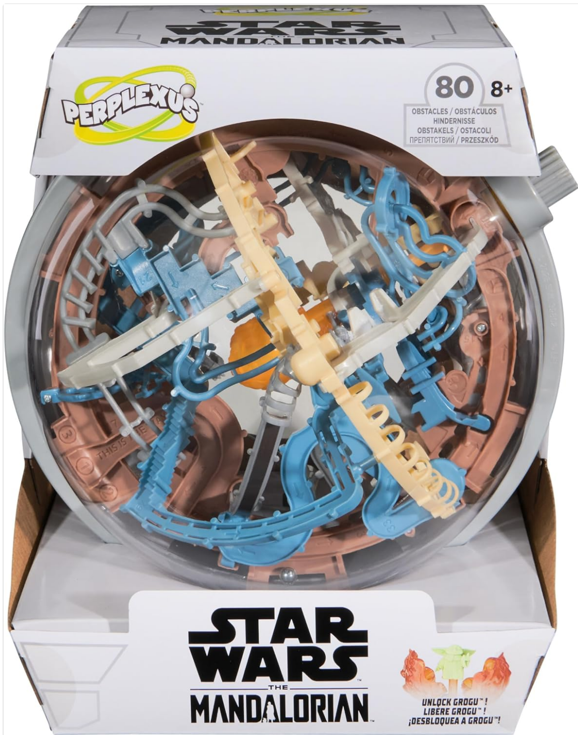
Image: The Perplexus sphere shown in its retail packaging, highlighting the 80 obstacles and Grogu miniature.