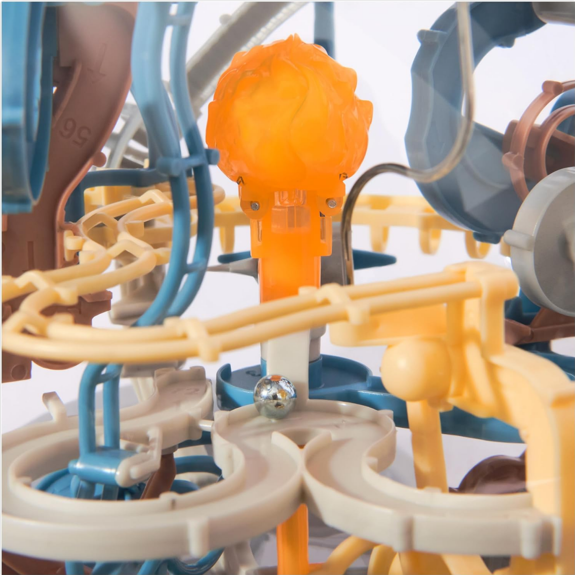
Image: A detailed view of the metal ball on one of the maze tracks, illustrating the intricate pathways.