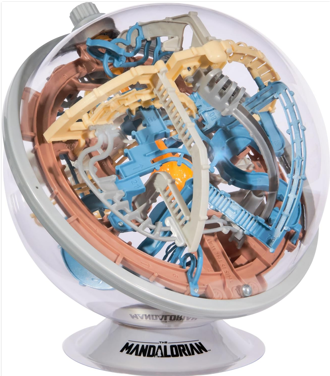
Image: The Perplexus sphere resting on its Mandalorian-branded display stand, showcasing the intricate maze structure.