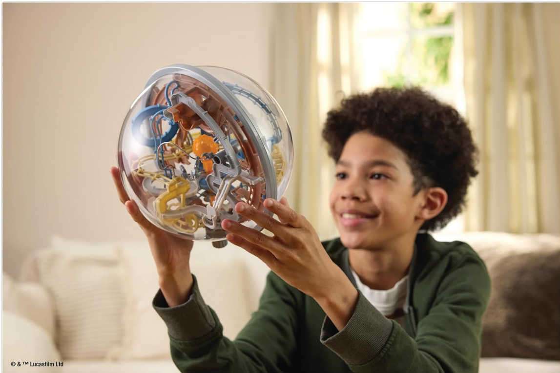
Image: A user holding the Perplexus sphere, demonstrating the interactive nature of the game.