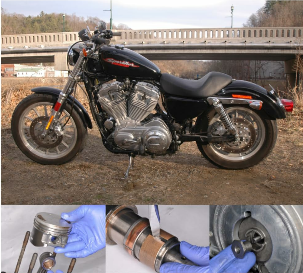
Image: Front cover of the Cyclepedia Service Manual, displaying the title and motorcycle models covered.

2004 - 2006 Harley-Davidson Sportster 883 / 1200