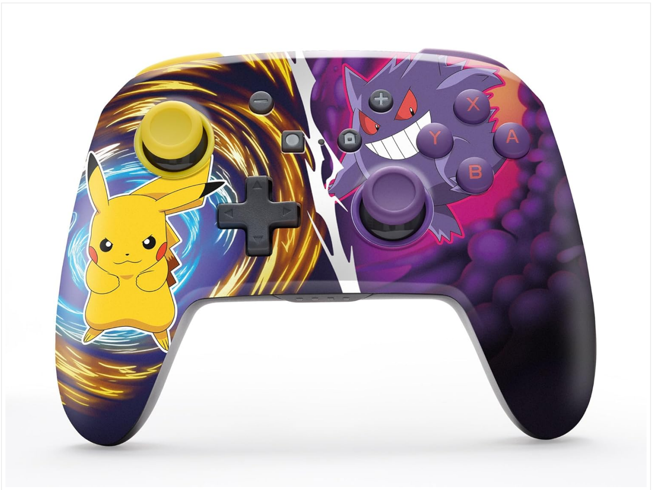
The PowerA Enhanced Wireless Controller with Pikachu vs. Gengar artwork.