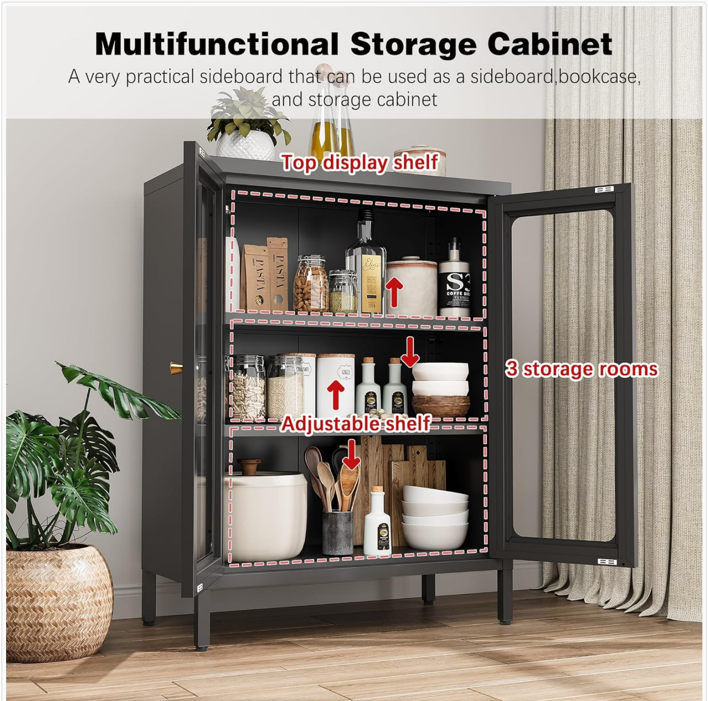
Figure 5: Cabinet Interior with Adjustable Shelves

The cabinet features two adjustable shelves. To adjust a shelf, remove all items from it, then carefully lift the shelf and reposition the shelf pins into the desired pre-drilled holes along the side panels. Ensure the shelf is level and securely seated on all four pins before placing items back.