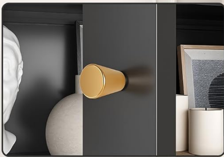
Alumium Alloy Handles