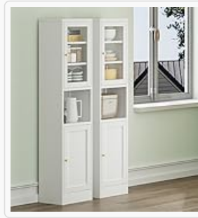
Figure 6: Waterproof Design for Easy Cleaning