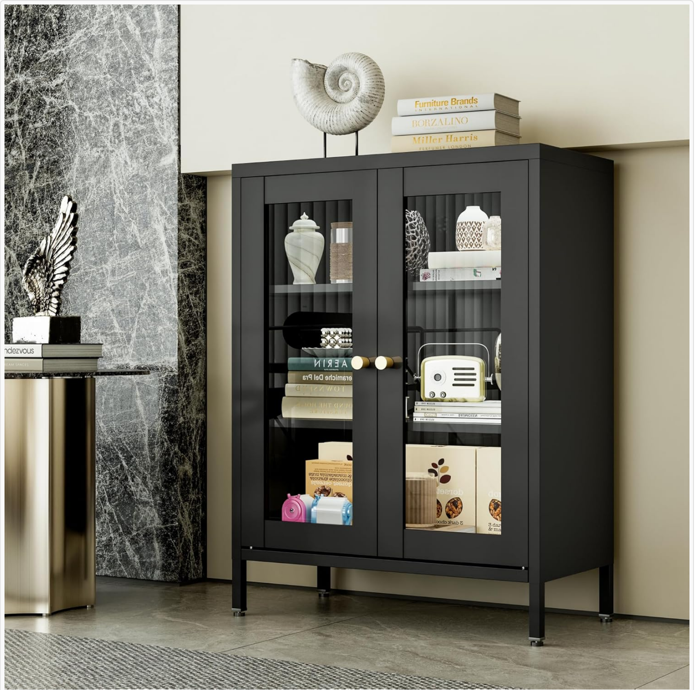
Figure 1: Bevivog Small Display Cabinet (Model YXM)