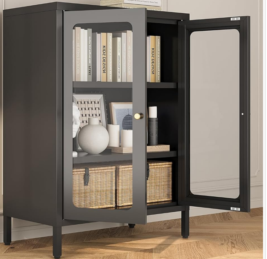
Figure 3: Detailed Features: Magnetic Door Stopper, Adjustable Shelves, Handles, and Adjustable Feet