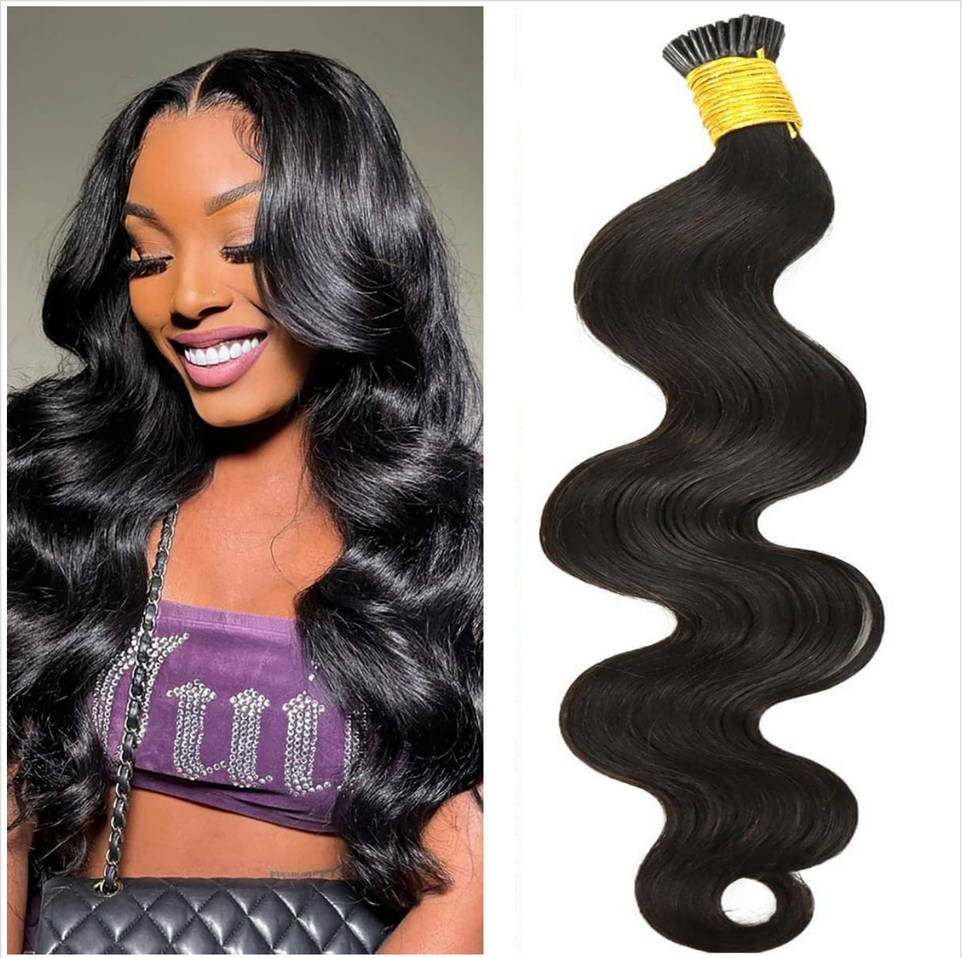
Image: Example of Smartinnov I-Tip extensions styled with a natural body wave.