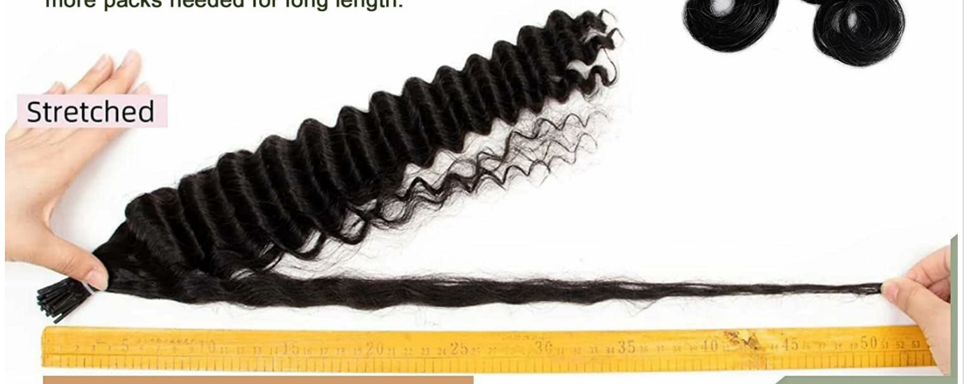
Image: Detailed information on keratin stick tipped hair extensions, including strand count and weight recommendations.