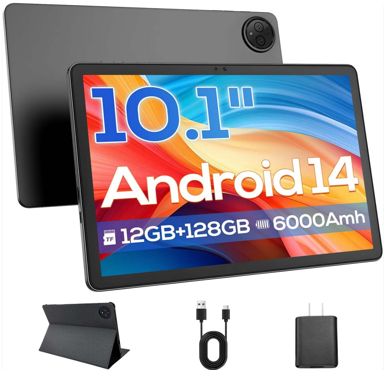
Image: The DigiLand R10 Pro tablet, its stand case, charger, charging cable, and user manual are included in the box.