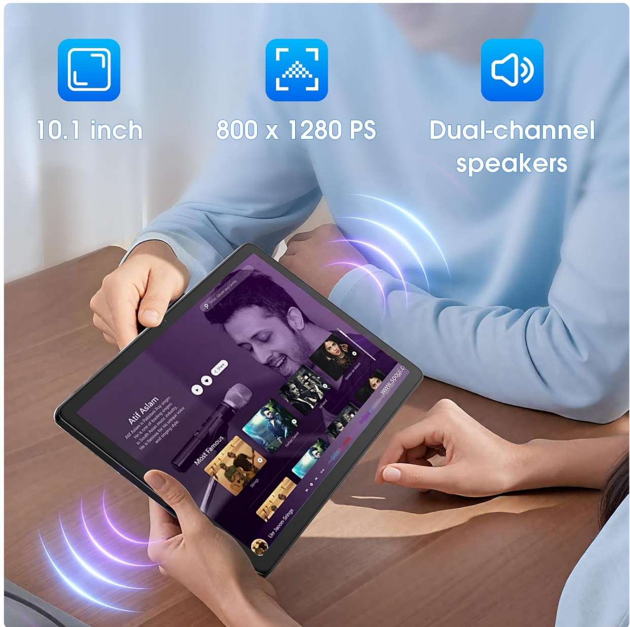
Image: A user holding the tablet, with sound waves emanating from the dual speakers, indicating an immersive audio experience.

The 10.1-inch HD IPS display and dual-channel speakers enhance your media experience. Enjoy movies, music, and e-books with vibrant colors and clear audio. The Widevine L1 certification ensures high-quality streaming from supported platforms.