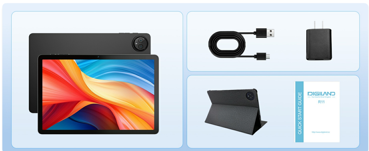
Image: A detailed view of the tablet, case, charger, charging cable, and quick start guide as packaged.