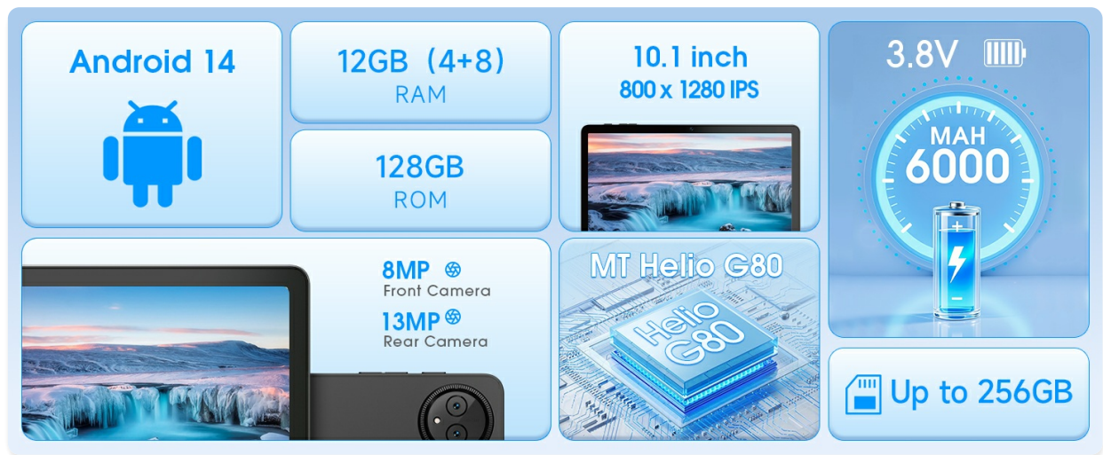
Image: Visual representation of the tablet's operating system, memory, storage, battery, and display.