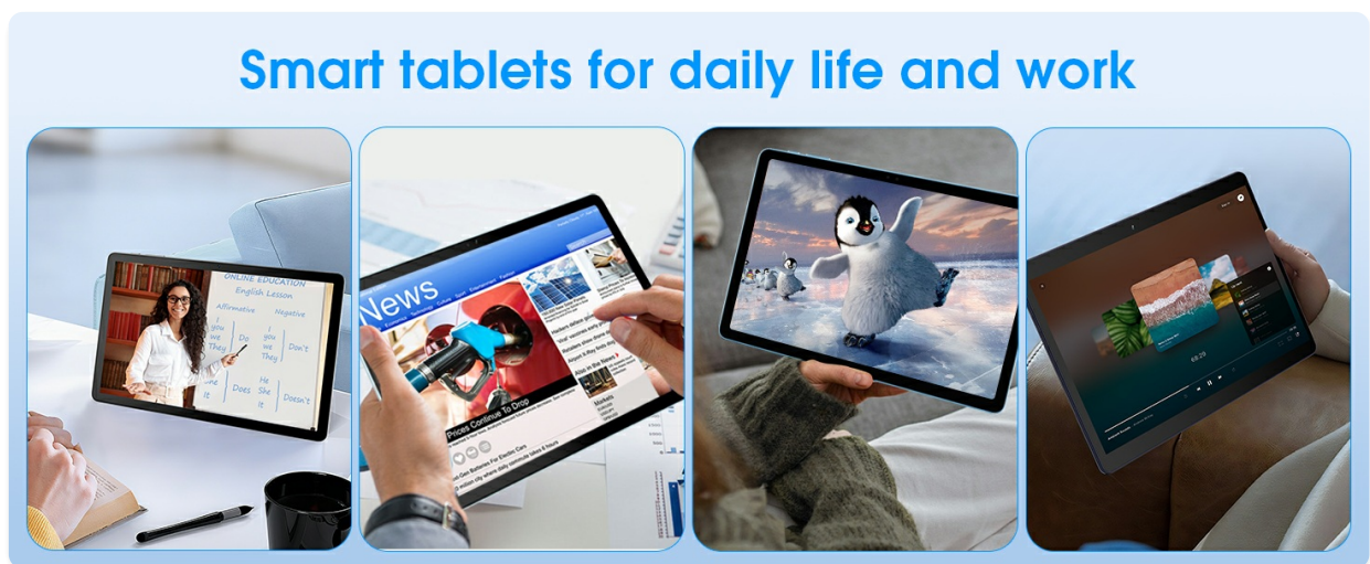
Image: The tablet being used for online education, reading news, watching videos, and reading e-books.

The tablet operates on Android 14, providing an intuitive user interface. Navigate by tapping, swiping, and pinching on the touchscreen. The home screen provides quick access to your most used apps and widgets. Swipe down from the top for quick settings and notifications.