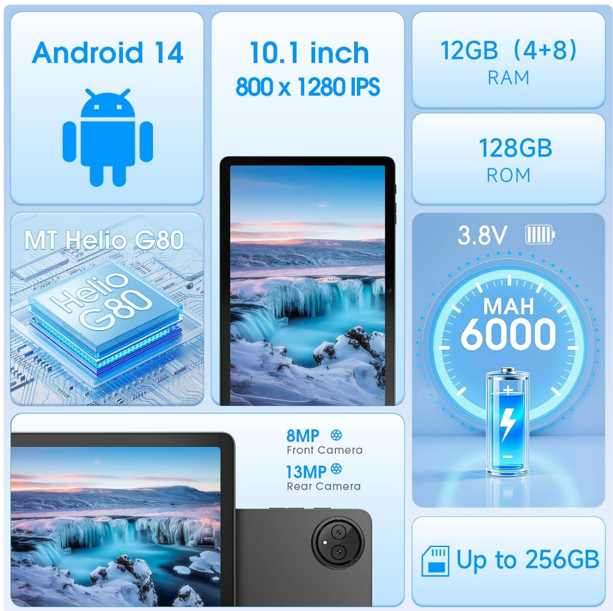
Image: An overview of the tablet's core features and specifications.