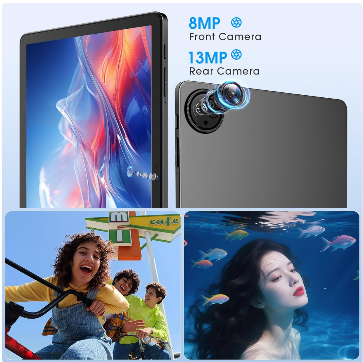
Image: Close-up of the tablet's cameras and sample photos taken with them.