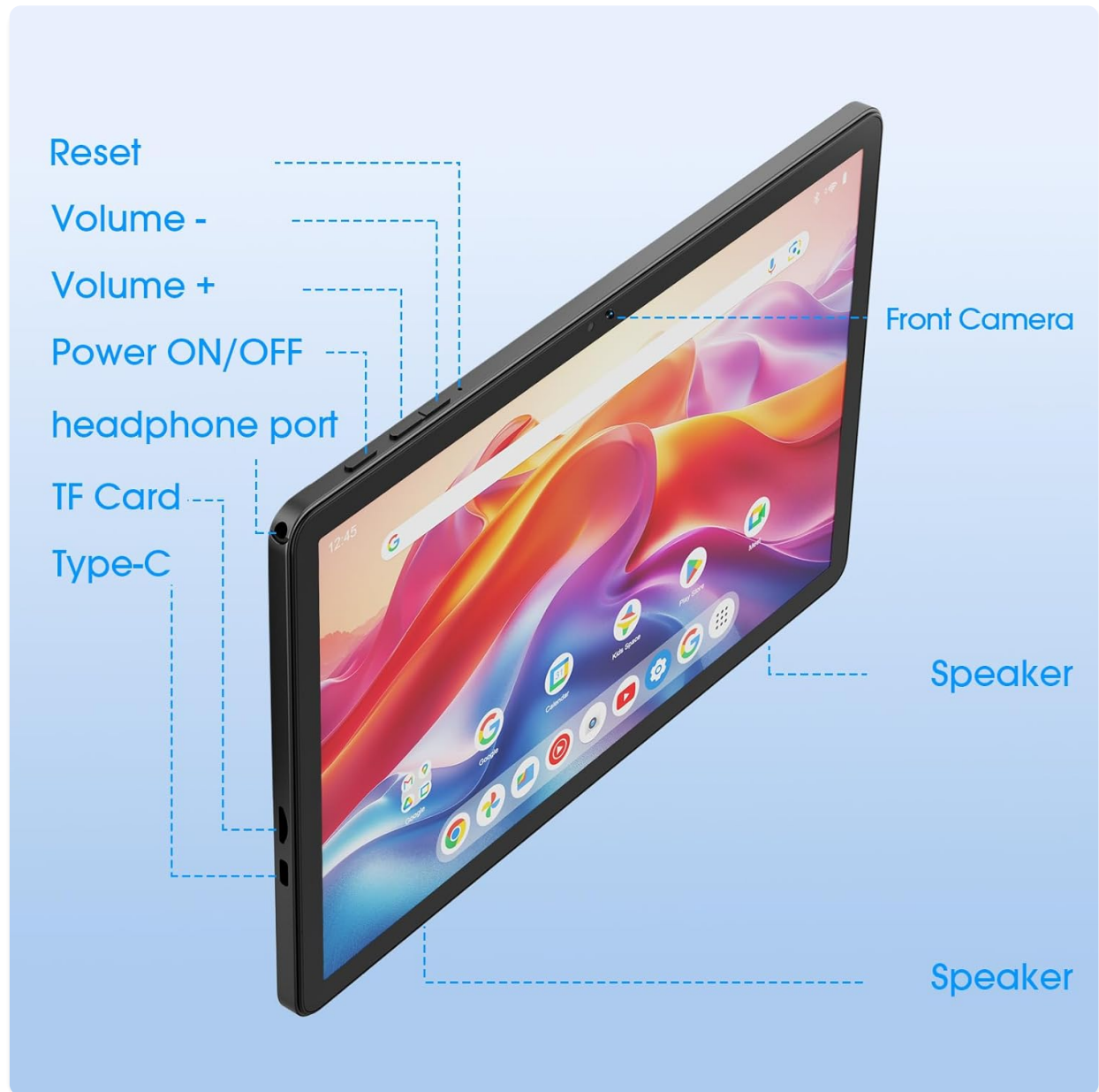
Image: The side of the tablet highlighting the location of the power button and various ports.

To power on your DigiLand R10 Pro tablet for the first time, press and hold the power button located on the top left side (when held in landscape orientation) until the DigiLand logo appears on the screen. Follow the on-screen prompts to complete the initial setup, including language selection and basic settings.