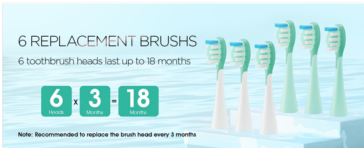
Figure 7.1: Replacement brush heads.

The image displays the six included replacement brush heads, which provide up to 18 months of use based on a 3-month replacement schedule.