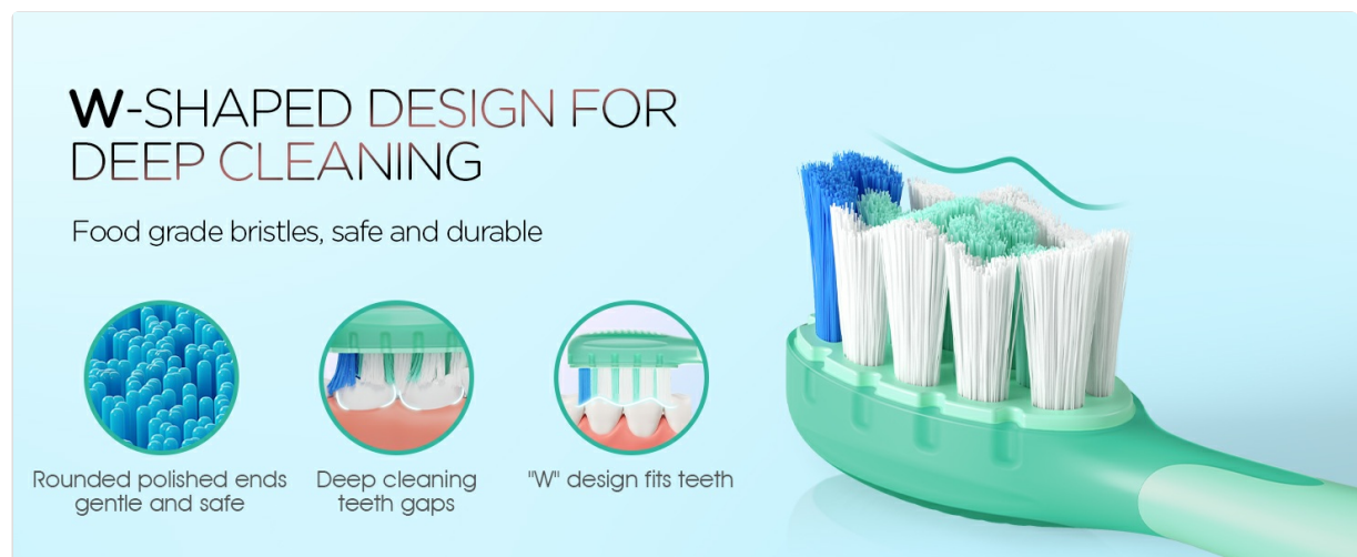
Figure 5.2: W-shaped brush head design.

The image displays the W-shaped brush heads, emphasizing their design for deep cleaning between teeth, soft rubber coating for gum protection, and rounded tips for safety.