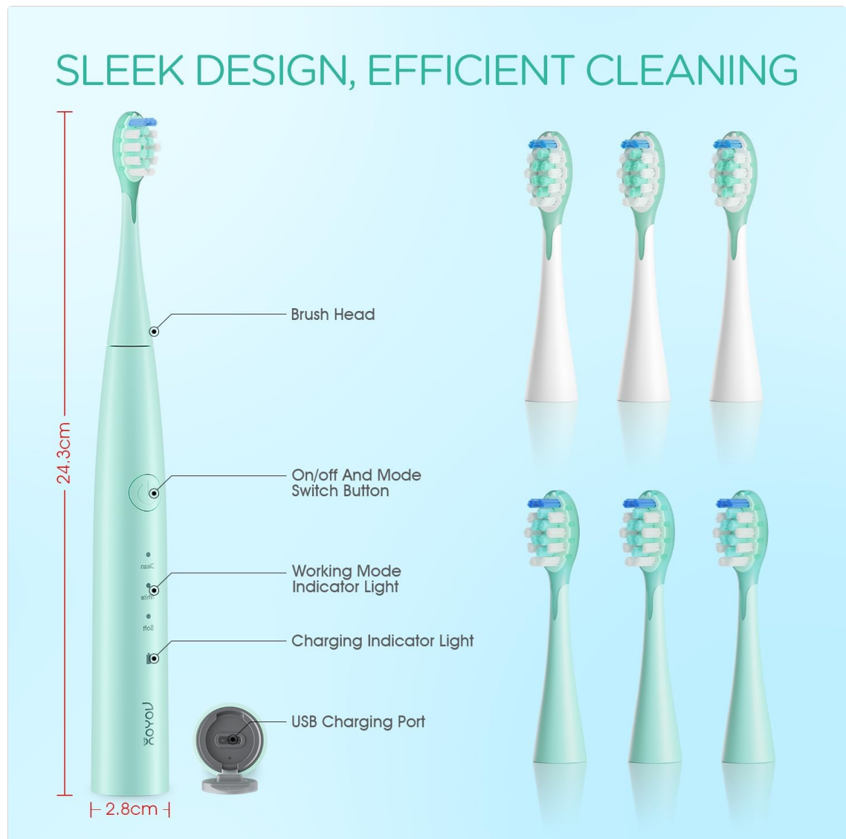
Figure 4.1: VOYOR-HEALTH ET110 Sonic Electric Toothbrush components.

The image above illustrates the main parts of the toothbrush, including the brush head, the power/mode button, indicator lights for modes and charging, and the USB charging port at the base.