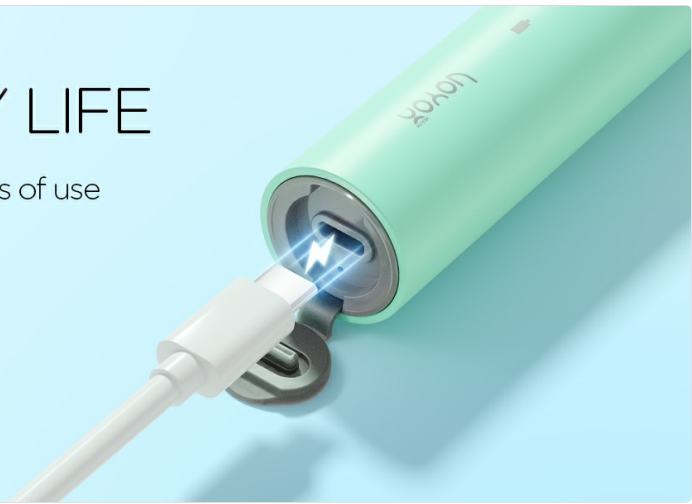
Figure 5.1: Charging the toothbrush.

This image shows the USB-C charging port at the base of the toothbrush handle with the charging cable connected, highlighting the long battery life.