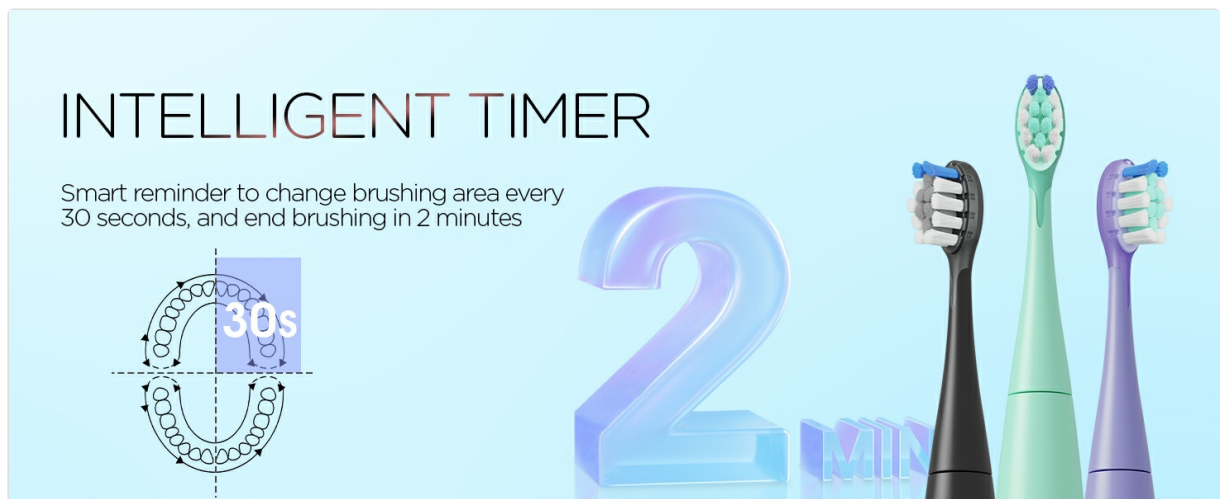
Figure 6.2: Intelligent Timer.

This diagram visually explains the intelligent timer, showing how it prompts users to change brushing areas every 30 seconds for a comprehensive 2-minute clean.