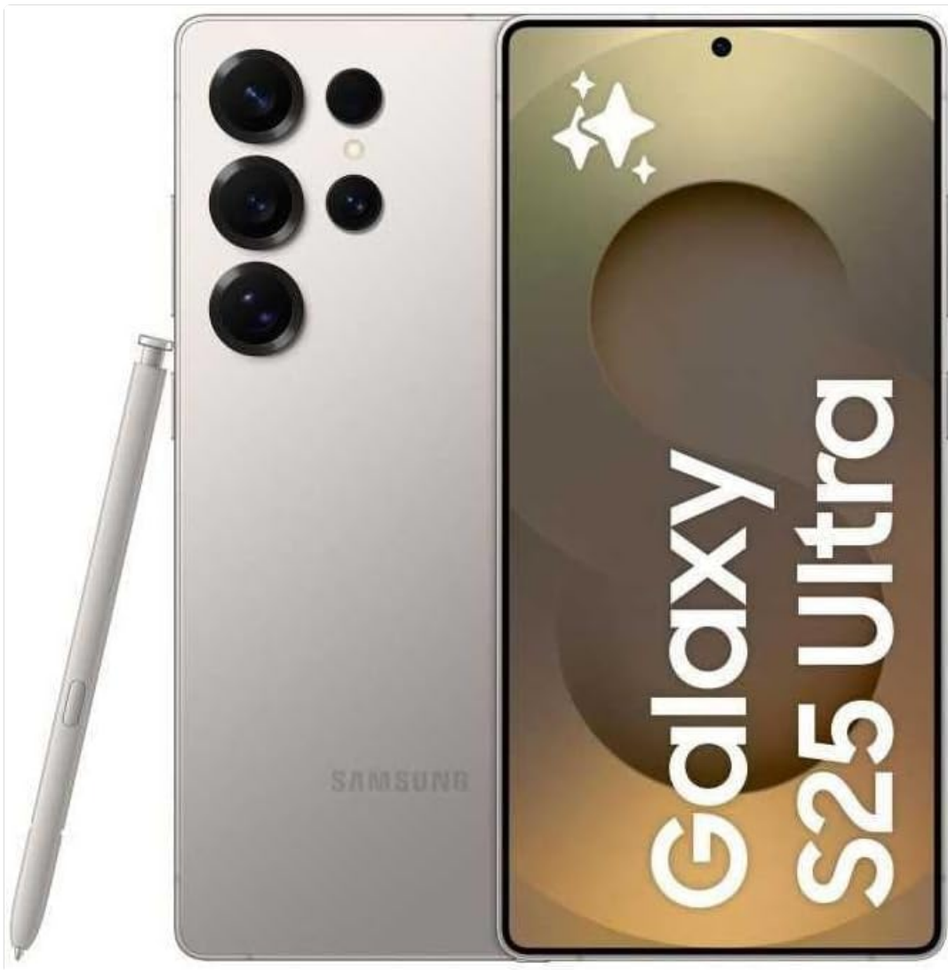
Figure 1.1: SAMSUNG Galaxy S25 Ultra 5G with included S Pen.

The image displays the front and back of the Titanium Grey SAMSUNG Galaxy S25 Ultra 5G smartphone, alongside its S Pen. The phone features a sleek design with multiple camera lenses on the rear.