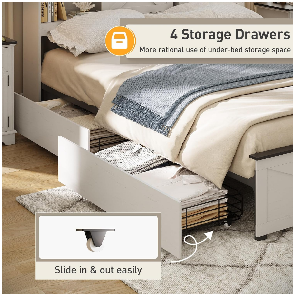
Figure 5.3: Under-Bed Storage Drawers