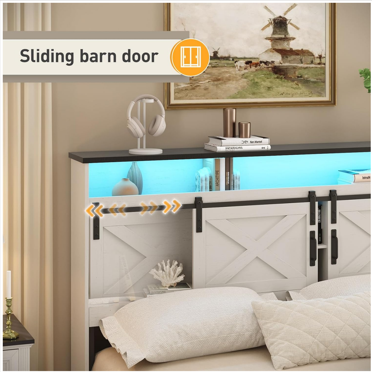
Figure 5.4: Headboard with Sliding Barn Door Storage