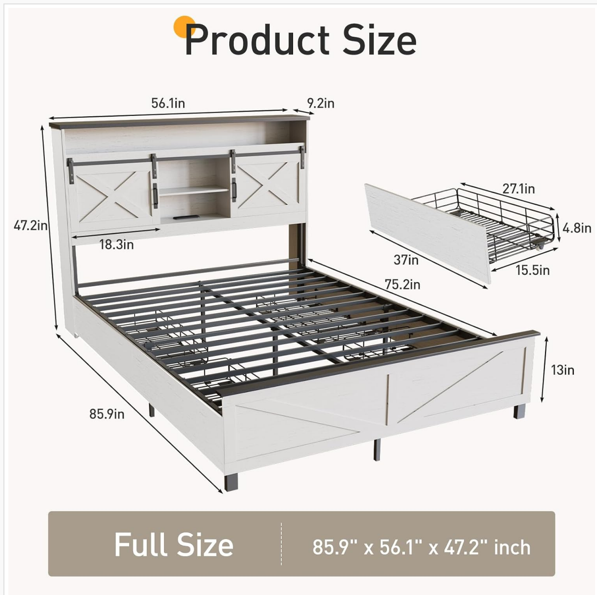
Figure 3.1: Product Dimensions and Key Components