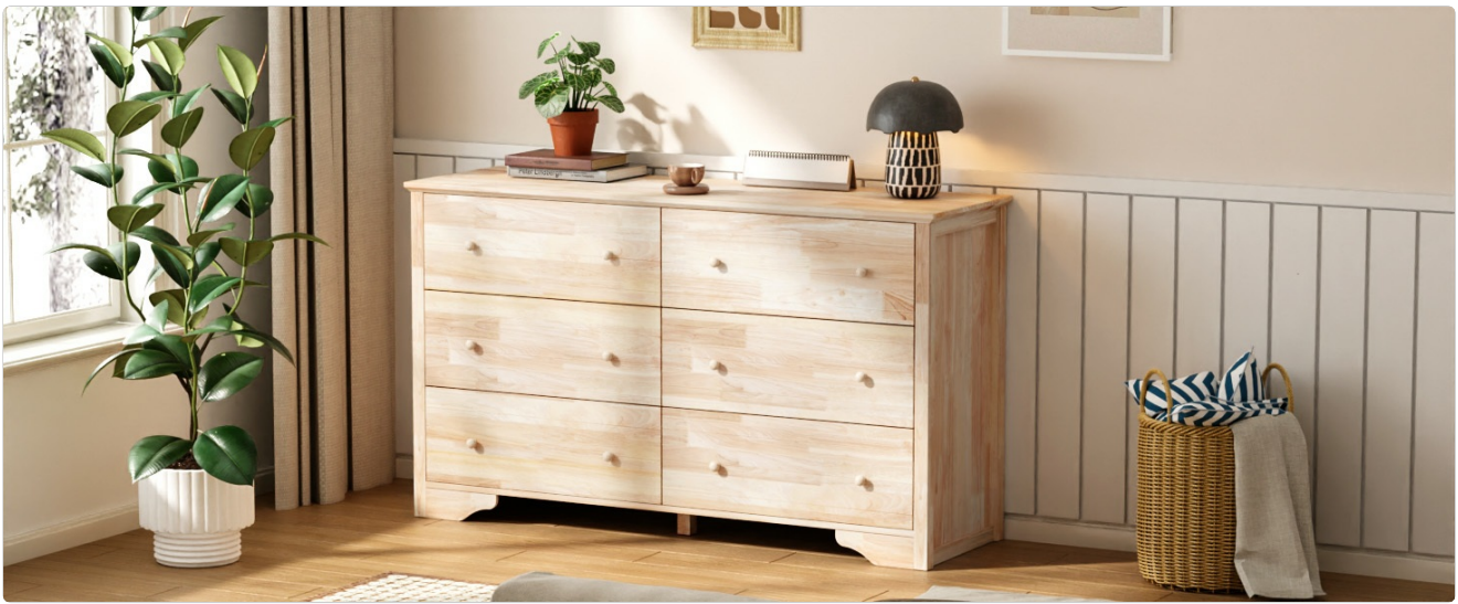
Image: Illustrates the use of natural rubberwood, highlighting its natural smell compared to engineered wood.