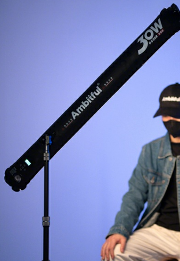
Image: The Ambitful GC30R features a built-in 36Wh Lithium Battery, providing approximately 70 minutes of battery life and supporting 30W fast charging, with a full charge achieved in about 90 minutes.