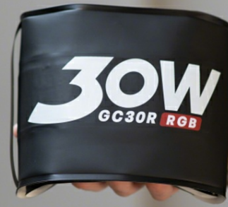
Image: The fully inflated Ambientful GC30R provides an extra-long 90cm luminous surface, ideal for creating broad and even lighting effects.